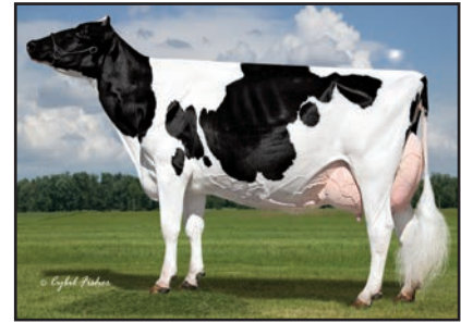
Dubeau Dundee Hezbollah "EX-92 11**" All-American & All-Canadian Sr. 2 Yr Old 2009 (Dam of Lot 21A)

•Sold for $15,000 2023 Shades of Excellence