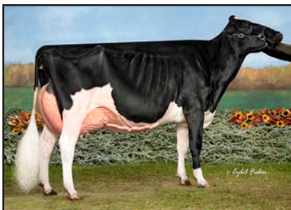
S-S-I Doc Have Not 8784-ET "EX-95" Res. All-American 4 Year Old 2022 (Full Sister to Granddam of Lot 6)

S-S-I Doc Have Not 8784-ET EX-95 EEEEE 4-05 2x 320d 35.670 3.9 1404 3.1 1095 •Res. All-American 4 Year Old 2022 •$1,925,000 pkg Summer Selections Sale II, 2022