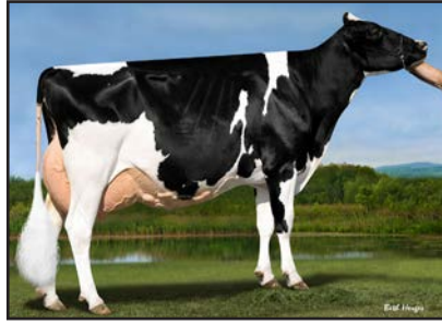
Harvue Goldwyn Foxy Lady-ET "EX-94 4E" (Dam of Lot 19)

Harvue Windhammer Franki-ET EX-94 •2nd 5 Year Old Mideast Spring National 2018 Harvue Windhammer Foxy-ET EX-91 •Res. Grand Champion KY State Fair 2016 Harvue Windhammer Faye-ET EX-92 Harvue Braxton Firefly-ET EX-90 EX-MS 4-09 2x 365d 47,140 2.9 1388 2.9 1376