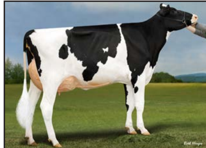
Oakfield Moment Medley-ET "VG-87 VG-MS" 1st Milking Yrlg. SE PA Championship Show 2022 (Dam of Lot 48)