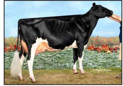
Rosedale Worth Repeating-ET *RC "EX-94 3E" 6th Generation Excellent (Dam of Lot 33B)

3D: Golden-Rose Shott Royal-ET EX-91 2E 5-04 2x 305d 35,110 3.7 1308 3.0 1039 Next 16 dams all Excellent!