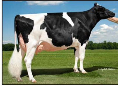
Arethusa Brokaw Anellah-ET "EX-93" (Dam of Lot 58)