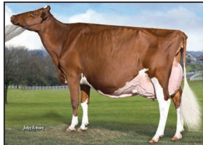
KHW Regiment Apple-Red-ET "4E-96" DOM Grand Champion Int'l R&W Show 2011 (Granddam of Lot 24)