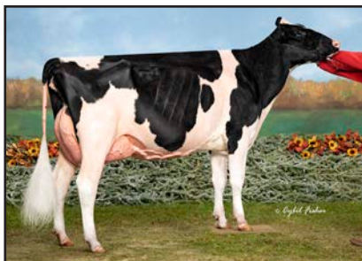
Milksource Storm Kat-ET "EX-92 EX-MS" (Dam of Lot 34)

Ms Milksource RL Krystal-ET EX-95 2-06 2x 365d 32,660 4.2 1380 3.2 1048 •Grand Champion WI Championship Show 2020