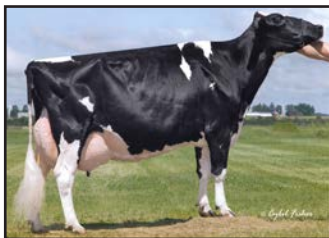
2nd -Look Durhm Juba 3433-ET "EX-95 2E" (Third Dam of Lot 44)

Maternal sister to Jubs: Jenny-Lou-KJ Mogul Jes-Tw VG-86 VG-MS 4-07 3x 365d 41,960 4.9 2044 3.2 1326