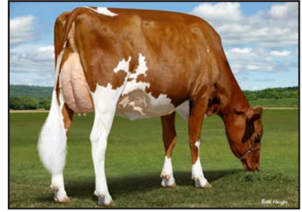
Apple-Pts Aprisco-Red-ET "EX-90 EX-MS" All-American R&W Fall Yearling 2021 (Dam of Lot 23)