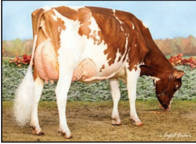
Ms-AOL Cntndr Revive-Red-ET "EX-94" All-American R&W 5 Year Old 2019 (Maternal Sister to Lot 15)