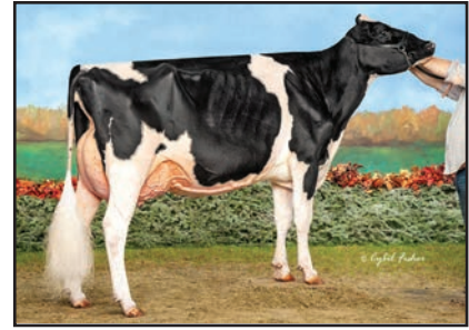
S-S-I Doc Have Not 8783-ET "EX-92"

S-S-I Doc Have Not 8784-ET EX-95 EEEEE 4-05 2x 320d 35.670 3.9 1404 3.1 1095 •Res. All-American 4 Year Old 2022 •$1,925,000 pkg Summer Selections Sale II, 2022