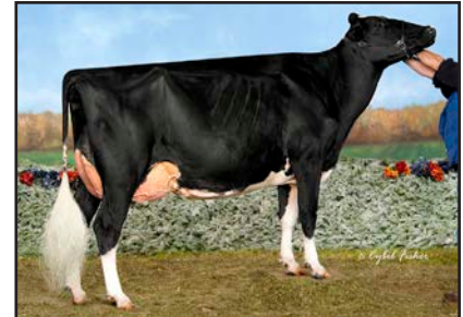
Jacobs Sid Beauty-ET "EX-95" All-American Jr. 3 Year Old 2015 (Granddam of Lot 55)