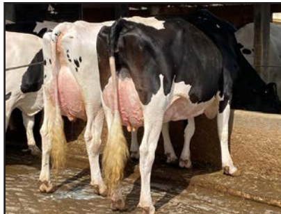
Cow on Right: MD-Maple-Dell Toohot Angie "EX-94" (Dam of Lot 16)

Five (5) female pregnancies due late November, early December 2023. •Guarantee 2 December females in choice