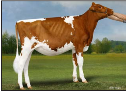
Ms D-N-R Bashful-In-Red-ET *PO (Dam of Lot 41)