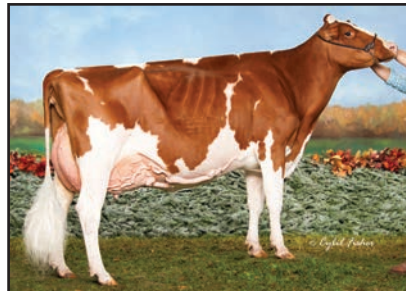
Pheasant-Echos Turvy-Red-ET "EX-95 2E" Grand Champion Int'l R&W Show 2016 (Dam of Lot 14)