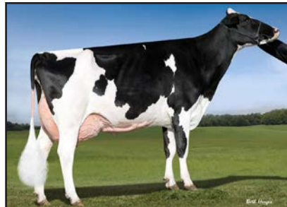
MDF Goldwyn Breezier 39-ET "EX-94 3E" (Lot 28)

Maternal sister to Breezier 39: Rainyridge Talent Barbara *RC EX-95 14* 3-04 2x 365d 34,465 3.6 1257 3.3 1133 •All-American 5 Year Old 2010 •All-Canadian 5 Year Old 2010 •Holstein Canada Cow of the Year 2013