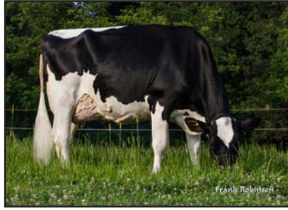
Golden-Rose Abs Gloriana-ET *RC "EX-90" 19th Generation Excellent (Dam of Lot 33A)

B) MILLION-HEIR A WORTHALOT-ET 145548351 Born March 2, 2023 (Altitude x Worth Repeating)