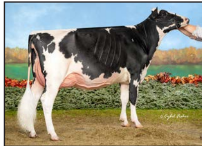
MD-Maple-Lawn Tatoo Juno-ET "EX-92" Nom. All-American Milking Yearling 2021 (Maternal Sister to Lot 32)

MD-Maple-Lawn Tatoo Juno-ET EX-92 •1st Fall Yearling Mideast Spring National 2021 •Nom. All-American Milking Yearling 2021