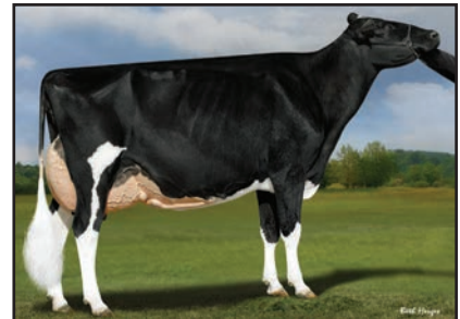
Oakfield GC Darby-ET "EX-95" Unanimous All-American 5 Year Old 2019 (Maternal Sister to Dam of Lot 50)