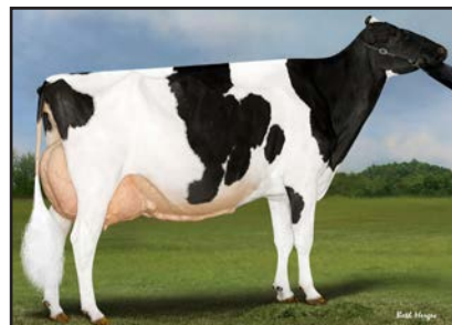
Floydholm Mc Emoji-ET "EX-95" All-American & All-Canadian Jr. 3 Yr Old 2019 (Maternal Sister to Lot 18)

142372537 Excellent-94 EEEEE 2E 6-00 3-04 2x 356d 28,067 3.7 1026 3.2 888* 5-05 2x 365d 23,390 3.9 910 3.0 694 2-03 2x 305d 20,150 3.7 736 3.0 598 •1st Sr. 3 Year Old, Futurity Winner, Int. Champ. and Res. Grand Champion, District 6 Show 2016 •Nom. Jr. All-American Sr. 3 Year Old 2016 •Nom. Jr. All-American Sr. 2 Year Old 2015 S: Erbaces Damion