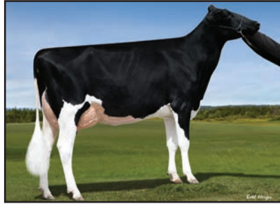
Bella-View GC Angel Eyes-ET "EX-90 EX-MS" (Granddam of Lot 25)