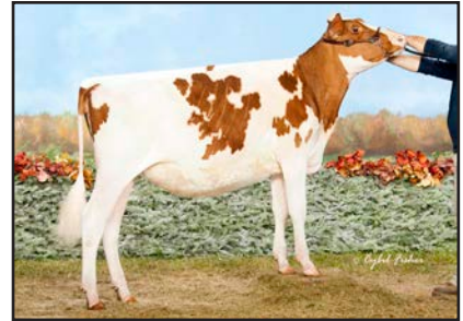
Glad-Ray-K BW Aleen-Red Res. Jr. All-American Fall Calf 2017 (Maternal Sister to Allstar-Red)