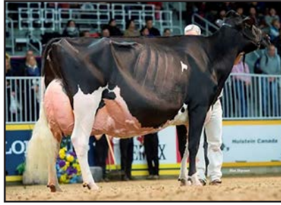
Lovhill Goldwyn Katrysha "EX-96 3E" Supreme Champion World Dairy Expo 2015 (Granddam of Lot 35)