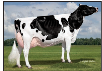
Dubeau Dundee Hezbollah "EX-92 11**" All-American & All-Canadian Sr. 2 Yr Old 2009 (Granddam of Lot 22A; Third Dam of Lot 22B)