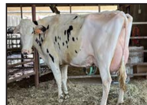
Jobo 10067 "VG-86" (Lot 53C)