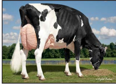
Klinedell Defant Cynthia-ET *RC "EX-93 2E" (Dam of Lot 27)

Mr Blondin Warrior-Red-ET 3139655530 *TP *TC *TY *TV *TL *TD PTA -843M -24F -18P 99R 4/23 PTA +2.90T +1.48UDC +1.28FLC GTPI +1748