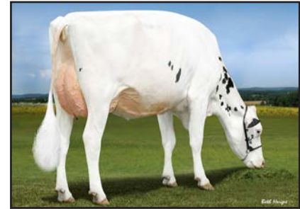
Ladys-Manor Grnt Oohm-ET "VG-85" DOM (Fourth Dam of Lot 7)