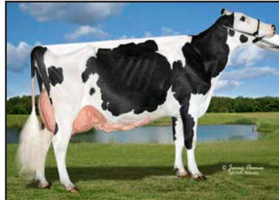
Lin-Ro Redburst Jen-ET *RC "EX-94 3E" All-Maryland Aged Cow 2019 (Dam of Lot 4)

• (5) #1 IVF embryos from sexed semen Domestic only • Location: Trans Ova, MD