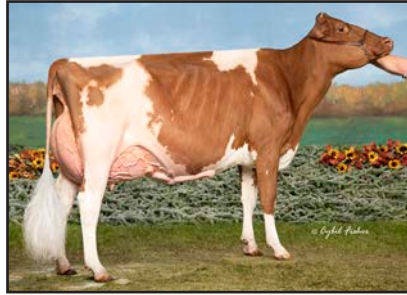
Ms Ransom-Rail Beth-Red-ET "EX-94" Grand Champion International R&W Show 2022 (Granddam of Lot 41)