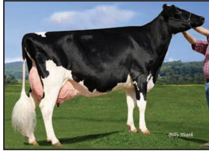
Ms Andis Shottle Aneeda-ET "EX-95 2E" 1st 5 Year Old Northeast Fall National 2013 (Third Dam of Lot 56)