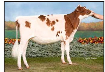
Hilrose Redlite Aria-Red-ET (Maternal Sister to Lot 12)