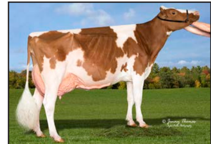
Pheasant-Echos Tamara-Red "EX-93 2E" HM Grand Champion NE R&W Fall National 2017 (Maternal sister to Lot 14)