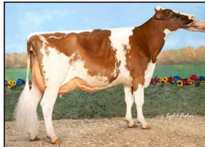
Glad-Ray-K Mor Shots-Red-ET "EX-94 2E" HM Jr. All-American R&W Milking Yearling 2016 (Dam of Lot 40)

Ms Glad Ray More Fun-Red EX-93 EEEEE 5-09 3x 308d 37,570 4.2 1569 3.0 1143 •1st Jr. 2 Yr Old, Int. & Gr. Ch. PAAA R&W 2012 •Unanimous All-American R&W Spring Yrlg 2011 •1st Spring Yrlg & Jr. Ch. NY Spr. R&W Sh. 2011 •1st & Jr. Champion RAWF R&W Show 2011 •1st Spring Yrlg. International R&W Show 2011 •Nom. All-American R&W Spring Calf 2010 Glad-Ray Mamajuana-Red VG-87 •Res. All-American Summer Yearling 2012