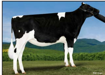
Ernest-Anthony Have Love-ET (Dam of Lot 6)