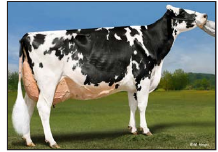
Peace&Plenty Link Rocky "EX-95 2E" Grand Champion MD Spring Show 2021 & 2023 (Dam of Lot 3)

3140065377 Excellent-95 EEEEE 2E *TR *TC 4-01 2x 305d 31,390 3.5 1109 3.0 941 3-02 2x 293d 29,690 3.4 1001 3.0 890 2-02 2x 304d 24,040 3.8 922 3.0 730 •1st Aged Cow, Senior & Grand Champion, Maryland Spring Show 2023 •1st 5 Year Old, Senior & Grand Champion, Maryland Spring Show 2021 S: EDG Mogul Link Up 8217-ET