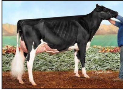
Garay Awesome Beauty-ET *RC "VG-88"

•Junior Champion Quebec Spring R&W Sh. 2022