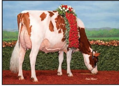
L-Maples Hvezda Calli-Red "EX-94 2E" 5x All-American R&W (Maternal Sister to Lot 39)

L-Maples Hvezda Calli-Red EX-94 2E 6-01 2x 365d 40,160 3.6 1447 3.1 1263 •All-American R&W Aged Cow 2018 •Unanimous All-American R&W 5 Year Old 2017 •Grand Champion RAWF R&W Show 2015 •Nom. All-American Jr. 3 Year Old 2015 •Unanimous All-American R&W Jr. 3 Yr Old 2015 •Unanimous All-American R&W Jr 2 Yr Old 2014 •Nom. All-American R&W Spring Yrlg. 2013 •All-American R&W Spring Heifer Calf 2012