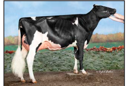
Skip Avalanche Jewel-ET *RC "EX-93 2E" (Maternal Sister to Lot 4)