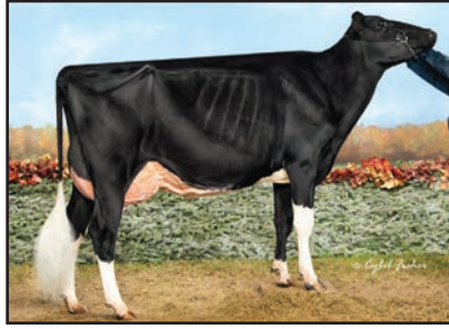
Allyndale Shocking Lilac "EX-94" Grand Champion NE Summer Show 2019 (Maternal Sister to Lot 60)