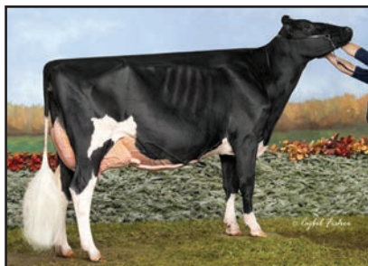
Budjon-JK Damion Eklipse-ET "EX-94 2E" 2x Junior All-American nominee (Dam of Lot 18)

Floydholm Mc Emoji-ET EX-95 EEEEE •All-American & All-Canadian Jr. 3 Yr Old 2019 •1st Jr. 3 Yr Old & Int. Champ. Int'l Show 2019 Floydholm Kdoc Egypt-ET •HM. Jr. All-American Winter Yrlg. 2022 Floydholm Gold Chip Evie-ET VG-85 •1st Summer Yrlg International Jr. Hol. Sh.2019 Floydholm Kdoc Ellarose-ET •Res. Jr. All-American Winter Calf 2021