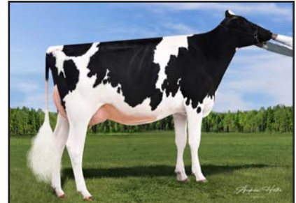
Oakfield Moment Marisa-ET "VG-88" Nom. All-American Milking Yearling 2022 (Full Sister to Dam of Lot 48)

•Nom. All-American Milking Yearling 2022 •6th Milking Yearling International Show 2022