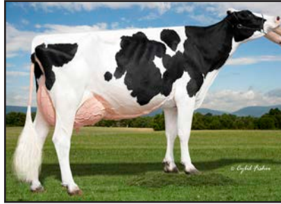
Ms DG Delta Bridgett *RC "EX-93 2E" (Dam of Lot 29)