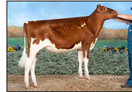
Glad-Ray-K Armani Rave-Red "VG-87" HM Jr. All-American R&W Winter Calf 2015 (Granddam of Lot 51E)