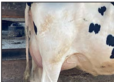
Udder of Locust-Ayr C Royal Alice