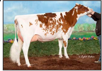
Glad-Ray-K Allstar-Red "VG-88" Nom. All-American R&W Winter Yearling 2014 (Granddam of Lot 51A, Third Dam of Lot 51B)