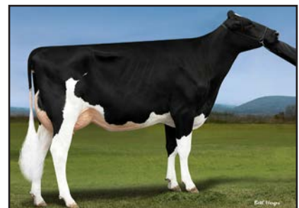
TTM Charley Mystic-ET "EX-90 EX-MS" (Third Dam of Lot 8)