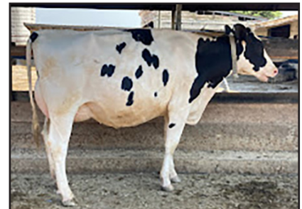
Locust-Ayr C Royal Alice (Lot 36)

4-06 2x 365d 39,190 3.7 1433 2.8 1089 Life: 2445d 225,380 3.5 7941 2.8 6361