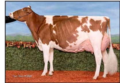
Milksource Tantrum-Red-ET "EX-92" Res. Int. Champion Int'l R&W Show 2022 (Full Sister to Lot 13)