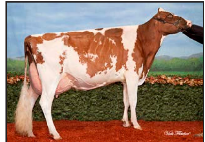
Ms Glad Ray More Fun-Red "EX-93" All-American R&W Spring Yearling 2011 (Maternal Sister to Dam of Lot 40)