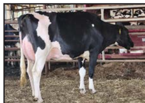
Jobo L Jill 9816 "VG-87" (Lot 53B)