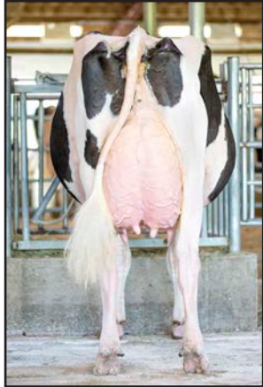
Siemers Pure Ki-Anna "EX-95 2E" (Third Dam of Lot 9)