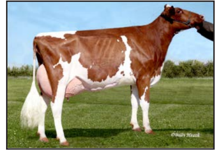
SRP Absolute Fantasy-Red-ET "EX-94 4E" (Granddam of Lot 43)