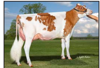
Hilrose Altitude Audi-Red-ET "VG-88" (Full Sister to Lot 12)