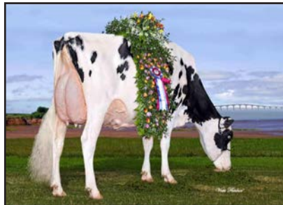
Idee Windbrook Lynzi-ET "EX-95 4E 3**" Canadian Cow of the Year 2020 (Maternal Sister to Lot 30)