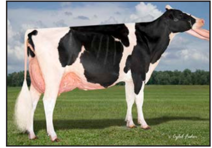
Siemers Pure Ki-Anna "EX-95 2E" Junior All-American 4 Year Old 2019 (Third Dam of Lot 9)

3248152713 *TR *TP *TC *TL *TD GTPI +2654 PTA +1136M +.11% +75F +.02% +41P 79R 4/23 PTA +401NM -.1PL 2.99SCS -3.8DPR 2.7%DCE PTA +3.70T +2.68UDC +1.28FLC 78R 4/23 A1/A2 • BE S: Siemers Exc Hanans 31753-ET