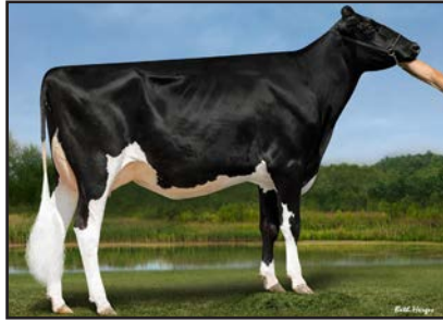
Milksource Diamond Shade-ET *RC "VG-85" (Dam of Lot 37)