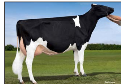
Lylehaven Atwood Lylly-ET "EX-95 3E" (Dam of Lot 20)