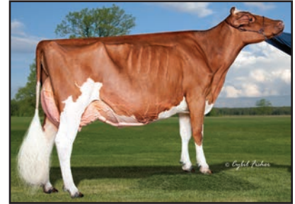
Strans-Jen-D Tequila-Red-ET "EX-96 2E" 2x Grand Champion International R&W Show (Dam of Lot 13)