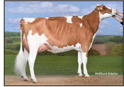
Garay Awesome Barbara-Red "EX-92"