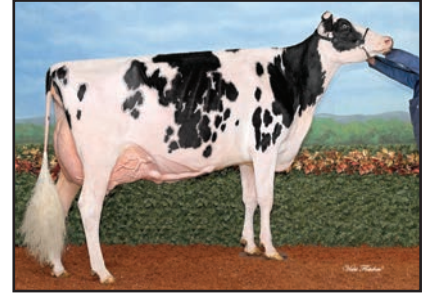
Idee Windbrook Lynzi-ET "EX-95 4E 3" Supreme Champion Royal Winter Fair 2019 (Maternal Sister to Lot 31)

Idee Windbrook Lynzi-ET EX-95-4E-CAN 3* 5-07 2x 365d 35,064 4.5 1576 3.2 1138 •Canadian Cow of the Year 2020 •Res. Grand Champion Canadian National 2021 •1st Mature Cow & Res. Grand Ont. Summer 2020 •Supreme Champion Royal Winter Fair 2019 •All-Canadian 5 Year Old 2019 •All-Canadian Jr. 3 Year Old 2017 Idee Doorman Luella-ET EX-90-5Y-CAN 5-02 2x 365d 32,002 5.1 1636 3.8 1221