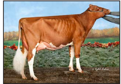
Ms DB Infinity-Red "EX-90 EX-MS" All-American R&W Milking Yearling 2020 (Maternal Sister to Lot 52B)