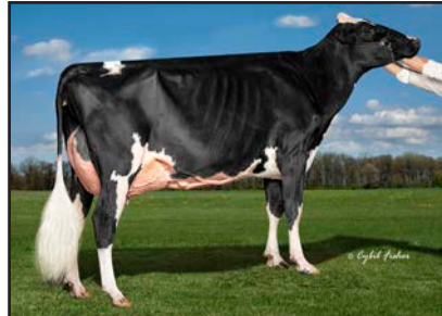
Sidbeauty Solomon Bianka-ET "EX-91 EX-MS" (Dam of Lot 55)