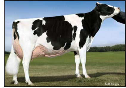
Harvue Dundee Foxy-ET "EX-92 2E" GMD (Granddam of Lot 19)