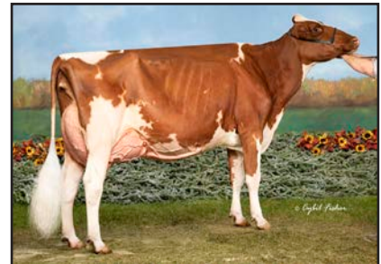
Garay Red Diamond-Red-ET "EX-92"

•1st Spring Calf MD State Fair R&W Show 2021