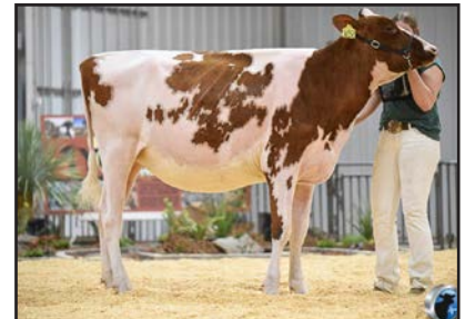
Siemers A Hot 36152-Red-ET Junior Champion Southern National 2023 (Full Sister to Lot 38)

3014096953 Excellent-92 EEVEE 3-06 3-02 2x 348d 27,982 4.3 1203 3.4 948" 4-05 2x 281d 28,640 4.2 1192 3.1 899" •Unanimous All-American R&W Jr. 3 Yr Old 2017 •Res. All-Canadian R&W Junior Cow 2017 •Unanimous All-American R&W Jr. 2 Yr Old 2016 •All-Canadian R&W Jr. 2 Year Old 2016 •Int. & Res. Grand Champion Int'l R&W '16 & '17 •1st Jr. 3, Res. Int. & HM Gr. Ch. Royal R&W 2017 •1st Jr. 2, Int. & Res. Gr. Ch. Royal R&W 2016 •4x class winner at International R&W show! S: Rainyridge Barnie-ET *RC