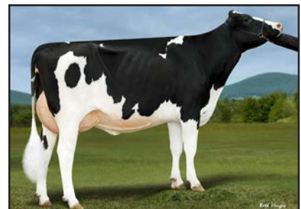
TTM Crimson Mahjong-ET "VG-88" (Granddam of Lot 8)

TTM Crimson Mahjong-ET VG-88 VG-MS GTPI +2903 +1167M +95F +60P 84R 4/23 PTA +901NM +4.7PL 2.60SCS +.1DPR 1.9%DCE PTA +.94T +.81UDC -.20FLC 83R 4/23 2-00 2x 305d 26,080 4.9 1289 3.5 923 TTM Charley Mystic-ET EX-90 EX-MS 3-01 2x 365d 42,710 3.2 1375 3.1 1337 Life: 1156d 119,220 3.4 4038 3.2 3842 TTM Kingboy Mulberry-ET GP-83 2-00 2x 305d 23,060 4.0 926 3.5 816 Ammon-Peachey Prd Mercus-ET GP-84 1-10 2x 334d 23,050 4.8 1109 3.9 889 Pine-Tree Martha Sheen-ET VG-86 DOM 9* 1-11 3x 365d 31,210 4.2 1305 3.1 968 Pine-Tree Missy Martha-ET VG-86 DOM 2-02 2x 365d 34,730 3.6 1266 3.1 1070 Wesswood-HC Rudy Missy-ET 3E-92 GMD DOM Wesswood Elton Mimi EX-90 GMD DOM Next 3 dams all VG-87