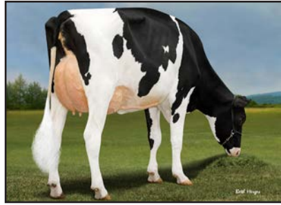
Oakfield Moment Medley-ET "VG-87 VG-MS" 1st Milking Yrlg. SE PA Championship Show 2022 (Dam of Lot 49)

Oakfield Crushable Majestic-ET EX-91 EX-MS 2-00 3x 284d 24,770 3.9 954 3.1 776 OCD Doc Mischievous-ET VG-88-2Y-CAN 2-02 2x 285d 20,304 4.3 873 3.3 679 •2nd Jr. 2 Yr Old W. Ontario Fall Showcase 2021 •2nd Jr. 3 Yr Old Ontario Summer Show 2022