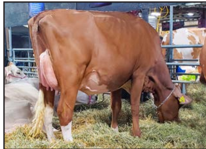
Apple-Pts Dr Alisha-Red-ET "VG-88" 1st Jr. 2 Year Old PA All-American R&W 2022 (Dam of Lot 26)

• (5) #1 IVF embryos from sexed semen Domestic only • Location: Triple Hill Sires