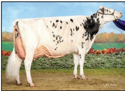
Erbacres Snapple Shakira-ET "EX-97 2E" Supreme Champion WDE 2021 (Maternal Sister to Dam of Lot 37)

Export qualified to Can/UK Location: Trans Ova, MD Export Tank