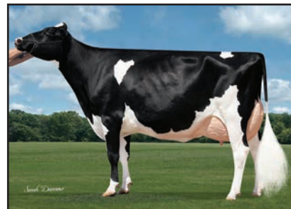
Comestar Larion Goldwyn-ET "EX-95 2E 2*" 2x All-American & All-Canadian (Dam of Lot 17)

Lylehaven Roy Lari VG-88-3Y-CAN 4-06 2x 365d 45,748 4.0 1847 3.0 1376 Lylehaven Damion Lynx-ET EX-94 4-04 3x 365d 37,750 5.1 1921 3.2 1208 •5th Jr. 2 Year Old Northeast Fall National 2008 Thiersant Lili Starbuck-ET EX-94 5E 5* 5-00 2x 358d 30,190 4.6 1387 3.2 978 Life: 3428d 238,806 4.7 11291 3.4 8124 Ivyhall Astro Jet Ronie VG-86-6Y-CAN 1*