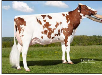
Garden-State Fantasa-Red-ET "EX-94" (Dam of Lot 43)