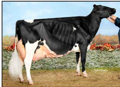
Lovhill Goldwyn Katrysha "EX-96 3E" Supreme Champion World Dairy Expo 2015 (Granddam of Lot 46)

•Sold for $8,100 in 1st Impressions III Sale 2023