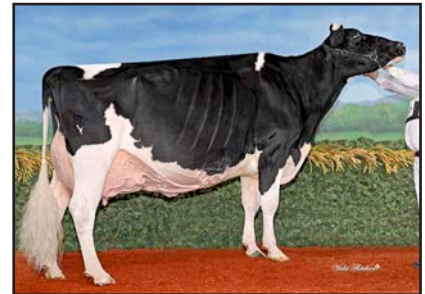
Loyalyn Goldwyn June "EX-97 6E 5" Holstein Canada Cow of the Year 2019 (Granddam of Lot 32)