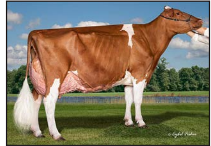
Pamprd-Acres AB Ivy-Red-ET "EX-94 2E" •Unanimous All-American R&W Sr. 2 ~ 2016 (Maternal Sister to Lot 52A)