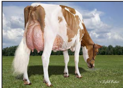
Heatherstone Redhot-Red "EX-92" 4x Class Winner at International R&W Show (Dam of Lot 38)