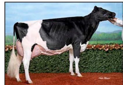
St-Jacob Goldwyn Hazel-ET "EX-94 4E 2**" Grand Champion Autumn Opportunity 2015 (Full Sister to Dam of Lot 22)