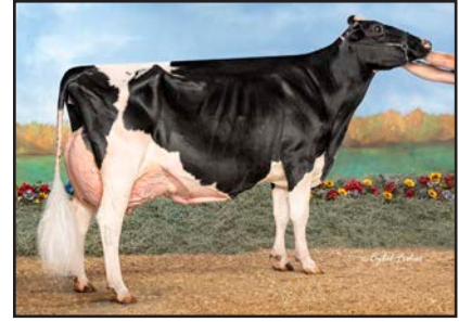
Smith-Hollow Lance Lucy "EX-94 2E" Res. Grand Champion MD State Fair 2022 (Dam of Lot 47)