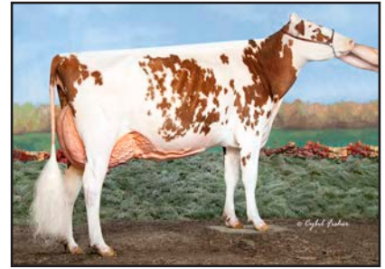
L-Maples Dfnt Cassey-Red "EX-92" Res. All-American R&W Jr. 3 Year Old 2020 (Maternal Sister to Lot 39)