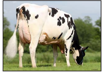
OCD Delta Missy 4212-ET "EX-94 2E" (Granddam of Lot 49)