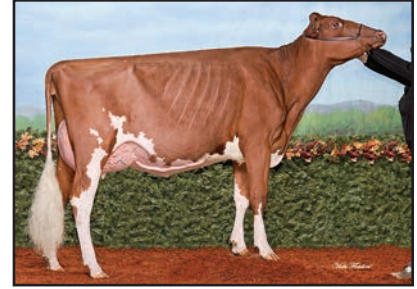
MS-AOL DB Raspberry-Red-ET "EX-90" 2x All-American R&W (Maternal Sister to Lot 15)