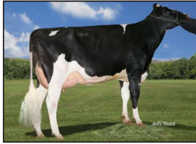
Coldsprings Rapid 11678-ET "GP-83" (Dam of Lot 11)