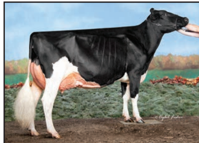
Oakfield Goldwyn Daisy-ET "EX-94 2E" Member All-American Produce of Dam 2020 (Dam of Lot 50)

Oakfield GC Darby-ET EX-95-5Y-CAN (MS:95) 5-01 2x 365d 40,082 3.7 1499 3.1 1230 •Res. All-American Aged Cow 2020 •Res. Grand Champion NA Open Hol. Show 2020 •Member All-American Produce of Dam 2020 •Unanimous All-American 5 Year Old 2019 •Res. Grand Champion International Show 2019 Oakfield Archrival Dina-ET EX-92 EX-MS