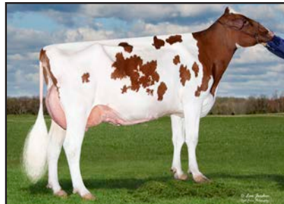
Rocklan Jordy Glitter-Red "EX-91 EX-MS" (Dam of Lot 42)