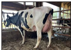
Jobo 9708 "VG-88" (Lot 53A)

2-11 3x 365d 33,290 3.8 1262 3.1 1034 Life: 1378d 126,560 3.8 4784 2.9 3733