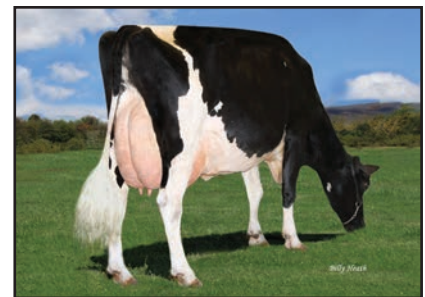
Elk-Lick Pronto Lynita "EX-94 4E" (Granddam of Lot 45A-B-C)

8-05 2x 365d 37,600 4.2 1578 3.3 1255 Life: 3384d 246,640 4.6 11294 3.5 8595