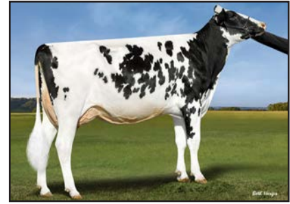
Ladys-Manor Huey Oohm-ET "EX-90 EX-MS" (Third Dam of Lot 7)

Ladys-Manor Hue Opera-ET A2/A2 • AB GTPI +3136 +956M +108F +56P 82R 4/23 PTA +999NM +5.0PL 3.01SCS +1.0DPR 2.0%DCE PTA +2.13T +2.41UDC +2.02FLC 80R 4/23 •recently fresh Ladys-Manor Huey Oohm-ET EX-90 EX-MS 2-02 2x 365d 28,070 4.6 1279 3.3 928 Ladys-Manor Grnt Oohm-ET VG-85 DOM 2-02 2x 365d 29,050 5.1 1481 3.5 1004 •Former #1 GTPI Cow of the Breed! Ladys-Manor Miltm Oompa-ET Ladys-Manor Dorcy Oda EX-93 2E 6-02 2x 365d 36,710 4.6 1687 3.2 1162 Ladys-Manor Auden Oda-ET EX-91 EX-MS Ladys-Manor Out Topaz EX-91 2E DOM Ladys-Manor Topal EX-90 EX-MS DOM Ladys-Manor Star Opal EX-94 3E DOM Ladys-Manor Star Onyx-ET EX-93 2E GMD DOM Next 5 dams all EX or VG