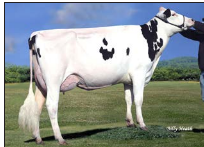
Coldsprings Basic 12042 "VG-86 VG-MS" (Dam of Lot 10)