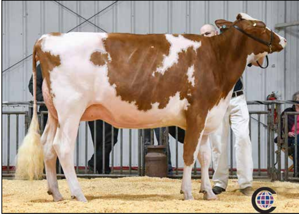
ROKEYROAD MOOVIN ARTIST-RED SELLS AS LOT 65H

Reserve Intermediate Champion, Southern Spring National 2023