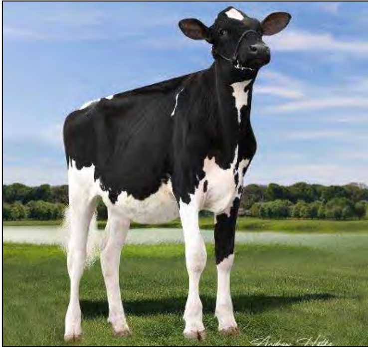
PREMIERPOINT MAST CALLIE-ET DAM OF LOT 38