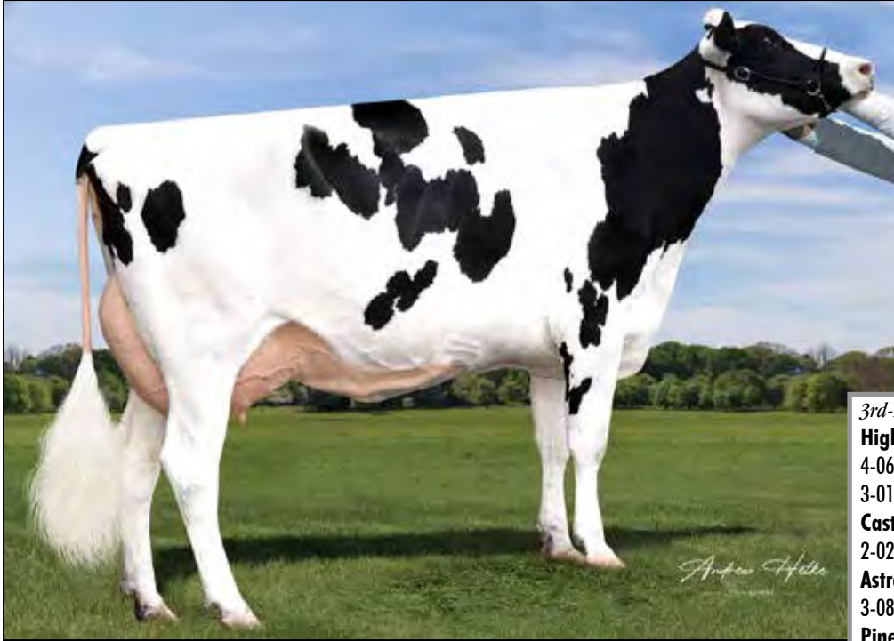
HIGHTIDE MCCUTCHEN RAQUEL EX-93 EEEEE 2E 2ND DAM OF LOT 13