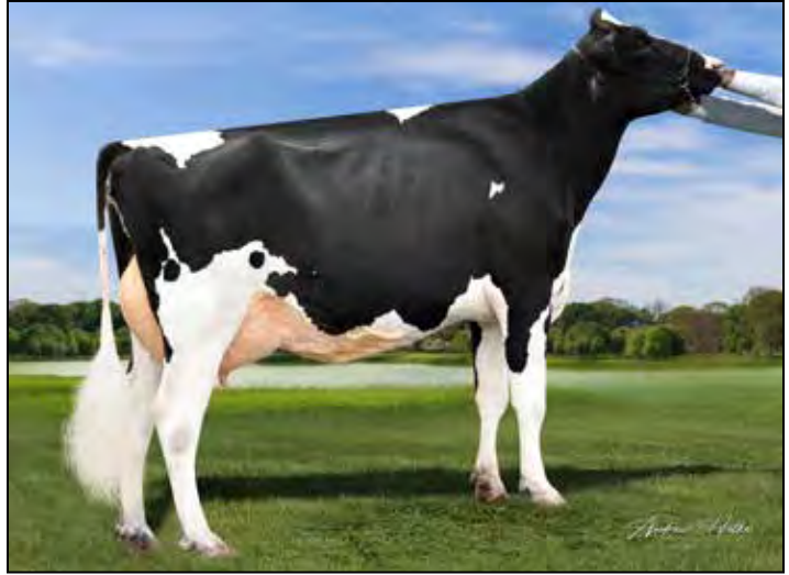
R-JOHN BEEMER CALI-ET EX-90 EX-MS DAM OF LOT 39