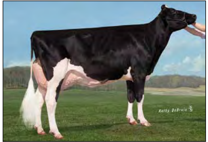
MS APPLES ARIA-ET EX-92 EX-MS 2E 3RD DAM OF LOT 11