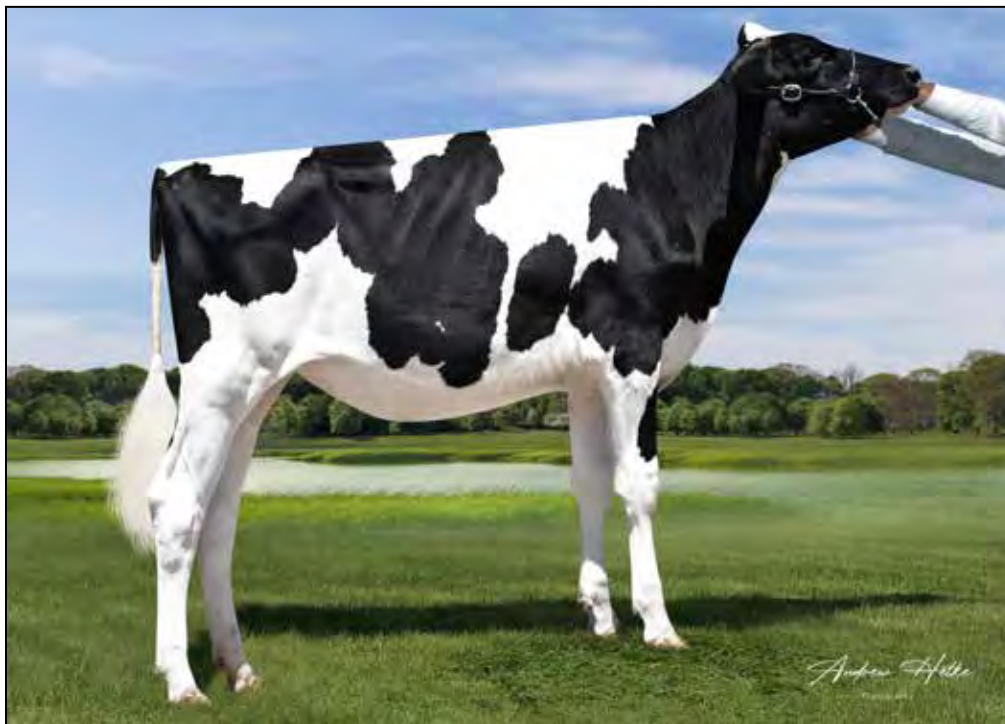
DINOMI RONALD KATAV-ET DAM OF LOT 1