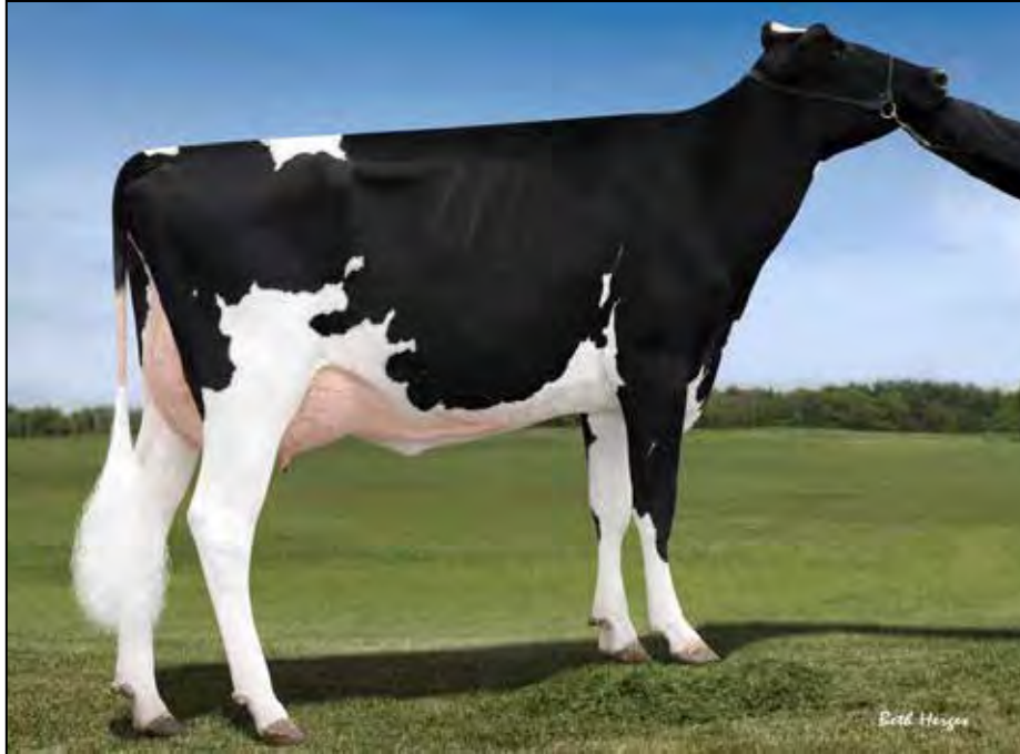
BLONDIN TJR SUPERSIRE AROMA-ET VG-85 VG-MS 4TH DAM OF LOT 43