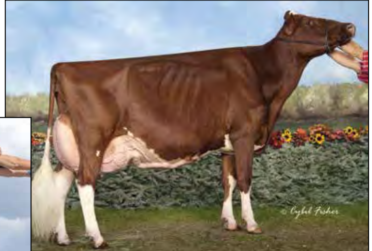
KHW REGIMENT APPLE-RED-ET EX-96 EEEEE 4E DOM 2ND DAM OF LOT 9