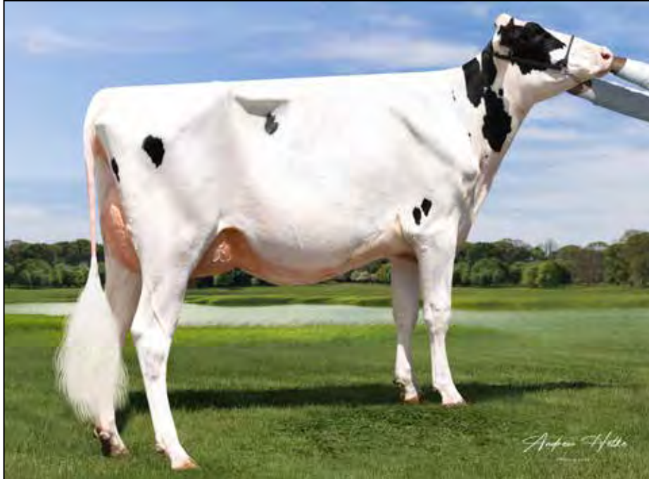
SKYKOMISH-R CRUBULL CECE-ET VG-86 VG-MS 2ND DAM OF LOT 27