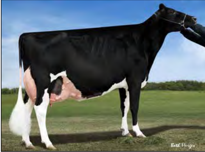
SILVERMAPLE DAMION CAMOMILE EX-95 EEEEE 3RD DAM OF LOT 39