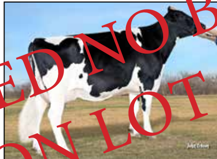
ROYLANE SHOT MINDY 2079-ET VG-86 4TH DAM OF LOT 6

840003205436236 99%RHA-I *TC *TY *TV *TL 75K GTPI +3050G +1403M +107F +63P 81R 4/22 PTA +1009NM +.18%F +.07%P PTA +5.5PL 2.63SCS +.1DPR 1.9%DCE PTA +1.18T +1.39UDC +.52FLC 80R 4/22