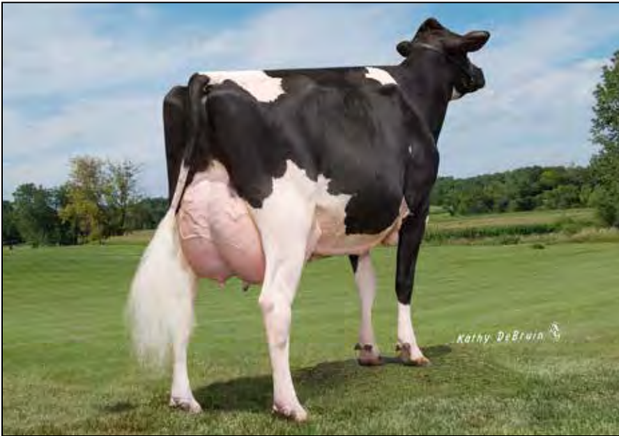
GOLDEN-OAKS ATWD CHARLA-ET EX-93 EEEEE GMD 5TH DAM OF LOT 54