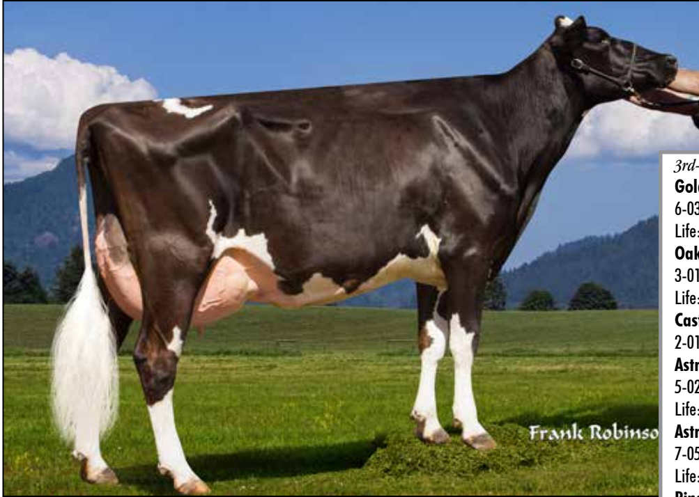
ROYLANE-KH TANGO RASS-ET EX-92 EEEEE 2E DAM OF LOT 55