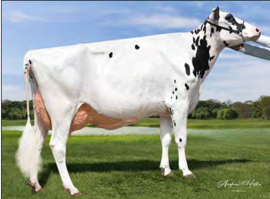
GDR-KINGS BAILEY 50878-ET EX-91 EX-MS *RC 2ND DAM OF LOT 22