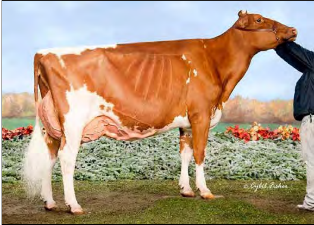
MS BARB ACT BEAUTY-RED-ET EX-94 EEEEE 2ND DAM OF LOT 44