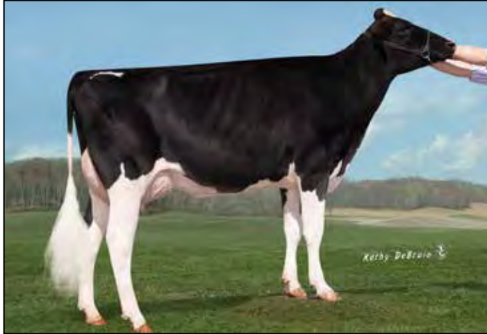
MS FANEAR UNO AMAZING-ET EX-92 EX-MS *RC 2ND DAM OF LOT 11