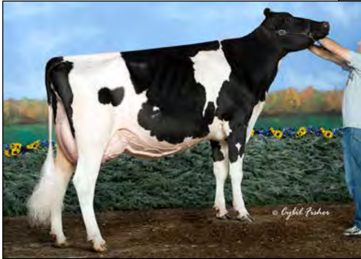
MARKWELL-LB GOLDWYN DONNA-ET EX-93 FULL SISTER TO DAM OF LOT 46