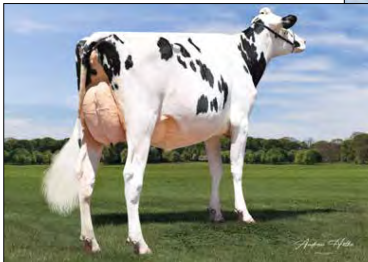
LEGACY-RANCH DLIGHT ADELEY VG-88 EX-MS 2ND DAM OF LOT 42