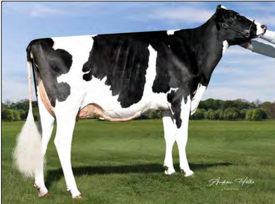
GDR-KINGS MERJACK 50655-ET GP-81 3RD DAM OF LOTS 34-37