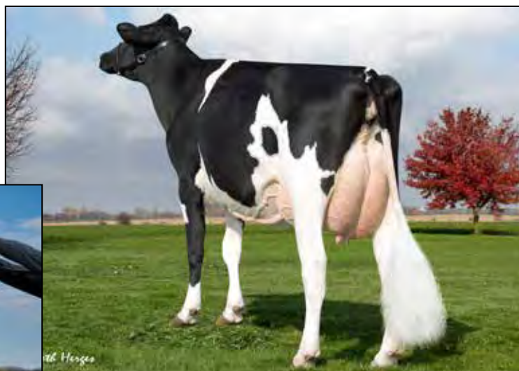
AMMON-PEACHEY SHAUNA-ET EX-92 EX-MS GMD DOM 6TH DAM OF LOTS 23 & 24