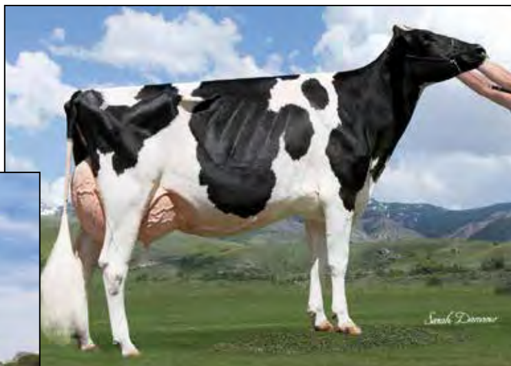
FERN-OAK MERIDIAN 24606-TW EX-93 EEEEE 3RD DAM OF LOT 42