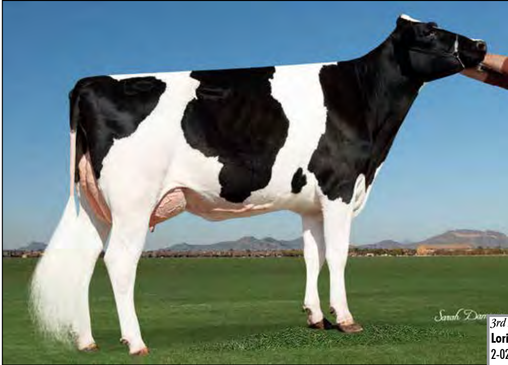
LORITA HONEYMOON VG-86 VG-MS 3RD DAM OF LOT 19