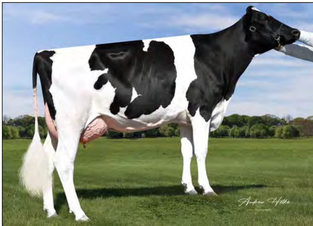
SANDY-VALLEY GT 529-ET VG-86 VG-MS 3RD DAM OF LOTS 3 & 4