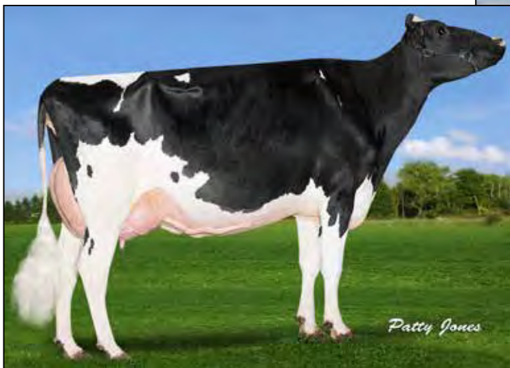
ELM BEND GEMCUTTER-ET EX-91-2E-CAN 4TH DAM OF LOT 14