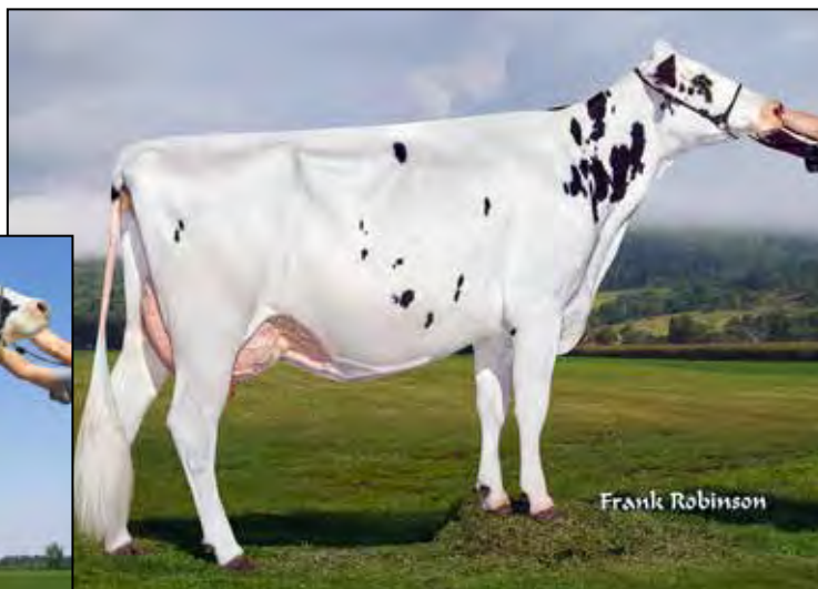
MONUMENT EPIC JULIA-ET EX-90 2ND DAM OF LOT 51