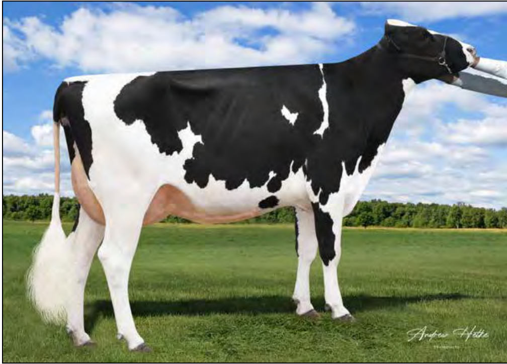
BGP NOBLE DHRMY 695-ET VG-87 VG-MS 2ND DAM OF LOT 32