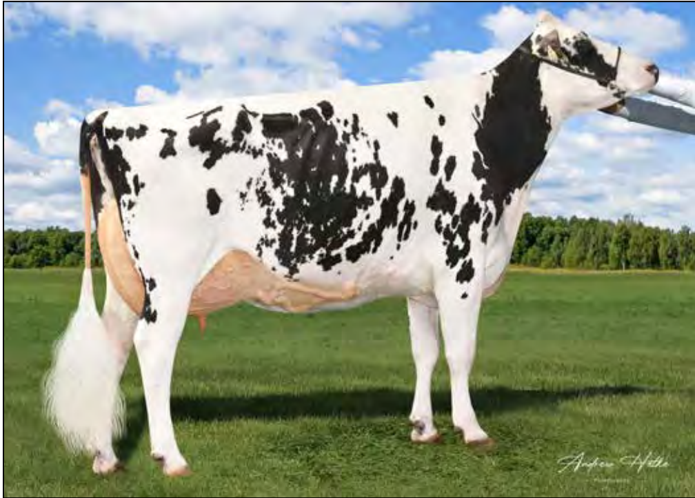
JUNIPER-HAVEN DFANT XOCHILT EX-93 EEEEE DAM OF LOT 26