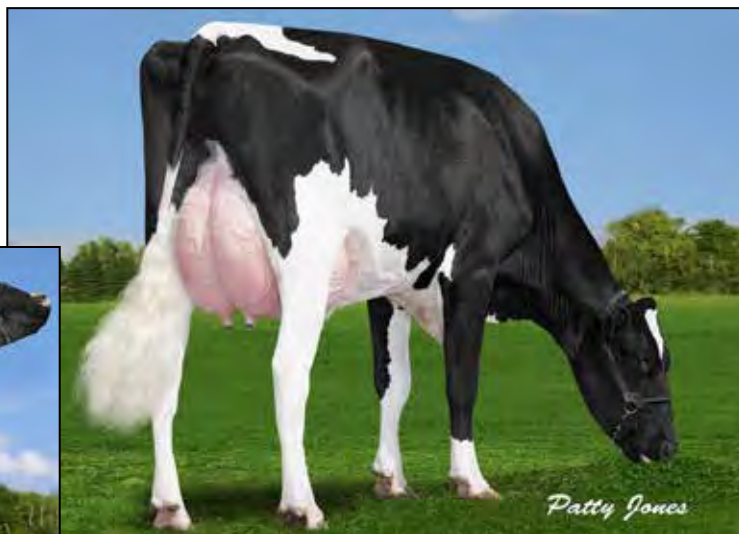
ELM BEND GEMANI EX-90-CAN 5* 5TH DAM OF LOT 11