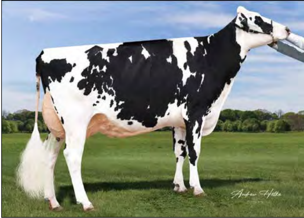
MS APPLE ANJEELE-ET EX-94 EEVEE 2E 2ND DAM OF LOT 10