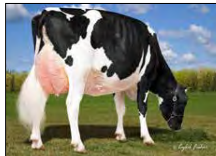
VIEW-HOME UNO HOPE-ET EX-92 EEEEE DOM MATERNAL SISTER TO 6TH DAM OF LOTS 16, 17, & 18

840003205436889 99%RHA-I *TC *TY *TV *TL 75K GTPI +2602G +2.93T +3.01UDC +1.24FLC