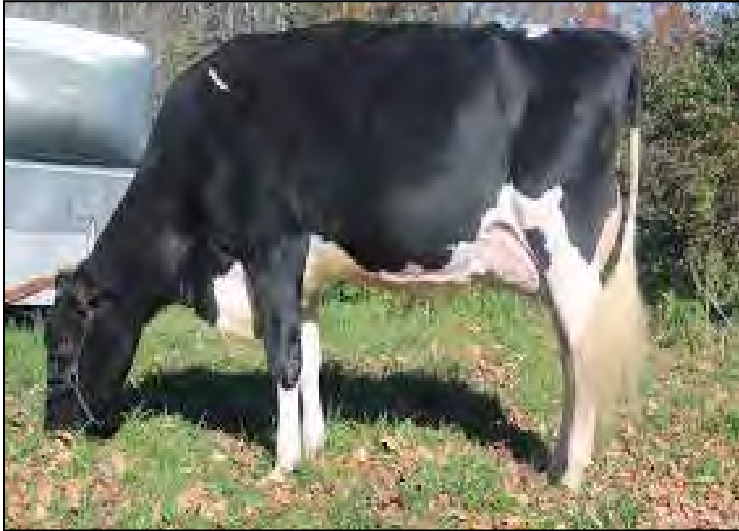
VER-MAINE ATWOOD MOLLY EX-94 2E 3RD DAM OF LOT 7