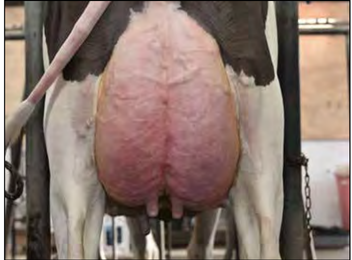
LEGACY-RANCH DOC 24030 VG-87 VG-MS @ 3-00 DAM OF LOT 25