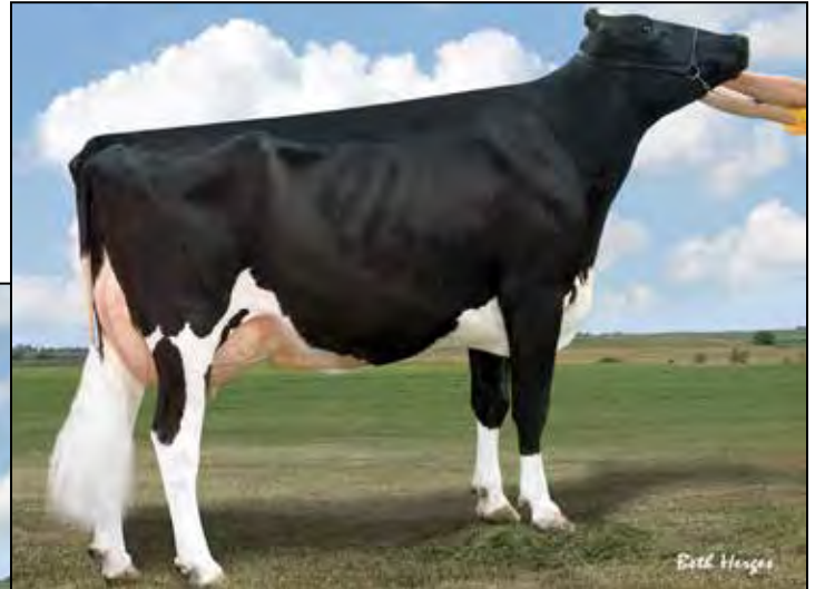
REGANCREST G BROCADE-ET EX-92 EEEEE DOM 6TH DAM OF LOT 28