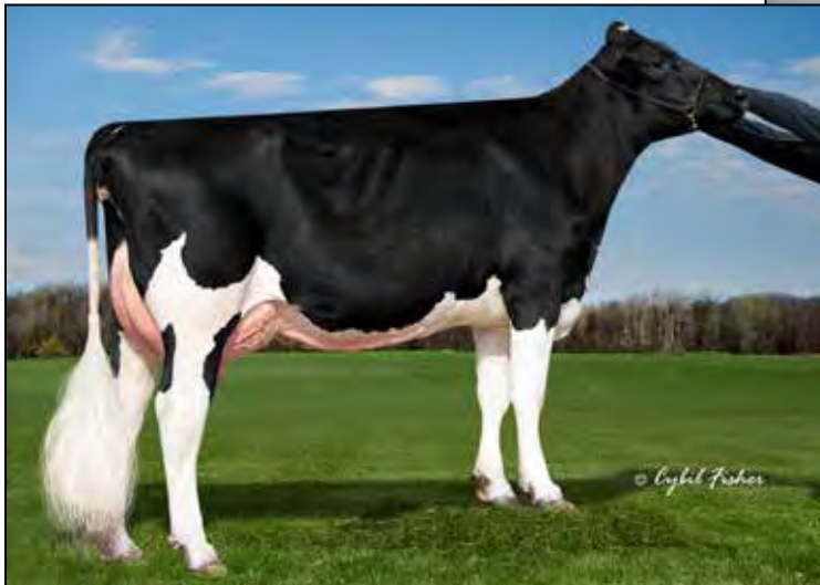
SEAGULL-BAY S JULLIAN-ET VG-87 VG-MS 5TH DAM OF LOTS 23 & 24