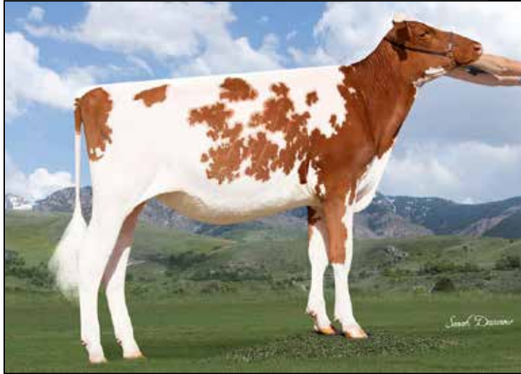
APPLE-PTS AUBRIA-RED-ET DAM OF LOT 9