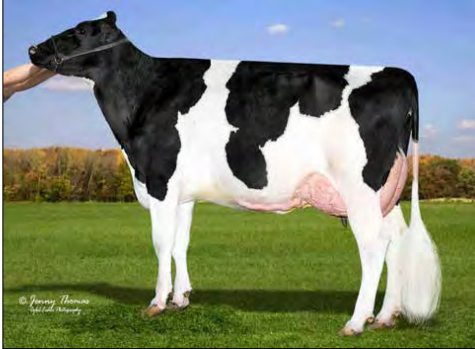
AGRESTI DOC DYMOND-ET EX-91 EX-MS 2ND DAM OF LOT 33