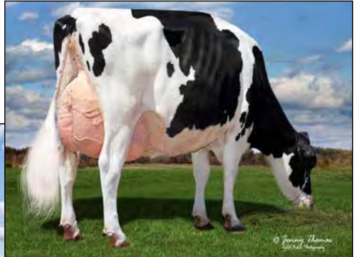
DINOMI DRMAN RYLEY-ET EX-90 EX-MS 3RD DAM OF LOT 45