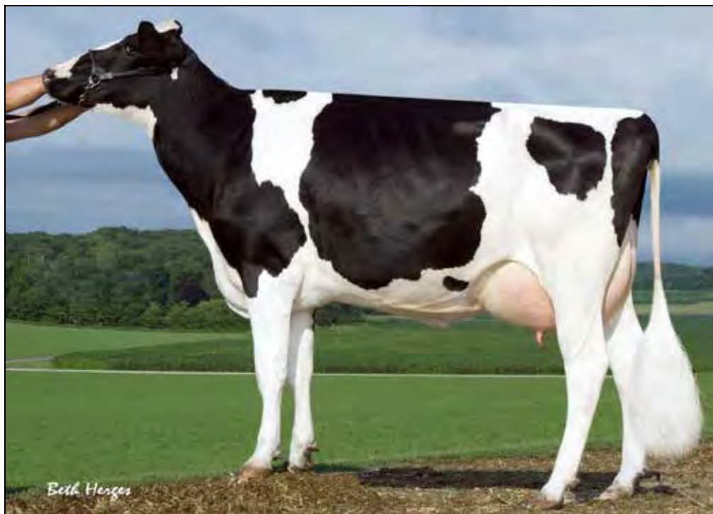
SANDY-VALLEY PLANE SAPPHIRE VG-87 VG-MS GMD 7TH DAM OF LOTS 3 & 4