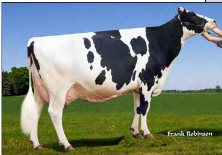
MONUMENT DEFENDER JINGER-ET EX-92 EX-MS 2E FULL SISTER TO DAM OF LOT 51