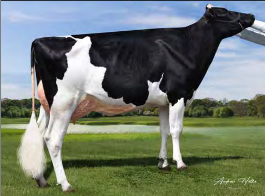
GDR-KINGS DOC 51866-ET DAM OF LOTS 40 & 41