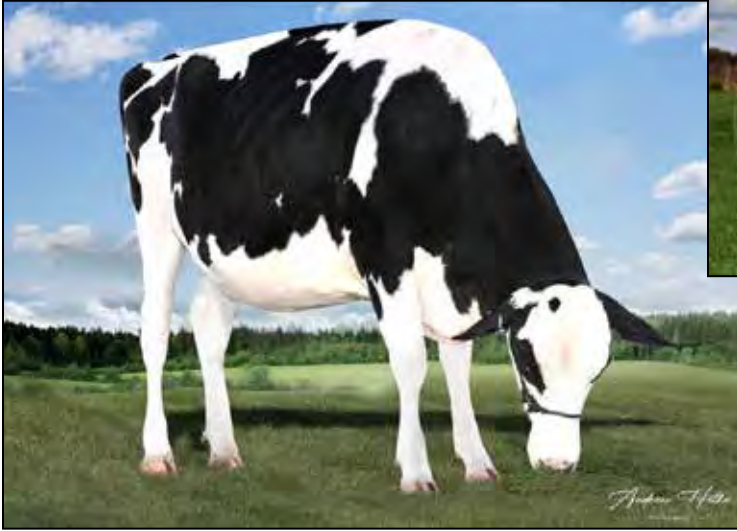
DINOMI UNDENIED KAY 11942 VG-87 EX-MS DAM OF LOT 45