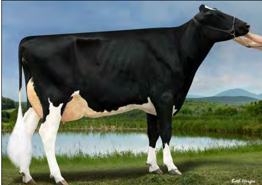
VT-POND-VIEW ARMANI LUCIA EX-91 EX-MS DAM OF LOT 2