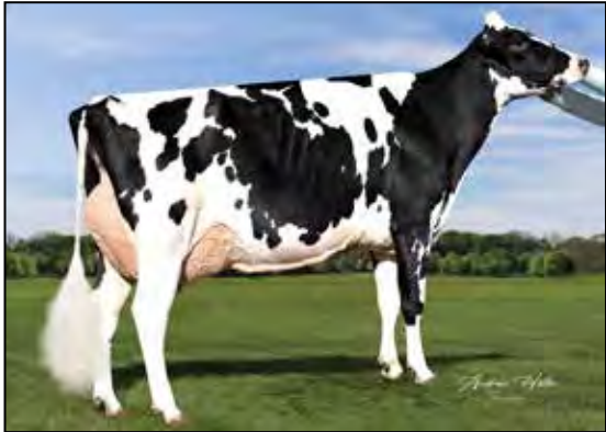
SILDAHL-HK RISE-N-SHINE EX-90 EX-MS DAM OF LOT 12