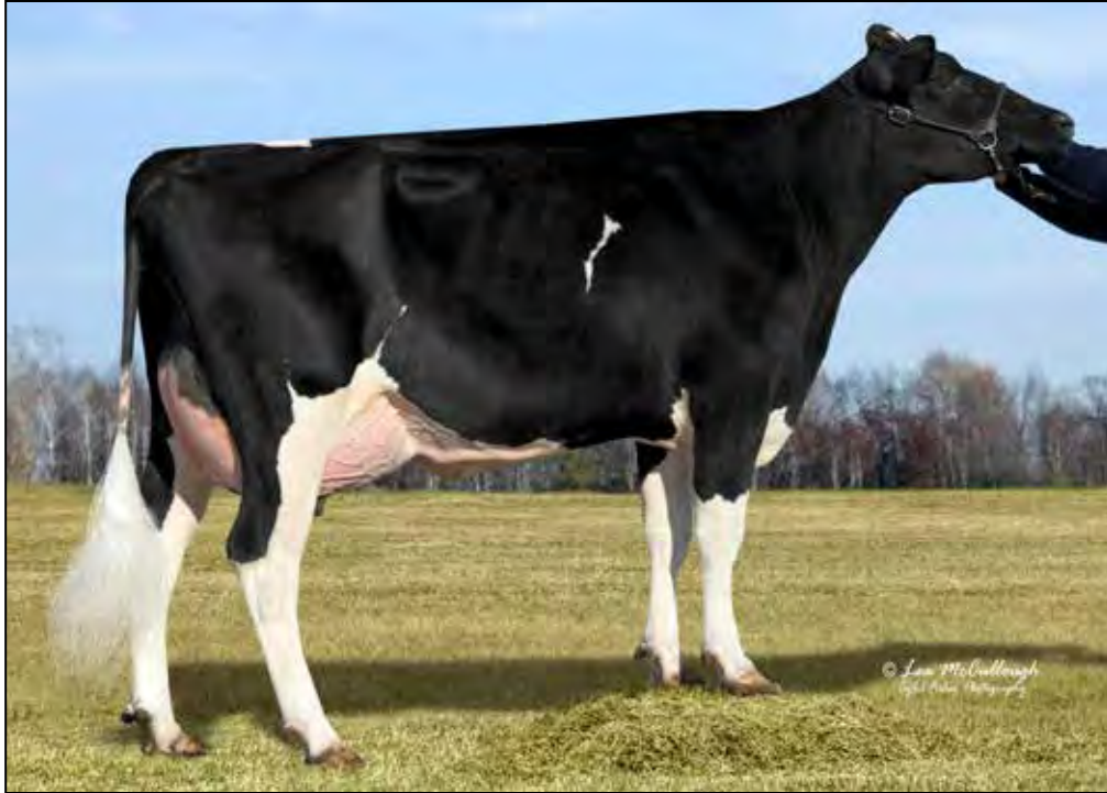
WELCOME MAC PEYTAN-ET VG-87 3RD DAM OF LOT 8