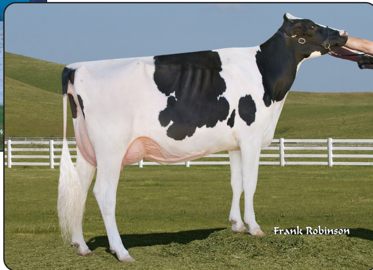
Co-Vale Dundee Kaylyn-ET “VG-89” 1st Junior 2 Year Old Midwest Fall National 2010 Fourth Dam of Lot 24