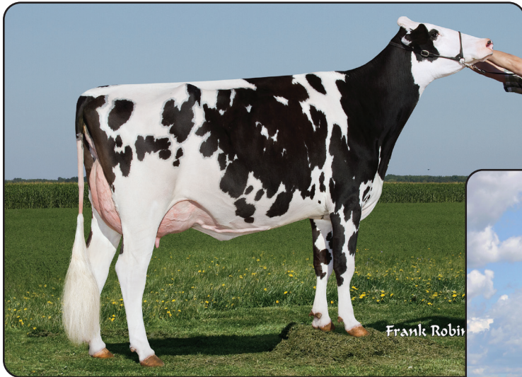
Regancrest Sanchez Blair-ET "VG-87 VG-MS" Granddam of Lot 31