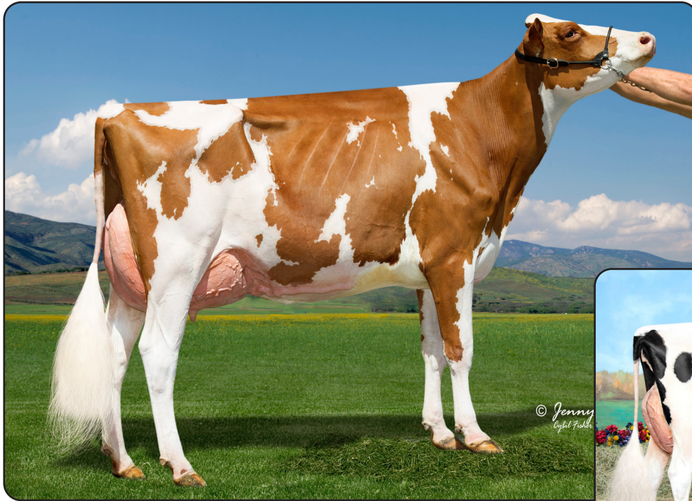
Mahoney Rosa-Lynn-Red-ET "2E-92" Nominated All-American R&W Jr. 3 Year Old 2018 Dam of Lot 6