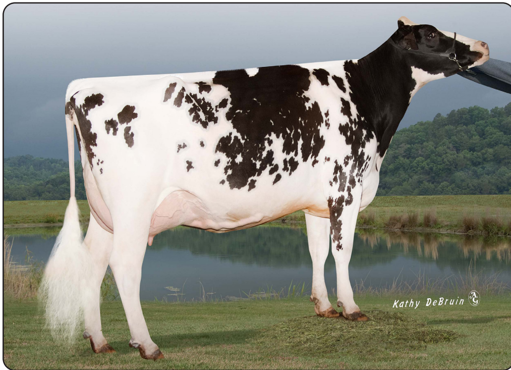
Bossir Director Fawn-Red-ET “VG-88” Granddam of Lot 28