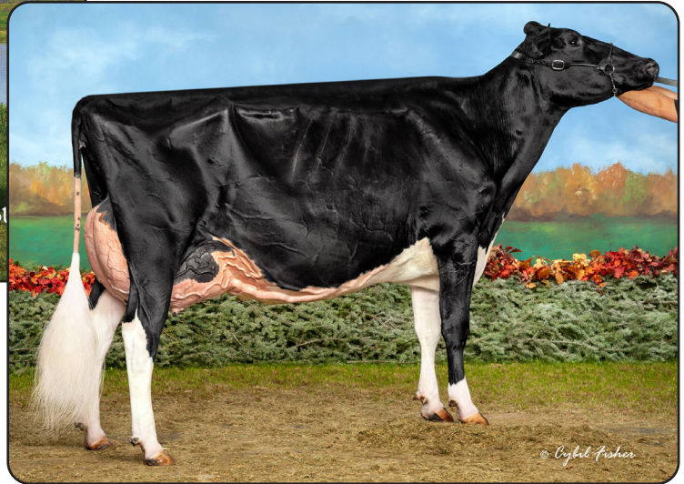
RuAnn Doorman Jean-55162-ET "2E-95" Grand Champion California State Show 2021 Full Sister to Dam of Lot 4