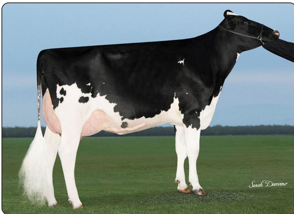
Cranehill Dback Chloe-ET *RC "EX-91 EX-MS" Dam of Lot 21