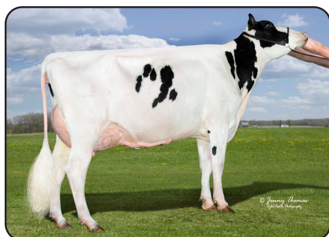
Hilmar Positive 15964-ET "GP-83 VG-MS" Dam of Lot B