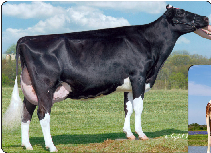
Budjon Redmarker Shar-ET *RC "EX-94" Third Dam of Lot 13