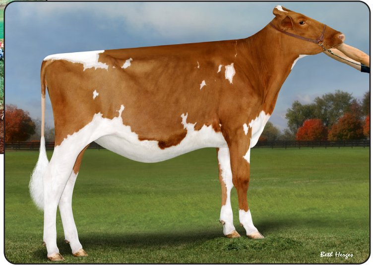
Oakfield Warr Levity-Red All-American R&W Summer Yearling 2021 Full Sister to Lot 1