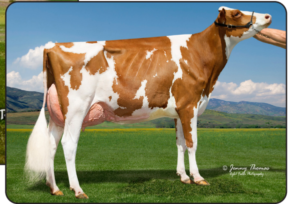
Mahoney Rosa-Lynn-Red-ET “2E-92” Nominated All-American R&W Jr. 3 Year Old 2018 Granddam of Lot 5