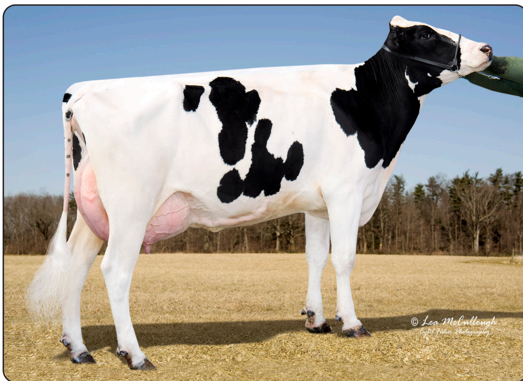
Unique-Style Bolton Money “2E-93” Fifth Dam of Lot C