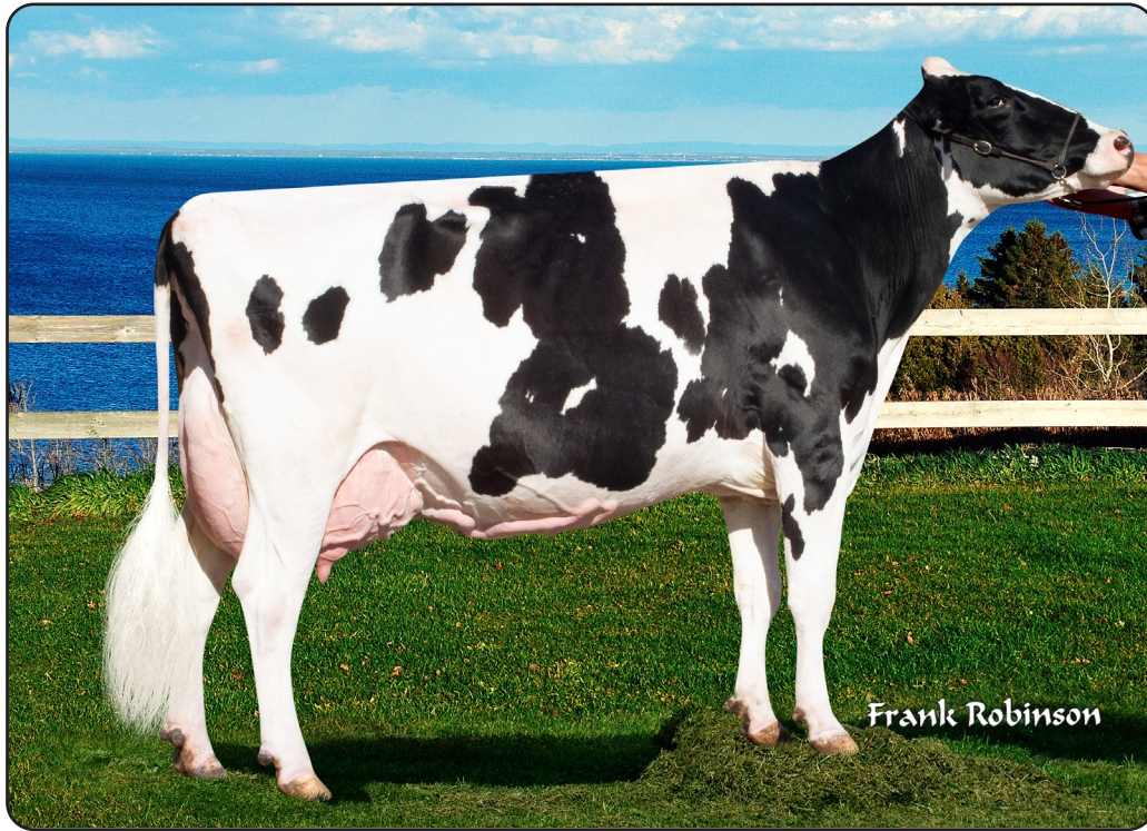
Poly Gold Chip Rain-Tw "EX-91" Dam of Lot 29