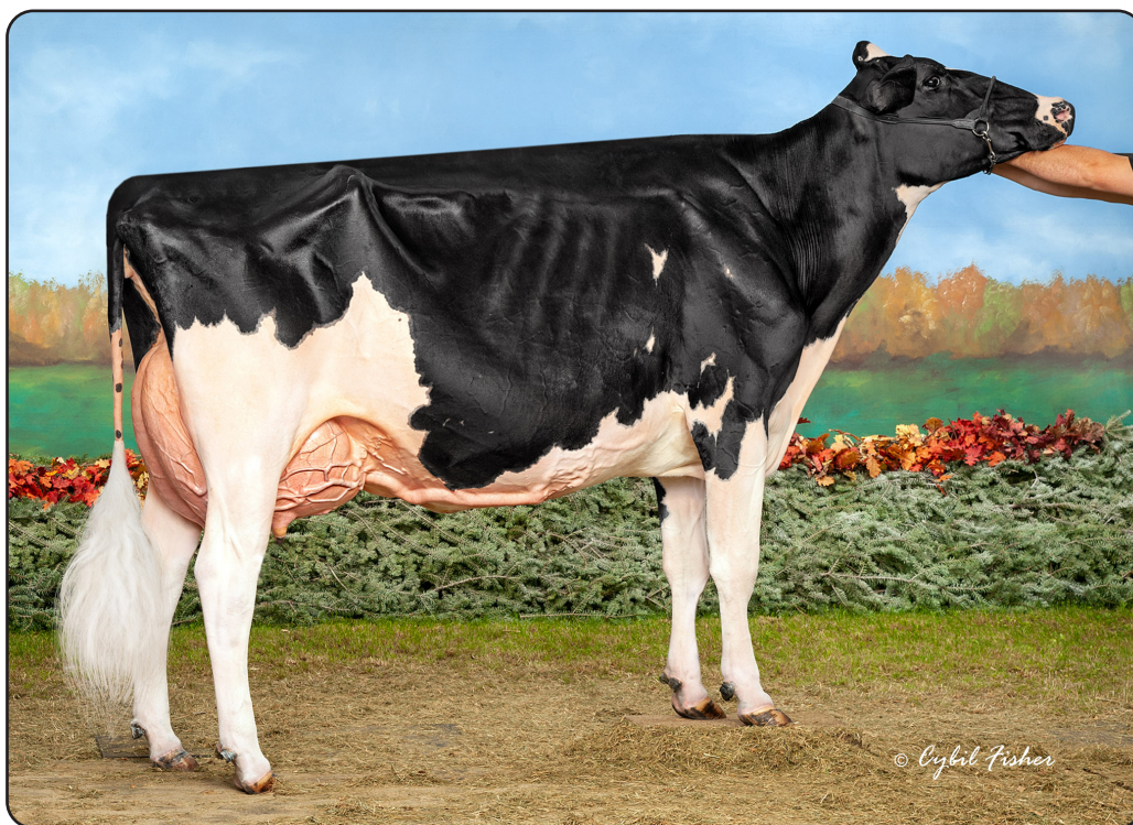
Alfinch Zelgodis Taci "2E-96" Reserve All-American Aged Cow 2021 Dam of Lot 2