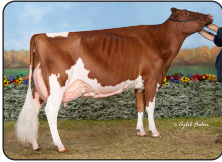
Ms Candy Apple-Red-ET “2E-94” 2x Unanimous All-American R&W Granddam of Lot 7