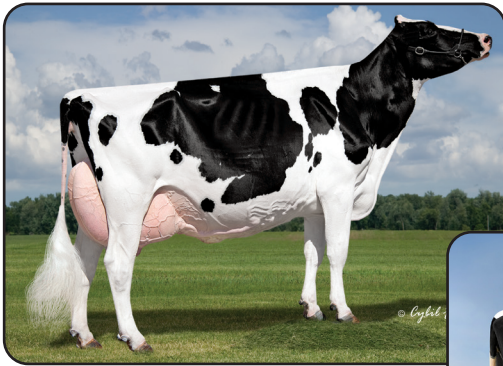
Dubeau Dundee Hezbollah “EX-92” All-American & All-Canadian Sr. 2 Year Old 2009 Third Dam of Lot 14