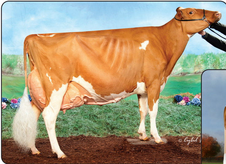
Rosedale Lucky-Rose-Red “EX-94 2E” Reserve All-American R&W Aged Cow 2018 Dam of Lot 1