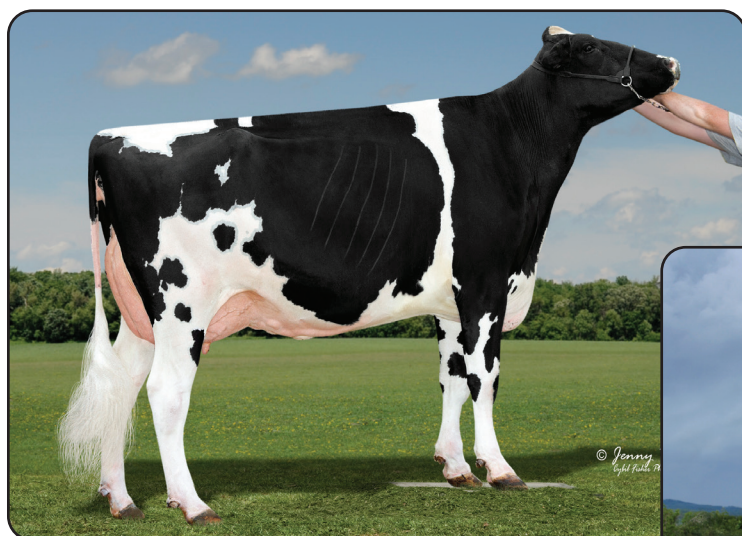
Luck-E Avalanche Athena "EX-93" Dam of Lot 19