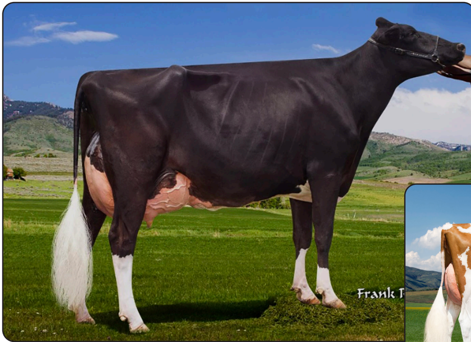
Gabz Corvette Roxy *RC “EX-92” Grand Champion All-Utah Show 2021 Dam of Lot 5