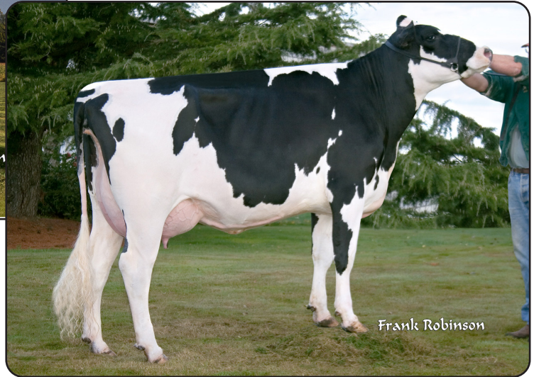
Miss Shottle Maggie Mae-ET "2E-92" Third Dam of Lot 25