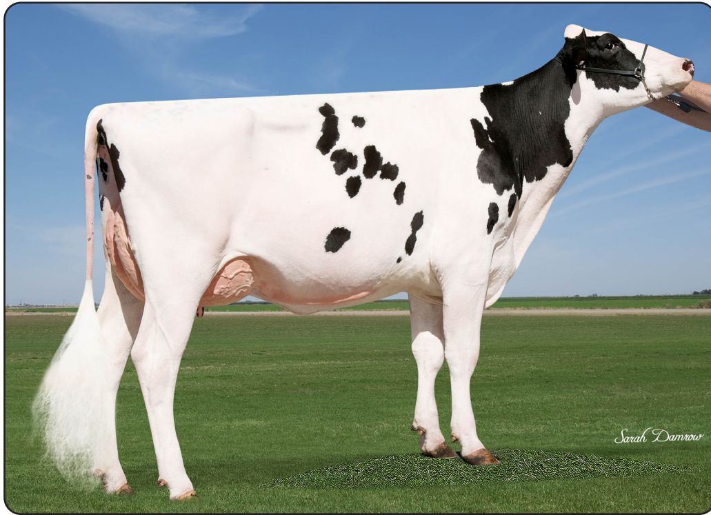
Miss Lets Just Be Friends "EX-90 EX-MS" Maternal Sister to Lot 10