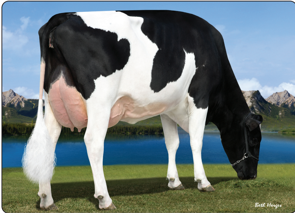
Bryhill Ransom Marquise-ET "GP-83" 1* DOM Fourth Dam of Lot D