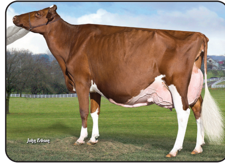
KHW Regiment Apple-Red-ET “4E-96” Grand Champion International R&W Show 2011 Third Dam of Lot 7