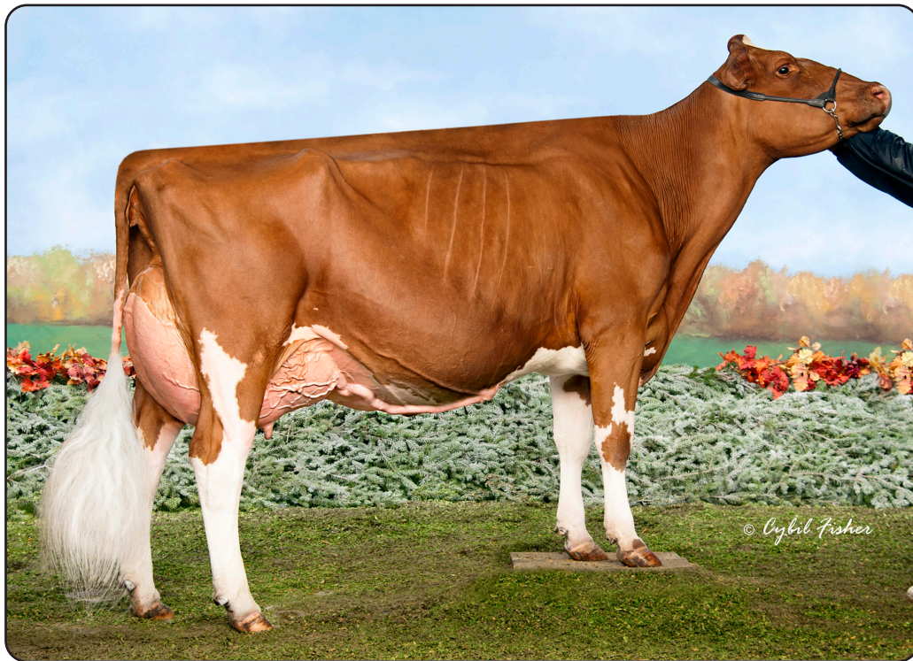
Meadow Green Abso Fanny-Red-ET “2E-96” Grand Champion International R&W Show 2017 Dam of Lot 3