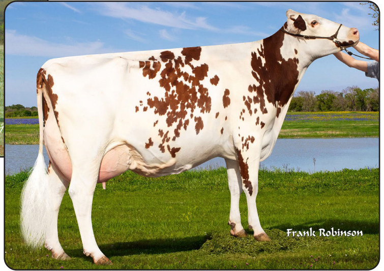
Air-Osa Dfnt Shar 23125-Red "VG-88 EX-MS" Dam of Lot 13