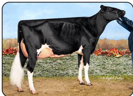
Ms Apple Arrie-ET *RC "EX-93" Reserve All-American Sr. 2 Year Old 2017 Full Sister to Dam of Lot 8