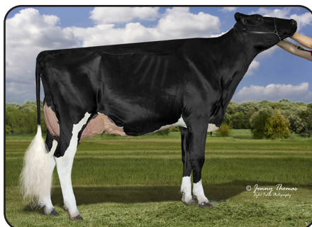
Ms Apple Akasha-ET *RC "EX-92" Full Sister to Dam of Lot 8