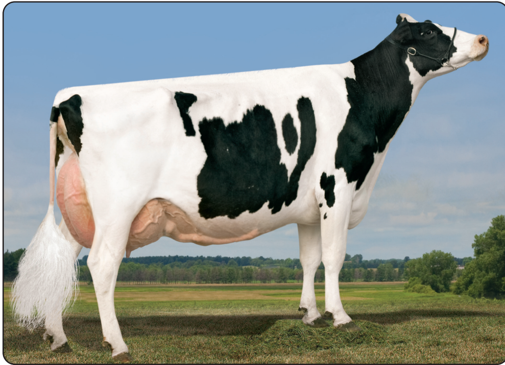
Ocean-View Derry Shania-ET "4E-94" GMD Granddam of Lot 23