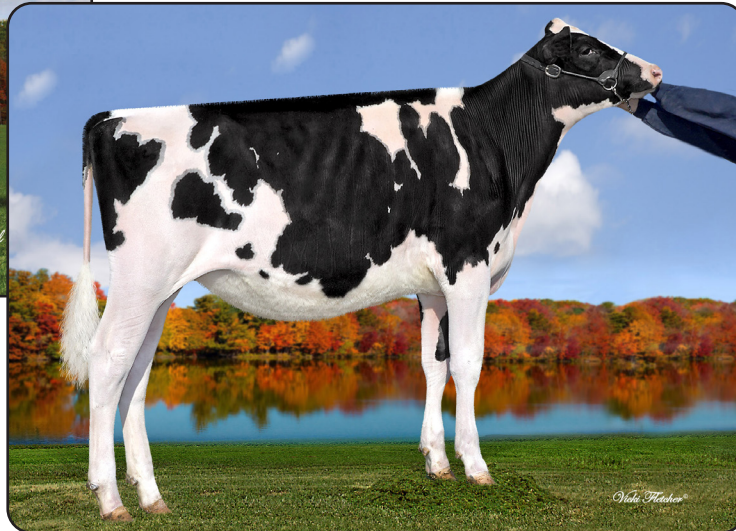
AOT Avalanche Hangover-ET All-American Spring Heifer Calf 2020 Maternal Sister to Dam of Lot A