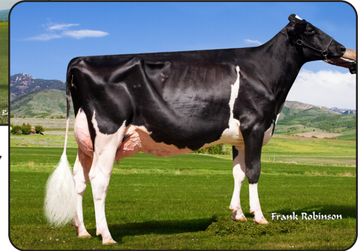
Borderview Solomon Hattie “EX-94” 1st Junior 3 Year Old Western Spring National 2020 Dam of Lot 14