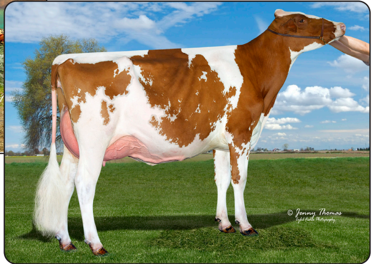
Correia Roz Royalty-Red “VG-86 VG-MS” Dam of Lot 20