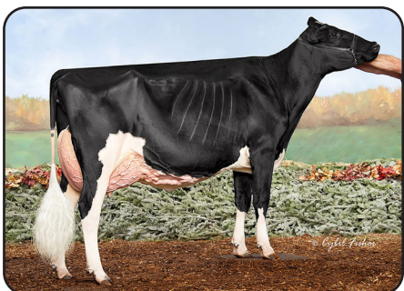
Ms Apple Anzlee-ET *RC "EX-92" Maryland Futurity Winner 2018 Full Sister to Dam of Lot 8