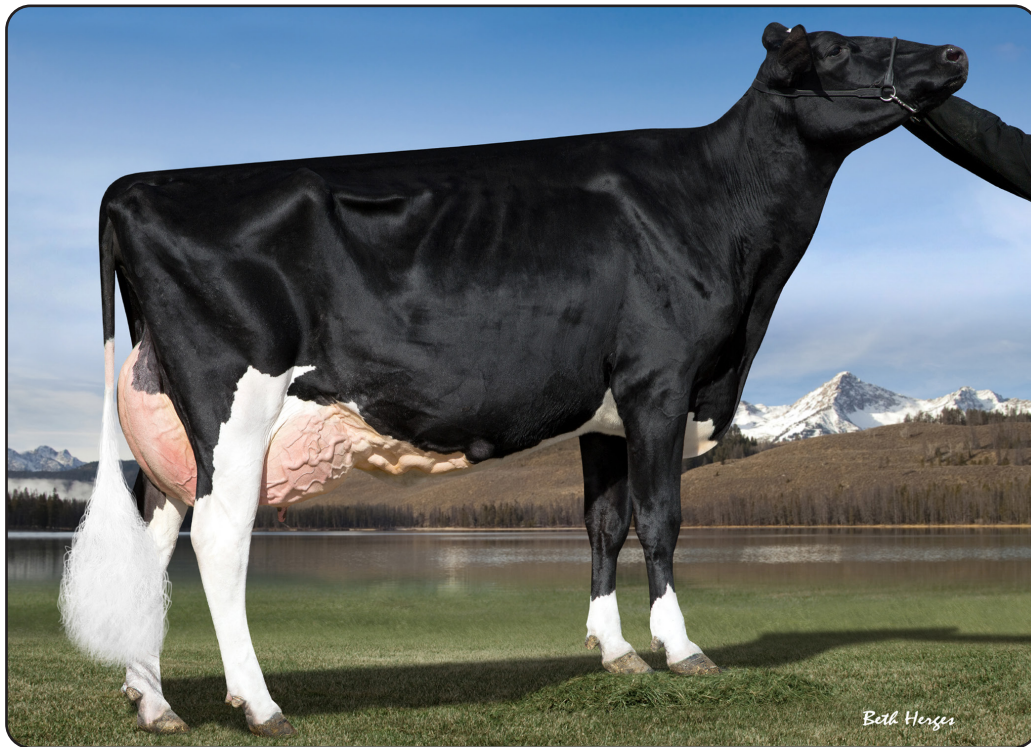
Ms Apple Juice-ET *RC “EX-92” Third Dam of Lot 9