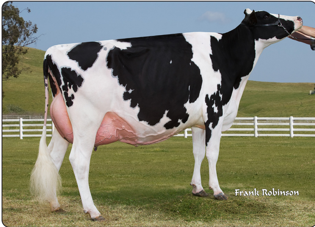
La-Foster Dundee Addie-ET "EX-91" Third Dam of Lot 27