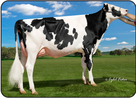
BBM Kingboy Adela-ET *RC “EX-92” Dam of Lot 7