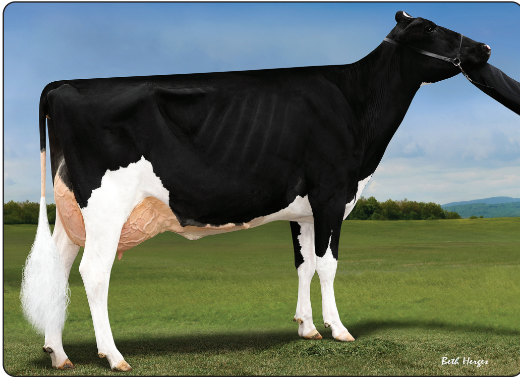
Pleasant Nook Sid Lululemon "3E-94" Granddam of Lot 17