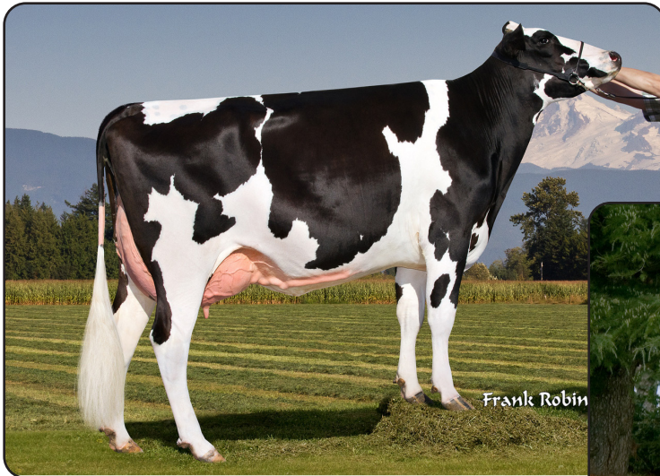
Miss Socrates Maylynn-ET "3E-94" Granddam of Lot 25