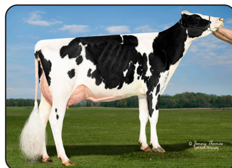
Terra-Linda Achiver 4275-ET "VG-87" Granddam of Lot B