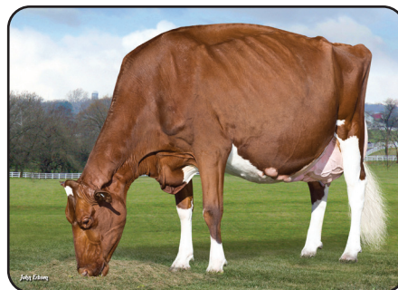
KHW Regiment Apple-Red-ET "4E-96" World Champion Red & White Cow Granddam of Lot 8