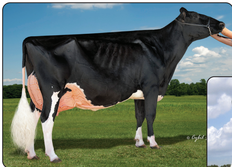
Butz-Butler Gold Barbara-ET “3E-96” 4* GMD Grand Champion International Holstein Show 2019 Same Cow Family as Lot 26