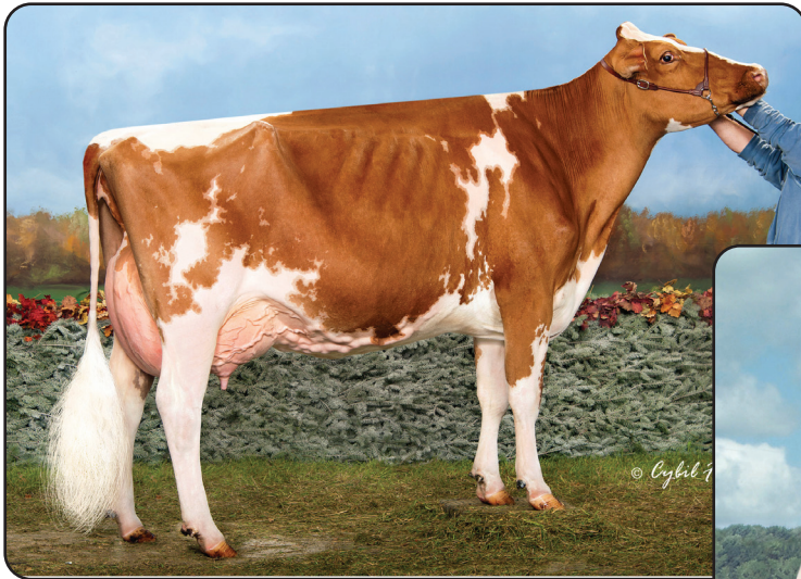
Paulo-Bro-SP Shar-Red-ET “2E-94” Reserve All-American R&W 5 Year Old 2014 Full Sister to Dam of Lots 11 & 12