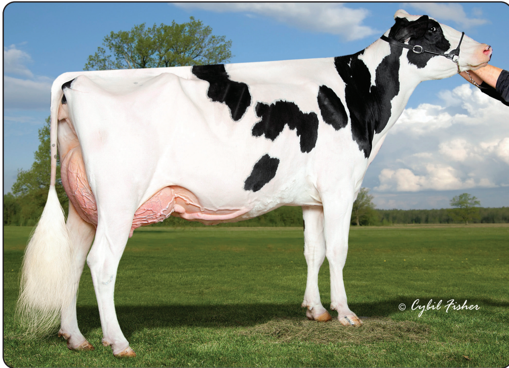
Petitclerc Goldchip Skydome-ET “EX-92 EX-MS” Dam of Lot 30