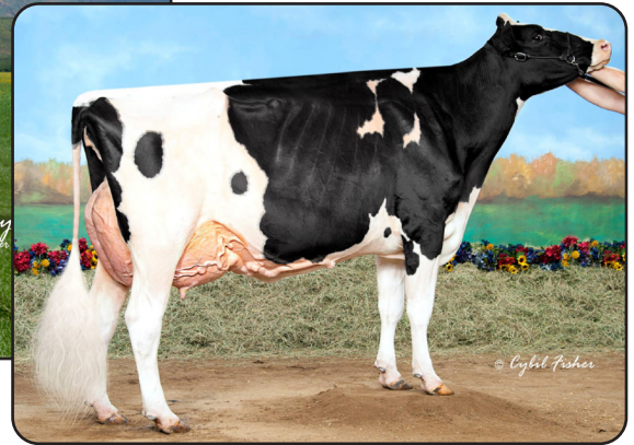
Mahoney Sid Porsha *RC "EX-93" Grand Champion Midwest Fall National 2017 Full Sister to Dam of Lot 6