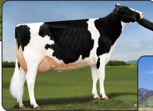
Hez Hezbollahs Honour-ET “EX-94” Intermediate Champion Vermont Holstein Show 2017 Granddam of Lot 14