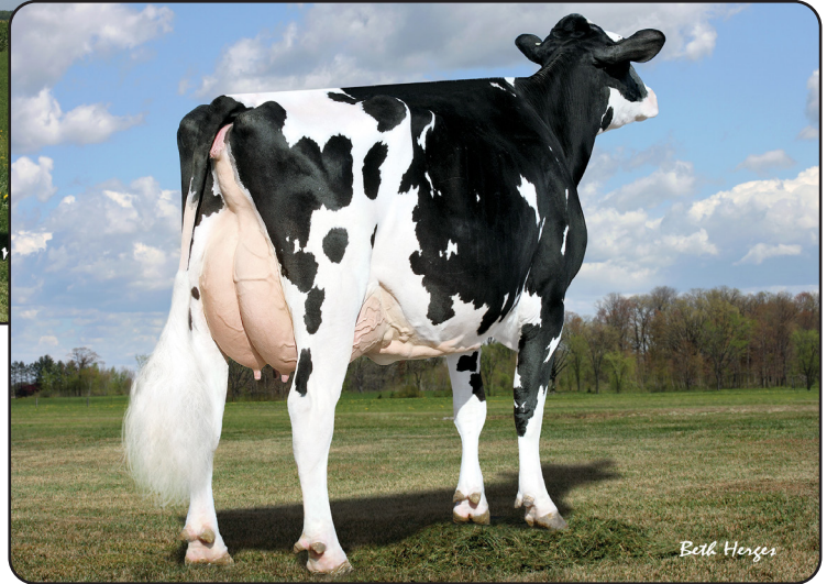
Regancrest Belara-ET "2E-94" DOM Third Dam of Lot 31