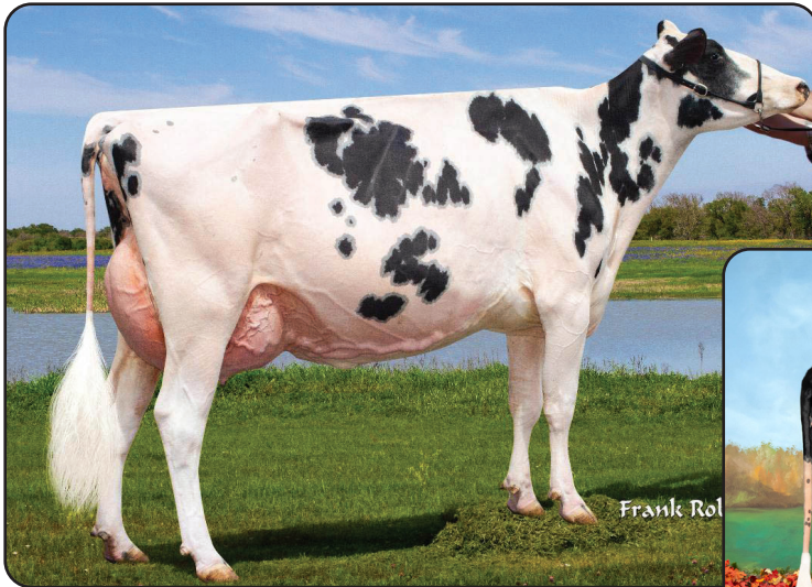
RuAnn Doorman Jean-54712-ET "EX-92" Dam of Lot 4