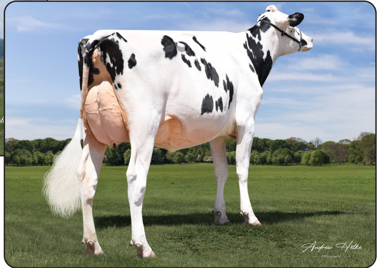
Legacy-Ranch Delight Addely “VG-88 EX-MS” Full Sister to Lot 16