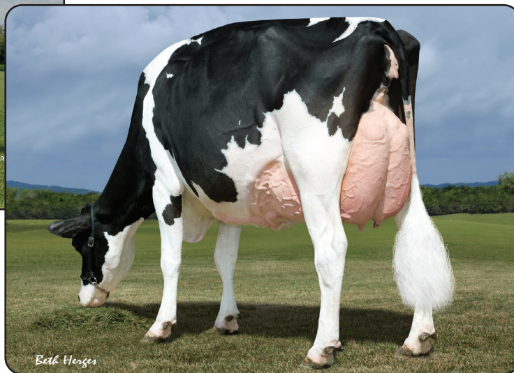
Luck-E Advent Asia-ET *RC "3E-94" Third Dam of Lot 19