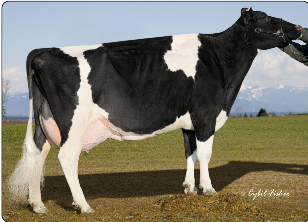
Markwell Durham Rylee-ET “3E-94” Fourth Dam of Lot 22