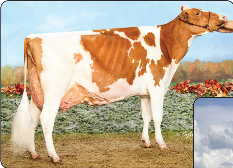
Heatherstone Redhot-Red "EX-92" All-American and All-Canadian Granddam of Lot 15