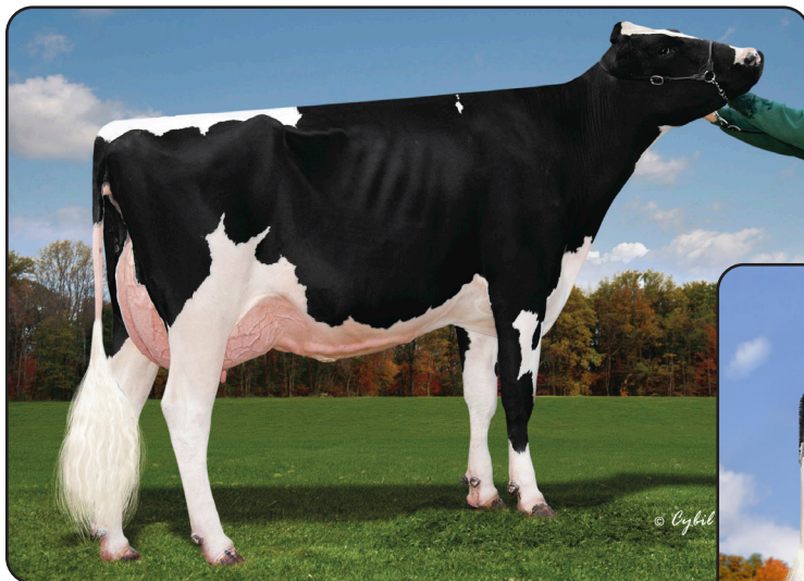
Cookiecutter Dta Habitan-ET “EX-90 EX-MS” DOM Granddam of Lot A