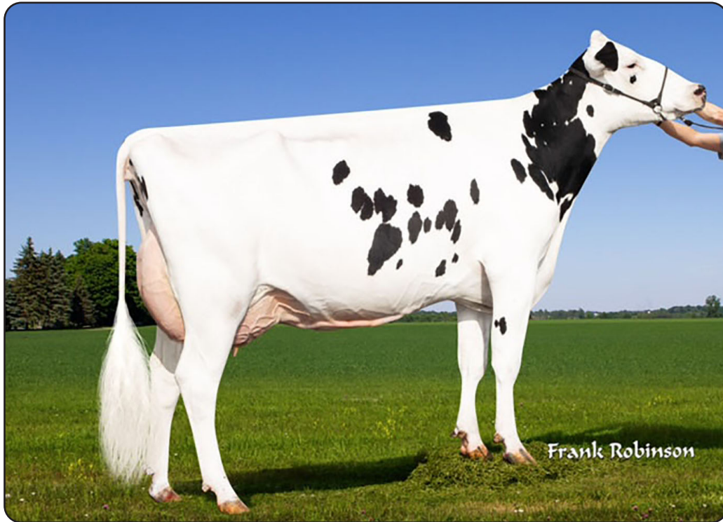
Kisst DLT Romance 80094-ET “EX-91 EX-MS” Dam of Lot 32