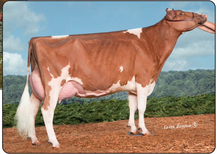
Paulo-Bro-SP Shari-Red-ET “3E-94” Grand Champion California R&W Show 2014 Dam of Lots 11 & 12