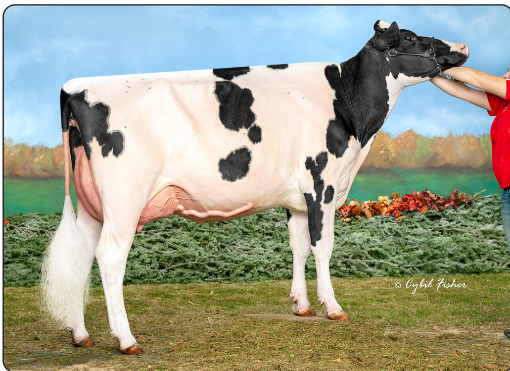
Luck-E Doc Awuki-ET *RC “VG-88 EX-MS” Reserve Junior All-American Jr. 2 Year Old 2021 Dam of Lot 18