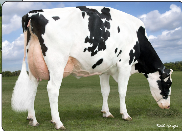
Regancrest Brasilia-ET “2E-92” 17* DOM Fifth Dam of Lot 26