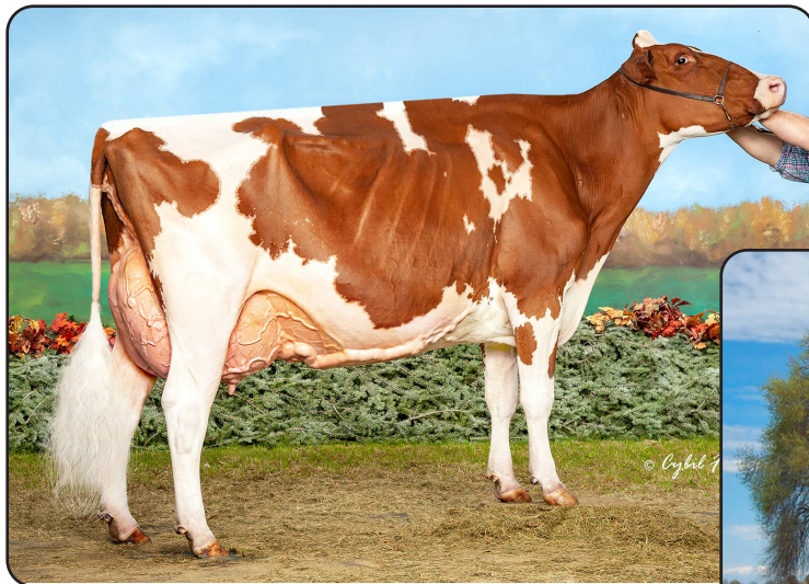
Hol-Star Malo Roz-Red-ET “2E-94” Grand Champion Western Spring National R&W Show 2021 Granddam of Lot 20