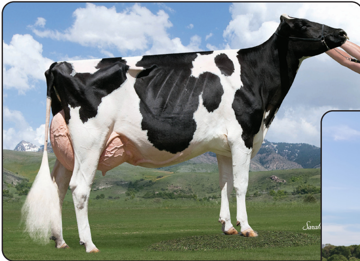
Fern-Oak Meridian 24606-Tw “EX-93” Dam of Lot 16