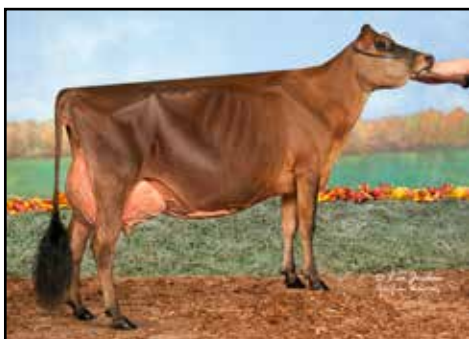
SPATZ PREMIER FELECIA EX-92% DAM OF LOT 29

Domestic Only • Location: Trans Ova, Turlock, CA • Embryos made with sexed semen