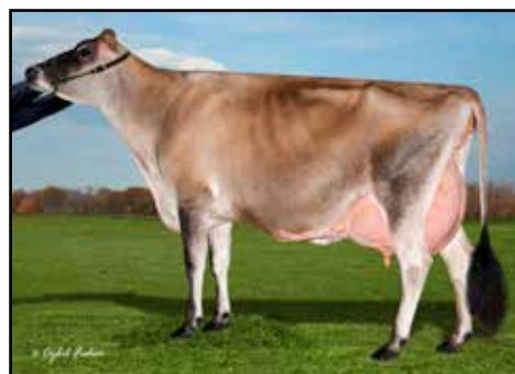
LAVON FARMS APPLEJACK CHEYENE EX-93% DAM OF LOT

Export eligible • Location: Trans Ova, MD • Embryos made with sexed semen