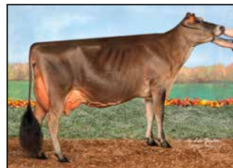
RATLIFF IRWIN VANCY-ET EX-91% MATERNAL SISTER TO LOT 5