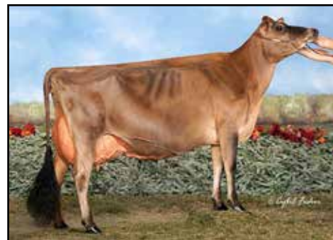
MILO VINDICATION SEASON EX-94% 2ND DAM OF LOT 13