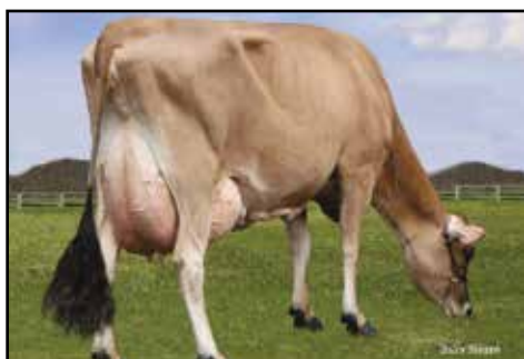
LUCKY HILL JOKER WABORITA VG-87% 5TH DAM OF LOT 22