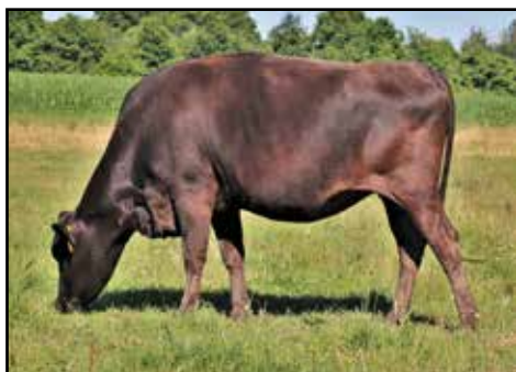
SYNERGY ESF SANJ 96-ET DAM OF LOT 39