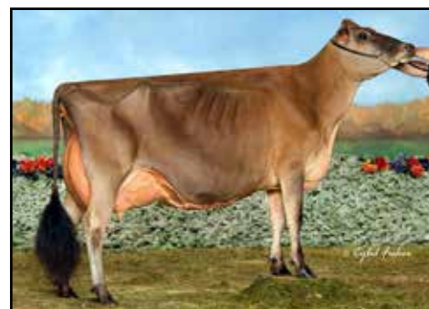
MISS TRIPLE T SERENITY EX-94% 2ND DAM OF LOT

Jake Spatz 717-269-6983 spatzcattleco@gmail.com