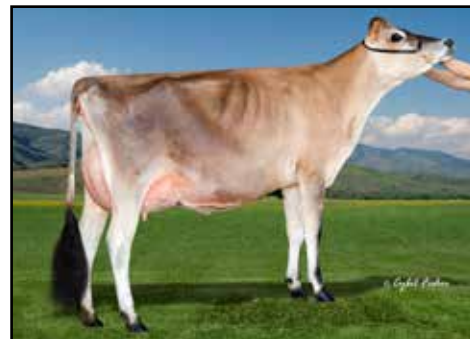
SV HEATHS GENTRY JUJU VG-89% SAME FAMILY AS LOT

2nd Junior 2-Year-Old, Western National 2020