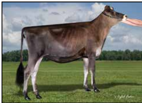
WHITDALE GENTRY GRACEFUL-ET MATERNAL SISTER TO LOT 12

Domestic only • Location: Trans Ova, MD (Ferdinand) Location: Whitdale, NY (Reviresco) Sire: Ferdinand • Embryos made with sexed semen Sire: Reviresco • Reverse Sorted for Female Embryos