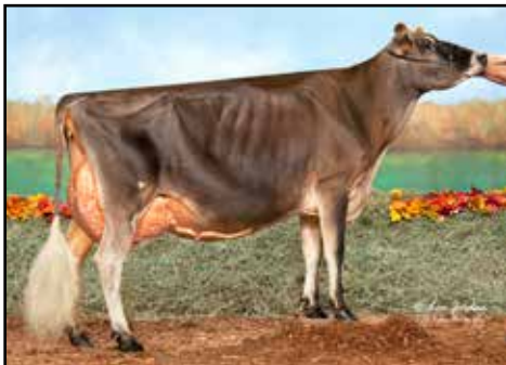
FIELDSTONE EXCITING WELCOME-ET EX-93% DAM OF LOT 30

Export eligible • Location: Boviteq, WI • Embryos made with sexed semen