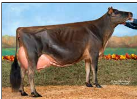
HARMONY-CORNERS FOZZY EX-95% FULL SISTER TO DAM OF LOT 31