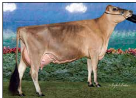
NABHOLZ/SV FELICITY K37 EX-93% 3RD DAM OF LOT 33

Spatz Tequila Fusion EX-93% 3-06 2x 292d 18430 4.3 798 3.8 693 • 4th 4-Year-Old, The Jersey Event 2020