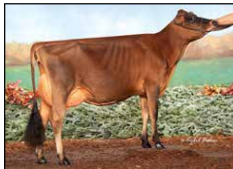
LIGHTNING-RIDGE TEQUILA FERNLEAF VG-87% SAME FAMILY AS LOT 24