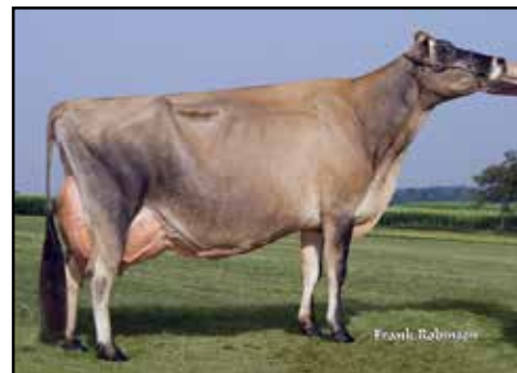
FAMILY HILL SAMBO FERN EX-95% MATERNAL SISTER TO 2ND DAM OF LOT 17 All-American 5-Year-Old 2007

• Res Int Champion, Western National 2001