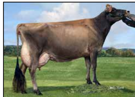
SPATZ ACE FIFI EX-93% 2ND DAM OF LOT 29