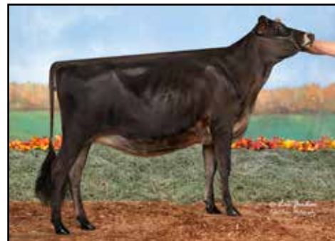
LLR PREMIER TANGO MATERNAL SISTER TO LOT 28

Jr Champion, Western National Junior Show 2020