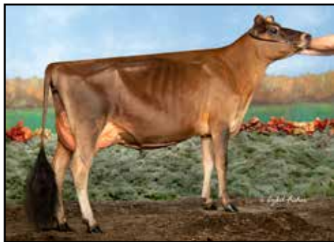
SOUTH MOUNTAIN ANDREAS RASCAL VG-88% DAM OF LOT 4

1st Milking Yearling, NA Open Jersey Show 2020