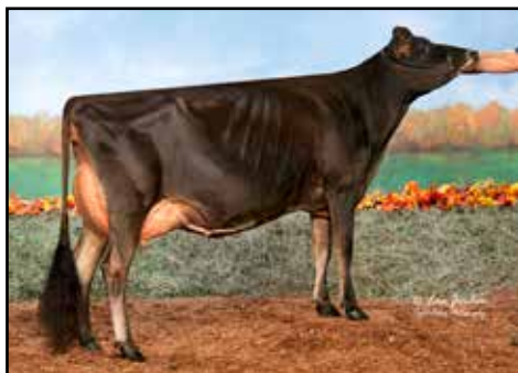
SVHEATHS TEQUILA JOLIE EX-90% DAM OF LOT

Export eligible • Location: Trans Ova, MD • Embryos made with sexed semen