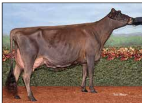
MB LUCKY LADY FIRED UP-ET EX-95-3E-CAN DAM OF LOT