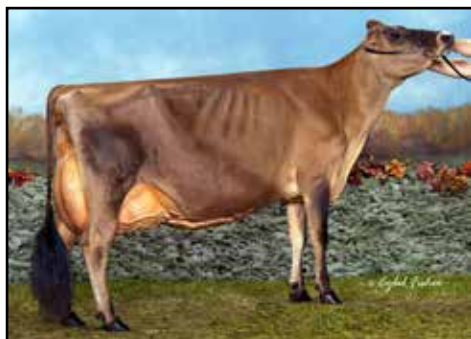
ARETHUSA RESPONSE VIVID-ET EX-96% FULL SISTER TO DAM OF LOT 6

Supreme Champion, Royal Winter Fair 2014