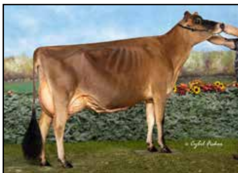
ELECTRAS ETERNAL STAR-ET EX-92% DAM OF LOTS 25 & 26