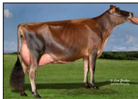
STONEY POINT BELMONT FASHION EX-94% MATERNAL SISTER TO LOT 18 Grand Champion, NYSF 2017

• Nom ABA All-American Junior 2-Year-Old 2020