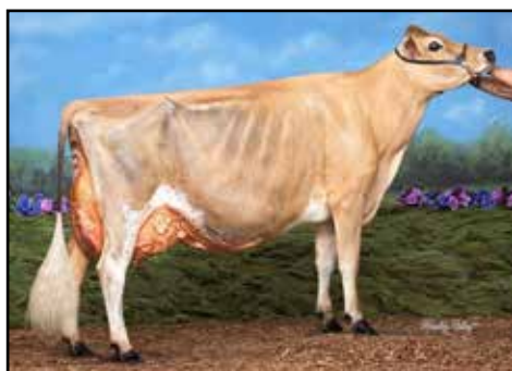
BUSHLEA VAN FERNLEAF EX-93 SAME FAMILY AS LOT 24