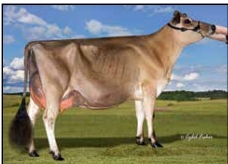
TRIPLE-T-CF SPECIAL GETAWAY EX-93% DAM OF LOT

Export eligible • Location: Trans Ova, MD • Embryos made with sexed semen Sire: River Valley Venus V I P-ET