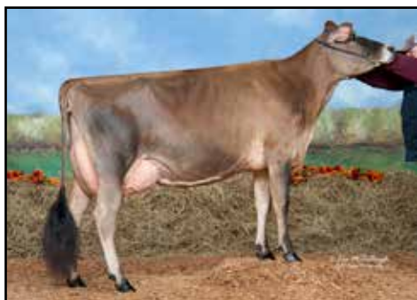
CHILLI MINISTER CINNAMON-ET EX-91% DAM OF LOT 36