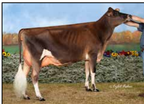
SOUTH MOUNTAIN TEQUILA JEM EX-93% 3RD DAM OF LOT 34

Domestic only • Location: Trans Ova, MD • Embryos made with RSF semen