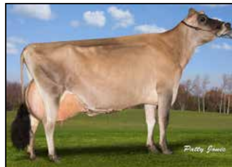
PAYNESIDE MAC N CHEESE EX-93% 2ND DAM OF LOT 35

Payneside Mac N Cheese EX-93% 3-06 2x 305d 19270 5.2 1000 4.1 799 • Reserve All-Canadian Senior 3-Year-Old 2016 • ABA All-American Senior 2-Year-Old 2015 • 1st Senior 2-Year-Old, Intermediate & Res Grand, International Jersey Show 2015