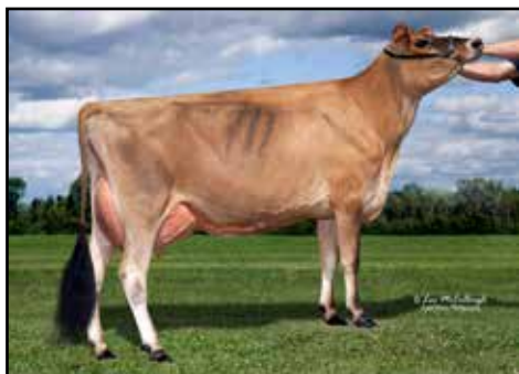
AVONLEA INTL DARE TO DREAM EX-93% 2ND DAM OF LOT 32

Domestic Only • Location: Trans Ova, MD • Embryos made with sexed semen