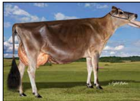
SOUTH MOUNTAIN VOLTAGE RADIANT EX-93% 2ND DAM OF LOT 4