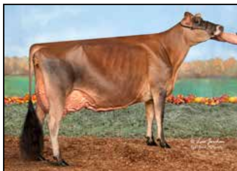
TRIPLE-T-HEATH GETAWAY TO CANCUN EX-93% DAM OF LOT