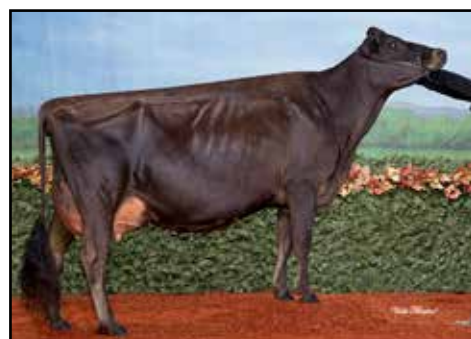
PLEASANT NOOK TEQUILA DAIQUIRI EX-96-2E-CAN DAM OF LOTS 7 & 8