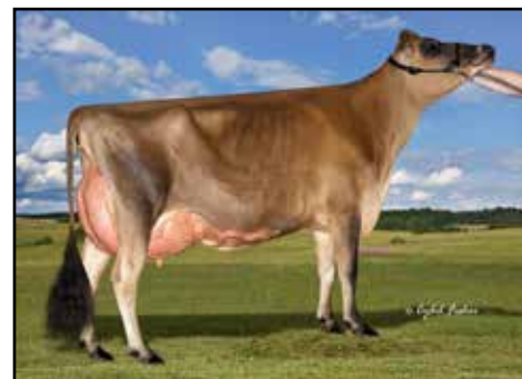
SUGAR & SPICE FIZZ VALLORY-ET EX-91% MATERNAL SISTER TO LOT 6

AJCA Reserve All American Junior 2-Year-Old 2019