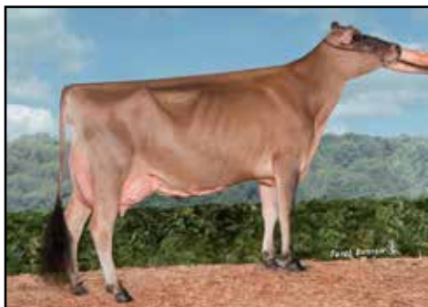
RIVER VALLEY SOCRATES ANTHEM II-ET EX-93% DAM OF LOT 19

Export eligible • Location: Boviteq, WI • Embryos made with sexed semen