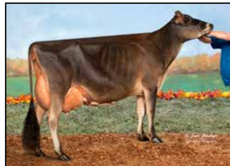
HEATHS APPLEJACK WILLOW EX-92% MATERNAL SISTER TO LOT 30