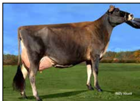
STONEY POINT VINDICATION FALINE EX-95% DAM OF LOT 18

Domestic Only • Location: Trans Ova, MD • Embryos made with sexed semen