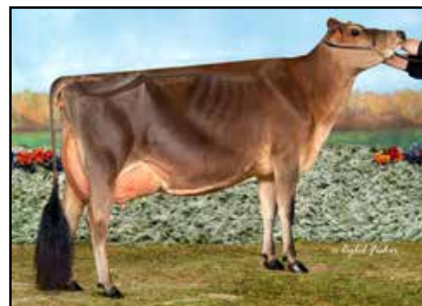
CHILLI PREMIER CINEMA-ET EX-93% MATERNAL SISTER TO DAM OF LOT 36