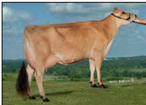
MFW RENEGADE BARON EX-90% 4TH DAM OF LOTS 21 & 22

Domestic Only • Location: MFW, MD • Embryos made with sexed semen