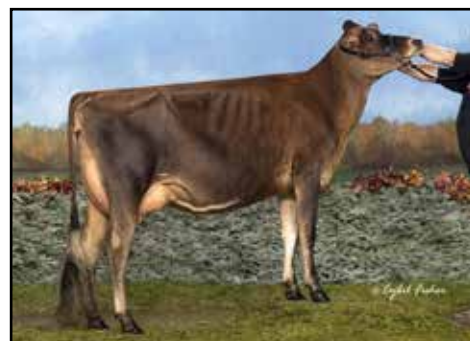
STARS TEQUILA SALT-ET EX-91% MATERNAL SISTER TO LOTS 25 & 26