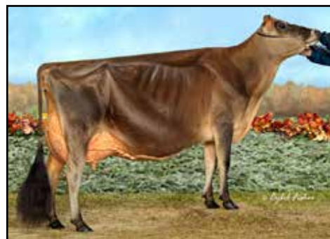
ELLIOTTS BLACKSTONE CHARLOTTE-ET EX-94% 2ND DAM OF LOT