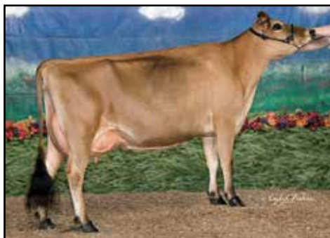
PENNWOOD KAPTAIN ALLIE ABBIE-ET EX-93% 3RD DAM OF LOT 37