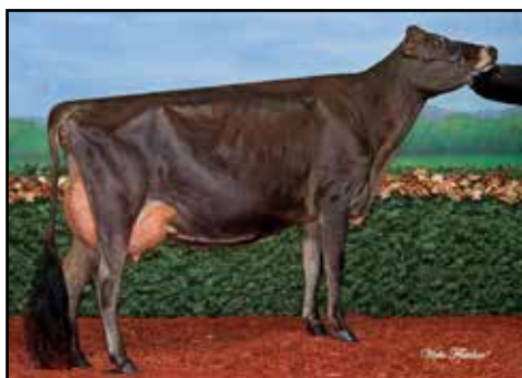
ELLIOTTS TEQUILA SENIORITA-ET EX-91% FULL SISTER TO DAM OF LOT 13

Export eligible • Location: Boviteq, WI • Embryos made with sexed semen