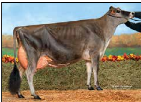
RATLIFF IMPRESSION ANNABELLA-ET EX-95% DAM OF LOT