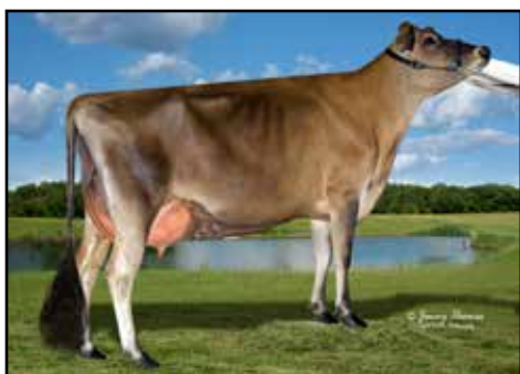
SPATZ TEQUILA FUSION EX-93% FULL SISTER TO LOT 33

Domestic Only • Location: Trans Ova, MD • Embryos made with sexed semen