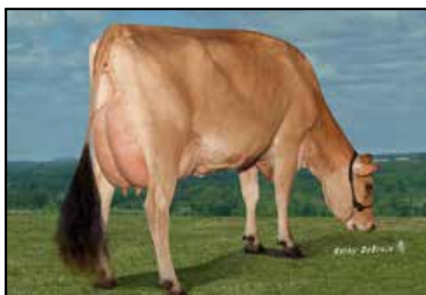
MFW RENEGADE BARON EX-90% 3RD & 4TH DAM OF DONORS OF LOT 23