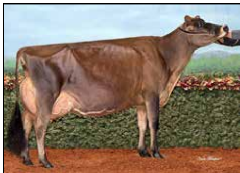
TOWNSIDE TEQUILA RESPONSE R EX-93% DAM OF LOT 20

Export eligible • Location: Trans Ova, MD • Direct Thaw embryos made with RSF semen