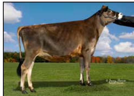
LIDDLERIDGE G.O.A.T.-ET MATERNAL SISTER TO LOT 12

Nominated ABA All-American Fall Yearling 2020