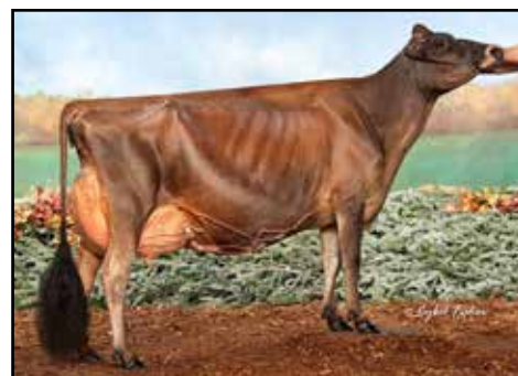
MB LUCKY LADY FELIZ NAVIDAD EX-93% MATERNAL SISTER TO DAM OF LOT