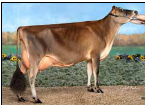
STEESHANIE IATOLA TINKERBELL EX-91% DAM OF LOT 28

Export eligible • Location: Trans Ova, MD • Embryos made with RSF semen