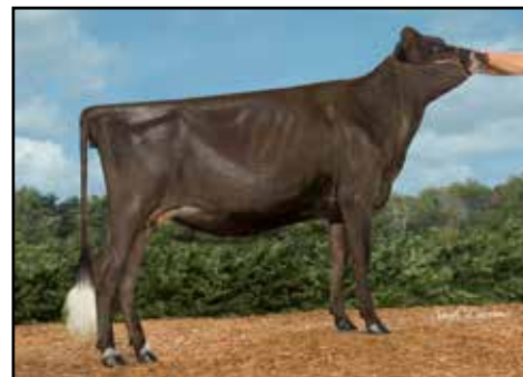
OURWAY RESPONSE PARADISE FULL SISTER TO DAM OF LOT 38 All-Wisconsin Winter Calf 2016