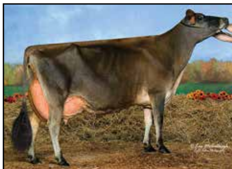
RATLIFF PRICE ALICIA EX-95% 2ND DAM OF LOT