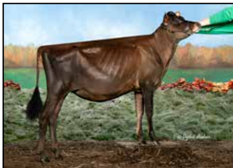
REDHOT VICTORY PARADE FULL SISTER TO LOT 38

Domestic only • Location: Bovtiteq, WI • Embryos made with sexed semen