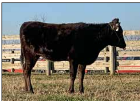
SYNERGY HARUKI HIKOKURA 543G DAM OF LOT 40