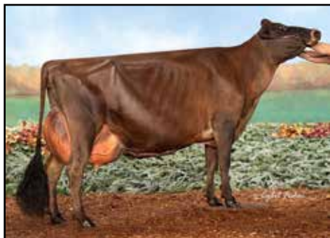
ARETHUSA TEQUILA VISION EX-95% DAM OF LOT 5

Res All-American Lifetime Production Cow 2019