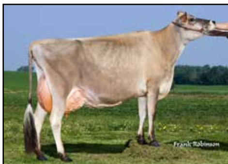
FAMILY HILL COMERICA FIREFLY-ET EX-95% DAM OF LOT 17

Domestic Only • Location: Royalty Ridge, OR • Embryos made with sexed semen