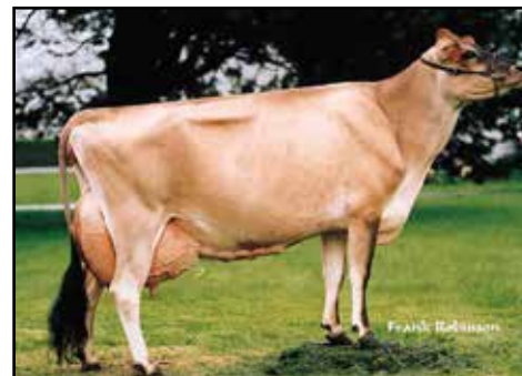
SUNSET CANYON MBSB ANTHEM-ET EX-95% 2ND DAM OF LOT 19

Sunset Canyon Finalist Anthem-ET EX-94% 4-05 2x 305d 20810 4.6 957 3.6 743 Sunset Canyon Comerica Anthem 2-ET EX-93% Sunset Canyon American Anthem-ET EX-93% Sunset Canyon Thunder Anthem-ET EX-93% Sunset Canyon Finalist Anthem-ET EX-93%