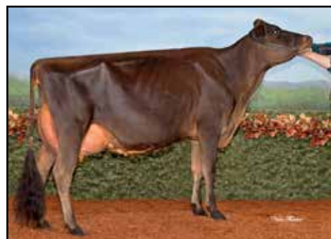
PLEASANT NOOK APPLE DUMPLING VG-88-CAN MATERNAL SISTER TO LOTS 7 & 8

Entourage LLR & Pleasant Nook Jerseys 417-291-3053 Will supertrucker2131@aol.com