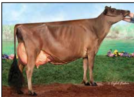
PAYNESIDE MAC N CHEESE EX-93% FULL SISTER TO DAM OF LOT 35

Domestic Only • Location: Trans Ova, Turlock, CA • Embryos made with RSF semen