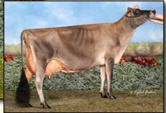
ARETHUSA VERONICAS COMET-ET EX-95% 3RD DAM OF LOT 14 ABA All-American 5-Year-Old 2011