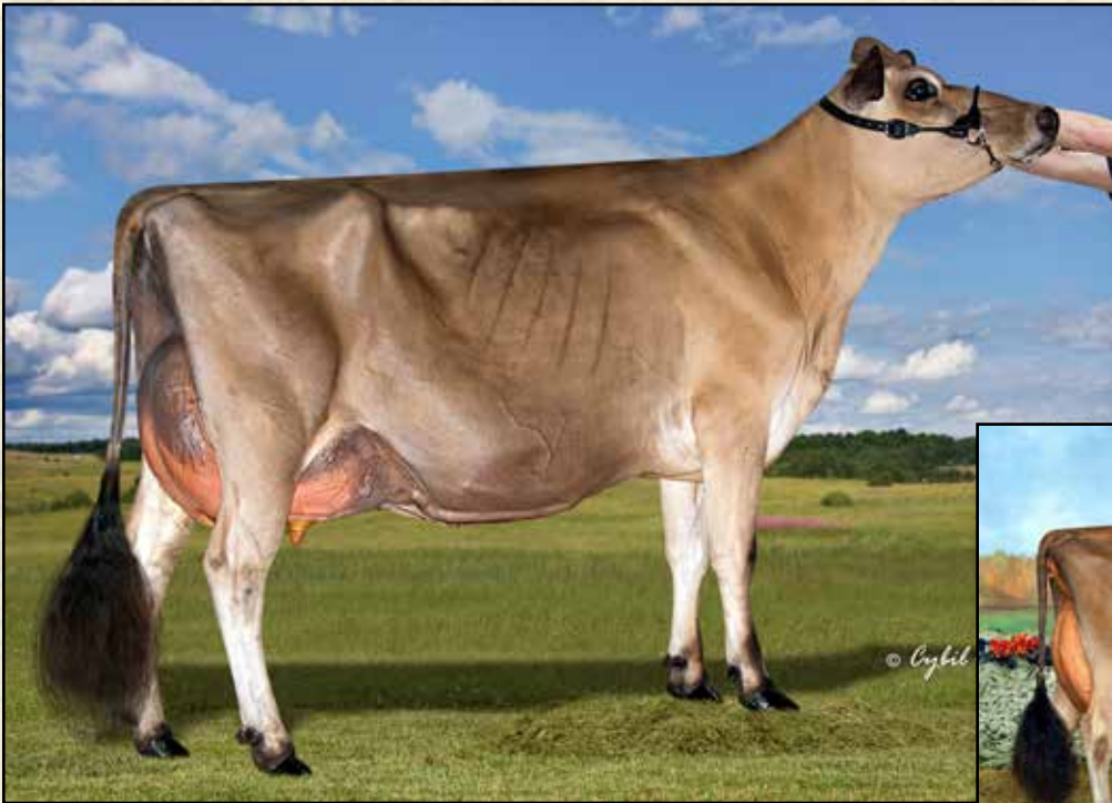
TRIPLE-T-CF SPECIAL GETAWAY-ET EX-90% DAM OF LOT D