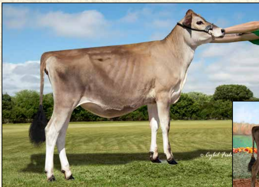
STADVIEW GENTRY VELOCITY SELLS AS LOT 21

Junior Champion, Midwest Jersey Jamboree 2020