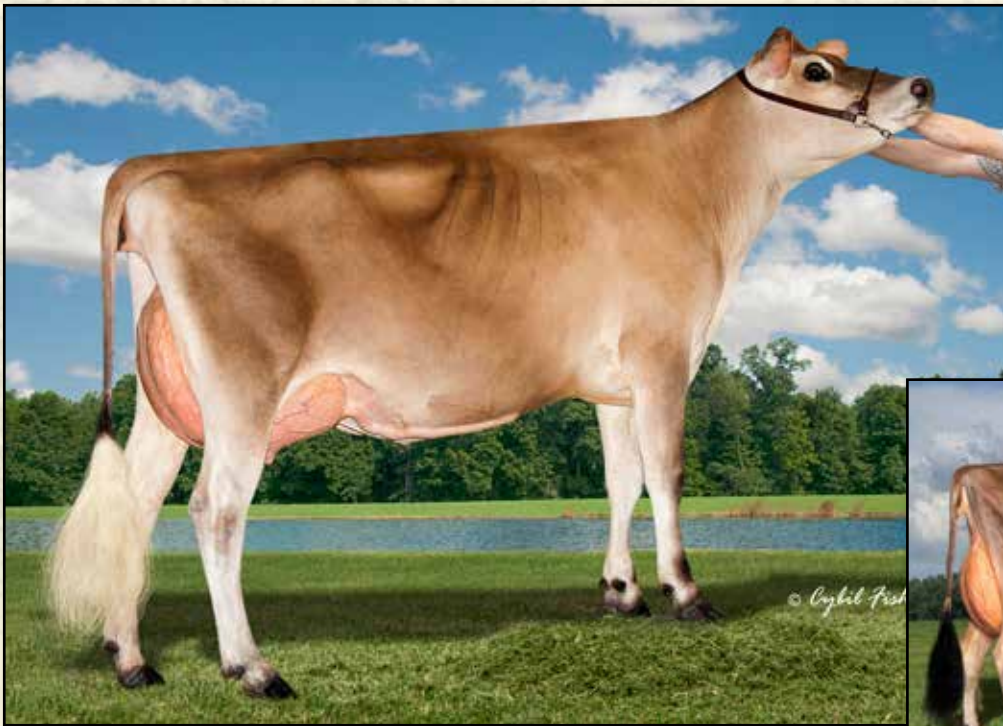
NOBLE OAKS-SSS ROCKSTAR PRESLEY VG-87% SELLS AS LOT 8

1st Summer Junior 2-Year-Old, Northeast All-Breeds Show 2020