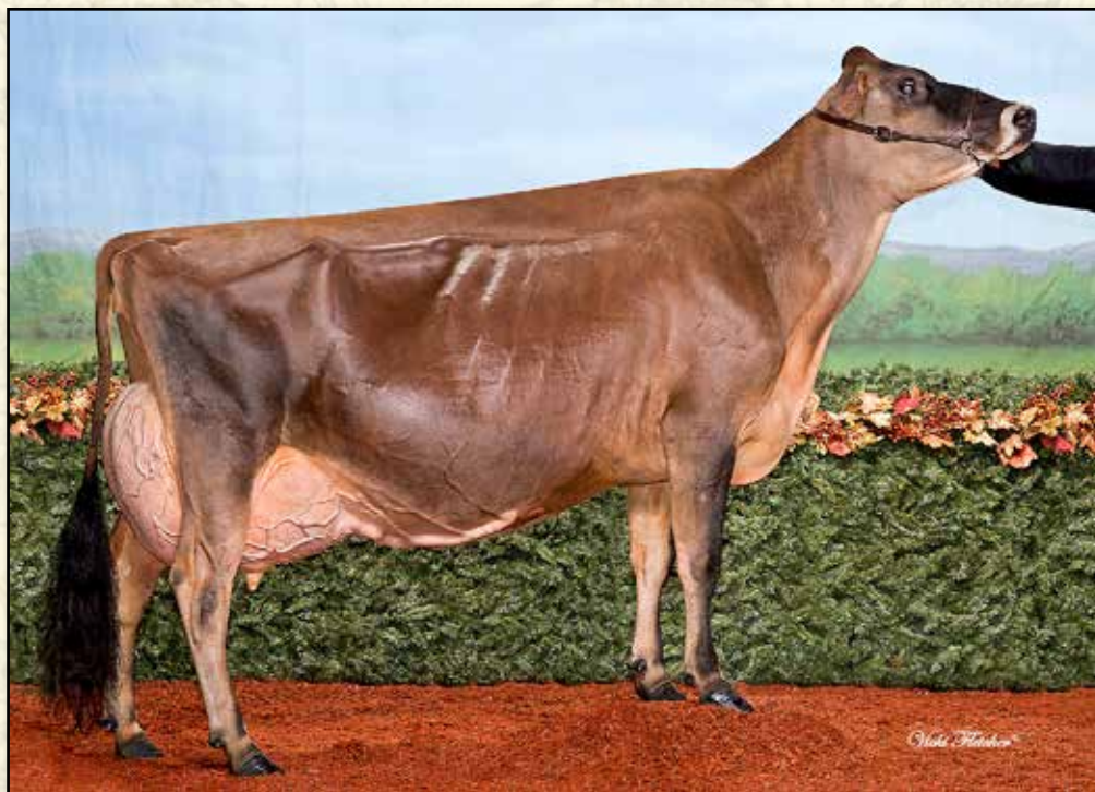
MUSQIE IATOLA MARTHA EX-97% DAM OF LOT 33