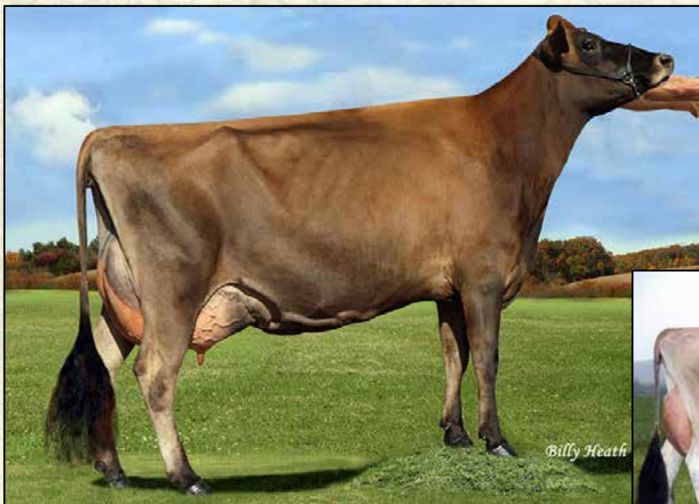
STONEY POINT VERBATIM MOLLY EX-92% MATERNAL SISTER TO DAM OF LOT 9