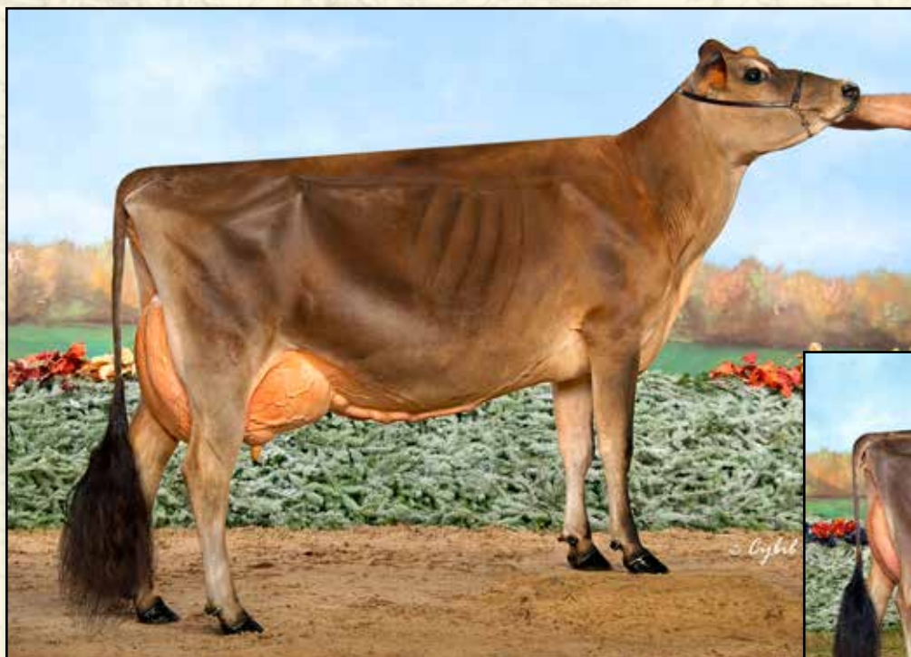
ELLIOTTS REGENCY CORRINA-ET VG-89% DAM OF LOT E

Nominated ABA All-American 4-Year-Old 2019