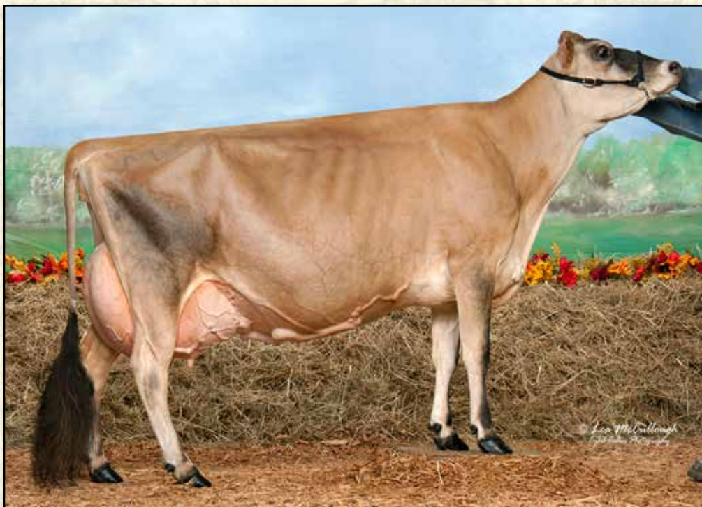
LAGUNA GAMEPLAN POLLY EX-95% 3RD DAM OF LOT 23 Grand Champion, Western National 2011 & 2012