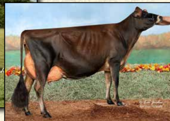
ROLLING RIVER PRESS RELEASE EX-91% MATERNAL SISTER TO DAM OF LOT

Grand Champion, Midwest Jersey Jamboree 2020