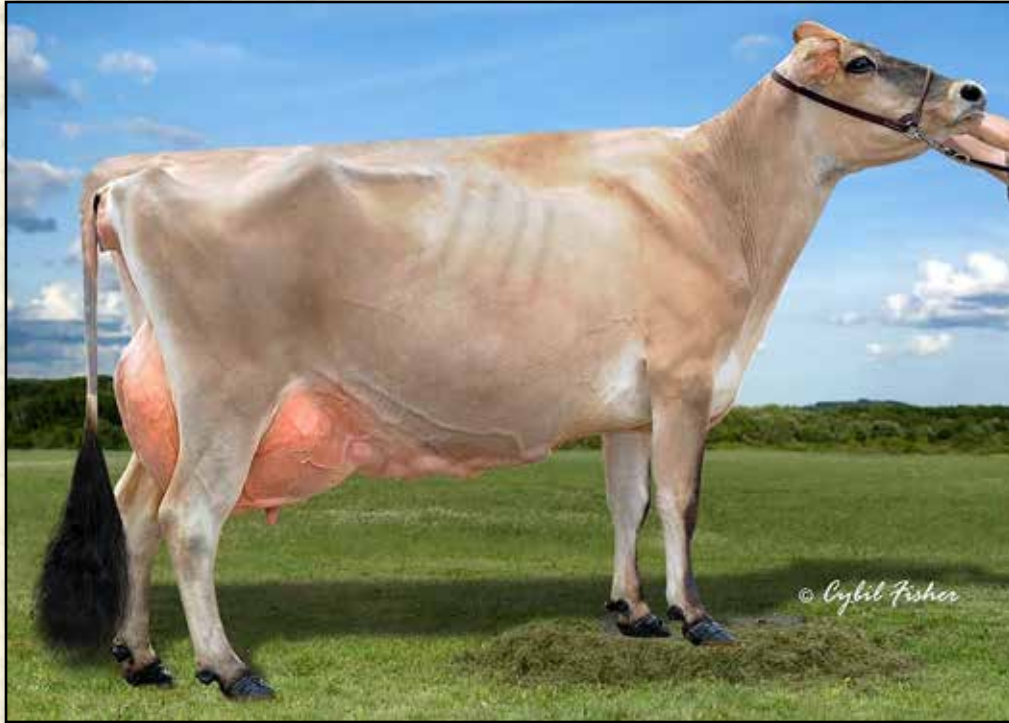
SUNSET CANYON FINALIST ANTHEM-ET EX-94% 3RD DAM OF LOT 4