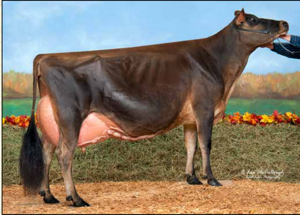
HARMONY-CORNERS FOZZY EX-95% SAME FAMILY AS LOT 26 Premier Performance Cow, All-American 2015