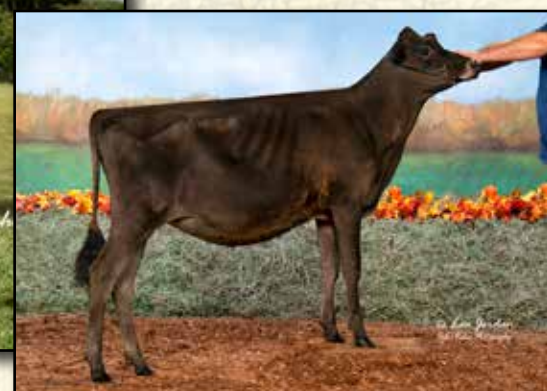
STADVIEW MAGIC MAN VARSITY MATERNAL SISTER TO LOT 21

Junior Champion, Midwest Jersey Jamboree 2020