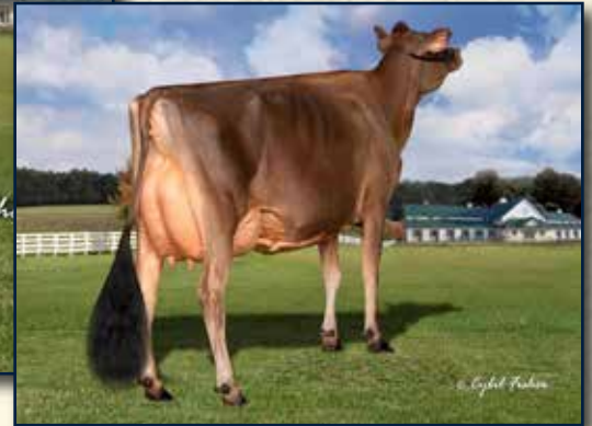
AVONLEA IATOLA VICTORIA EX-94% 2ND DAM OF LOT 28