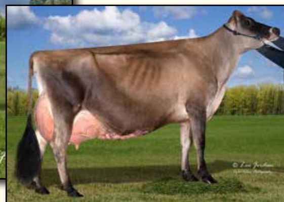
OAKFIELD TBONE VIVIANNE-ET EX-96% DAM OF LOT 1