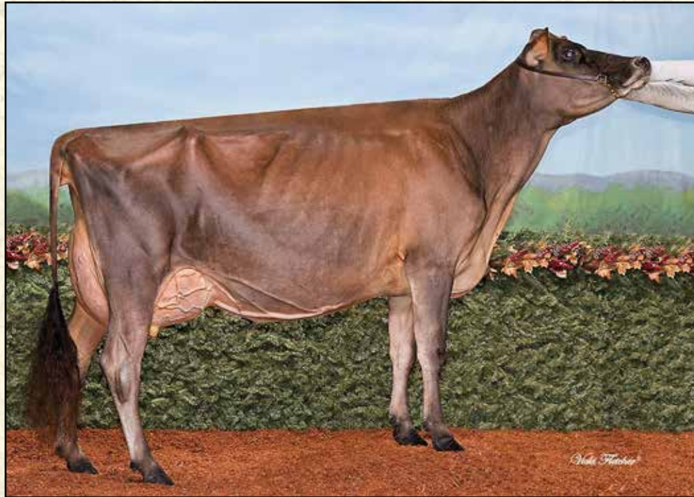
ESPERANZA GA VIVIAN EX-94% DAM OF LOT 24 Grand Champion, Royal Winter Fair 2018