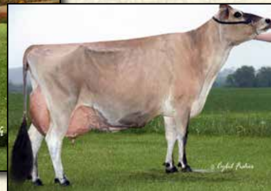
GLENYLE JUDE MADONNA EX-94% 3RD DAM OF LOT 9 Intermediate Champion, All-American 2003