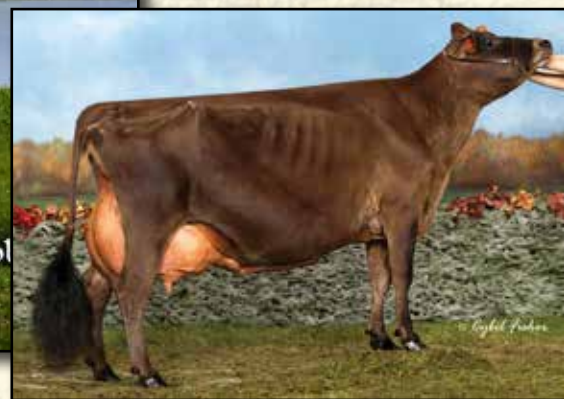
ARETHUSA PRIMETIME DEJA VU-ET EX-95% 2ND DAM OF LOT C