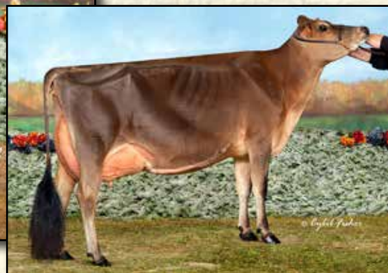
CHILLI PREMIER CINEMA-ET EX-93% 2ND DAM OF LOT E

Nominated ABA All-American 4-Year-Old 2019