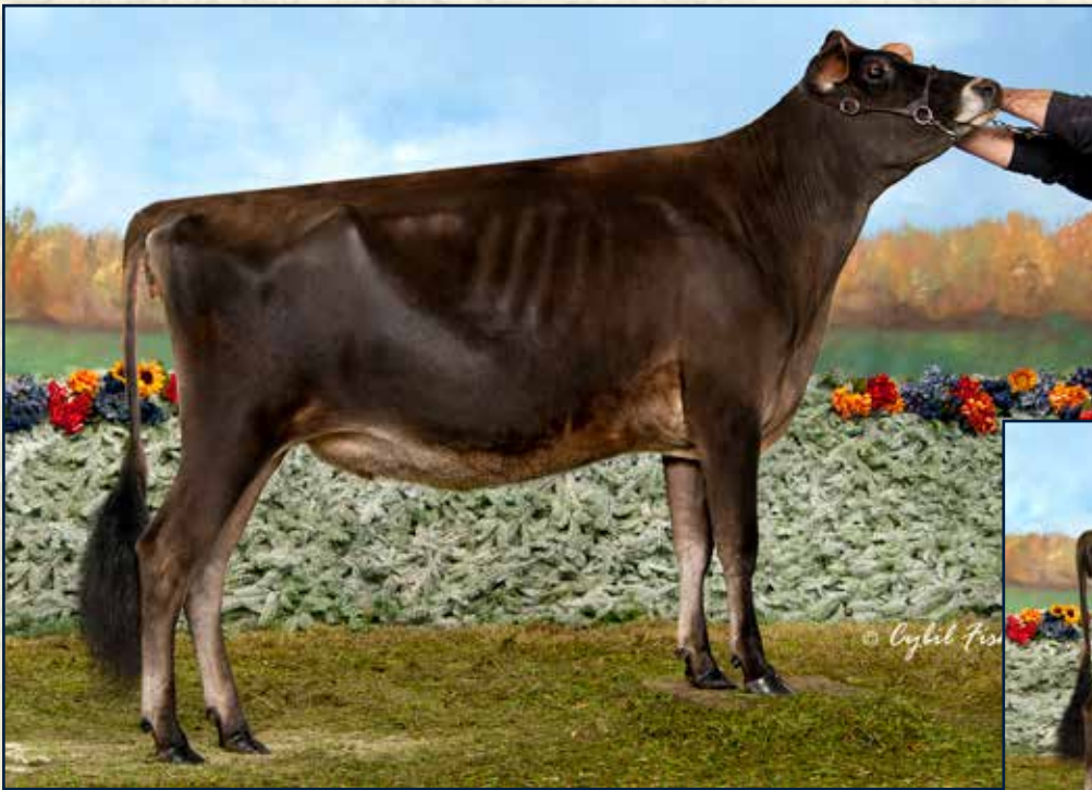
MEADOW RIDGE SPICY HOT ANGIE 2ND DAM OF LOT 32 ABA Reserve All-American Fall Calf 2014