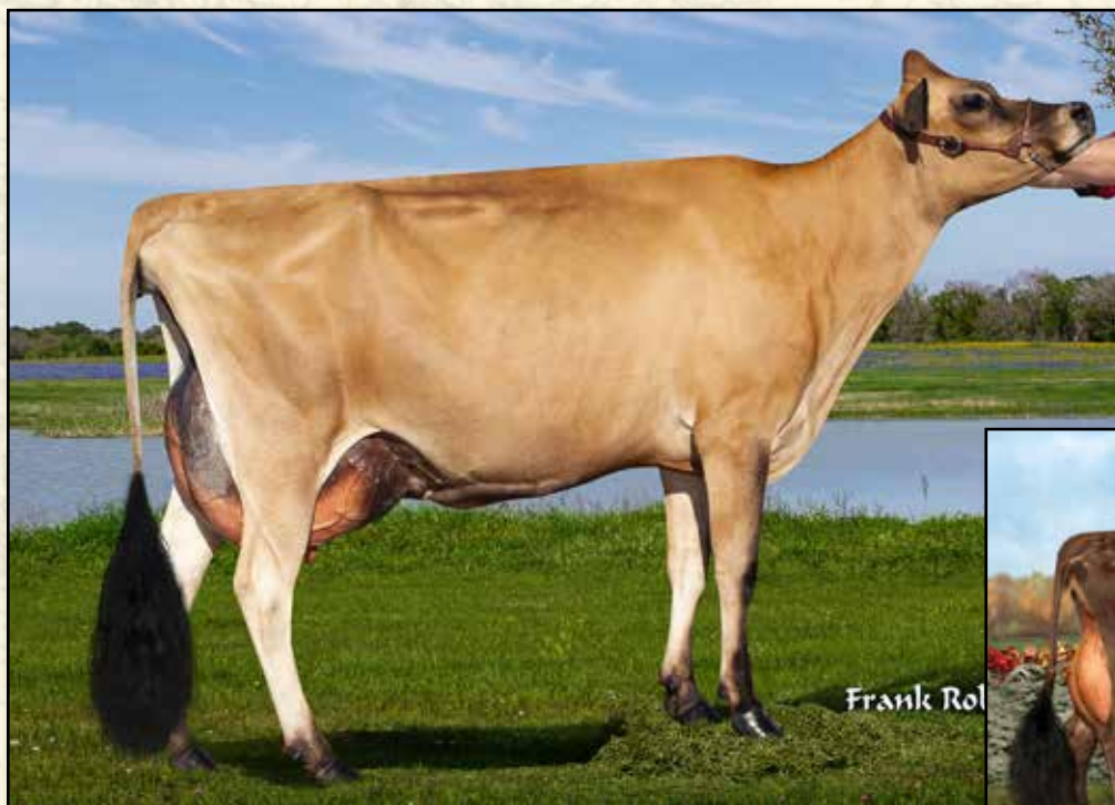
RATLIFF COLTON DIZA-ET EX-90% DAM OF LOT C