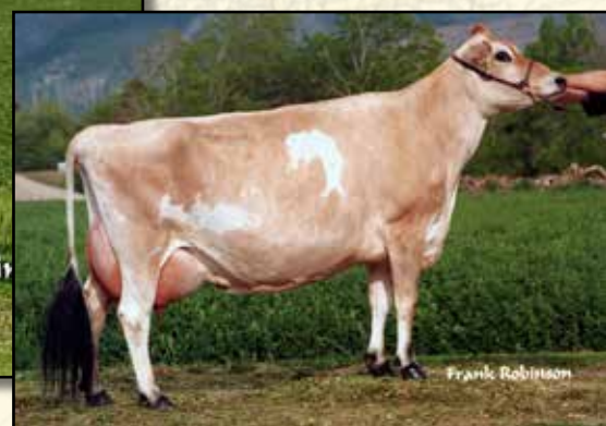
IMPERIAL NORMA EX-94% FOUNDATION FEMALE - FAMILY OF LOT 5