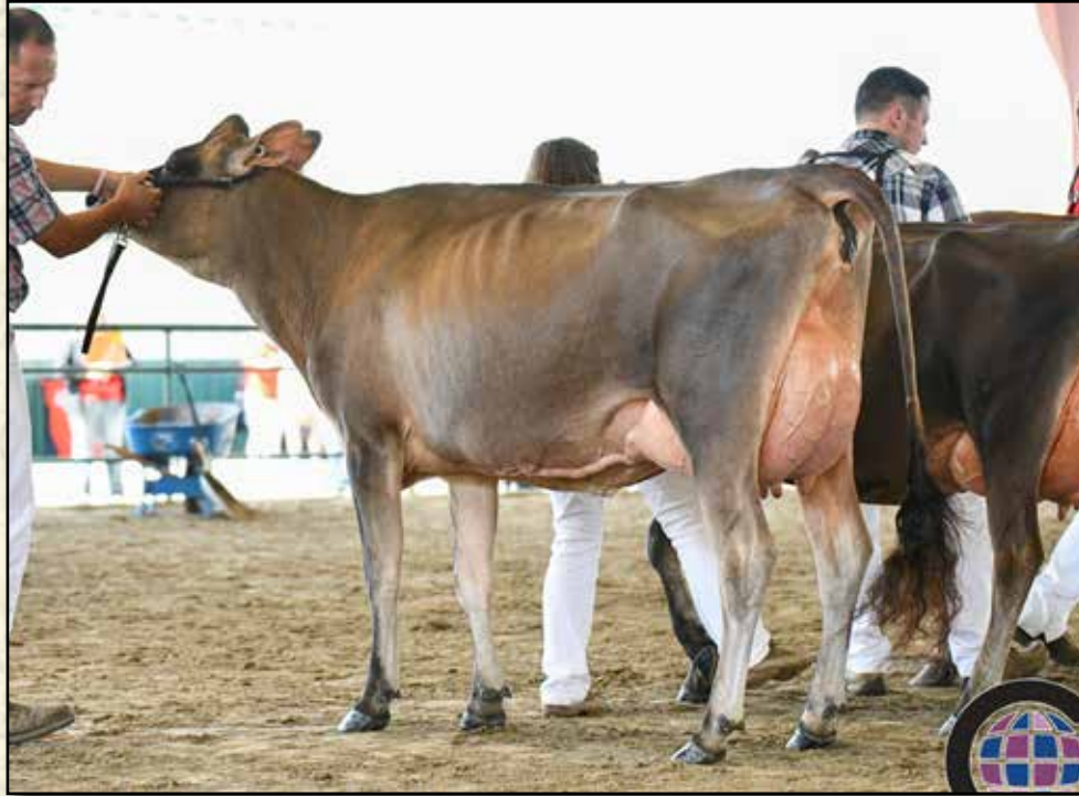
UNDERGROUND VIP MERRYBERRY-ET SELLS AS LOT 10; DAM OF LOT 11

1st Milking Yearling, OH Summer Show 2020