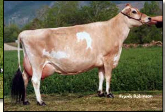
IMPERIAL NORMA EX-94% FOUNDATION FEMALE - FAMILY OF LOT 6