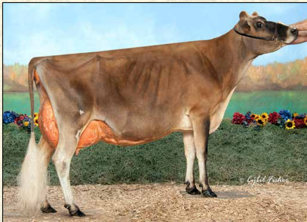
FIELDSTONE EXCITING WELCOME-ET EX-92% MATERNAL SISTER TO DAM OF LOT 7 Nominated ABA All-American 4-Year-Old 2015