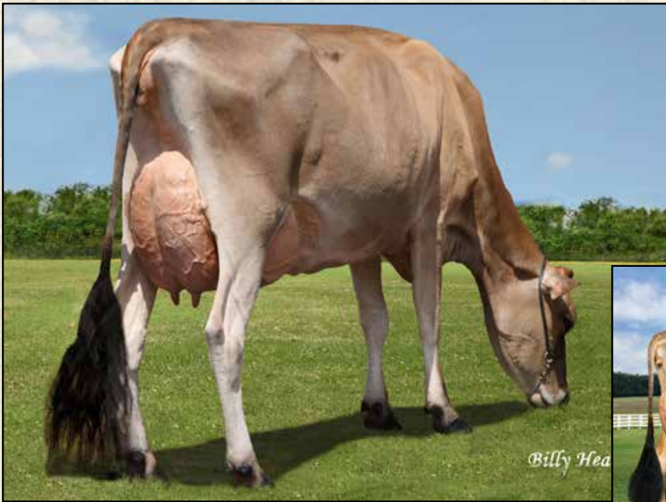
RIVER VALLEY 1701 CHROME JOSIE-ET EX-91% DAM OF LOT F