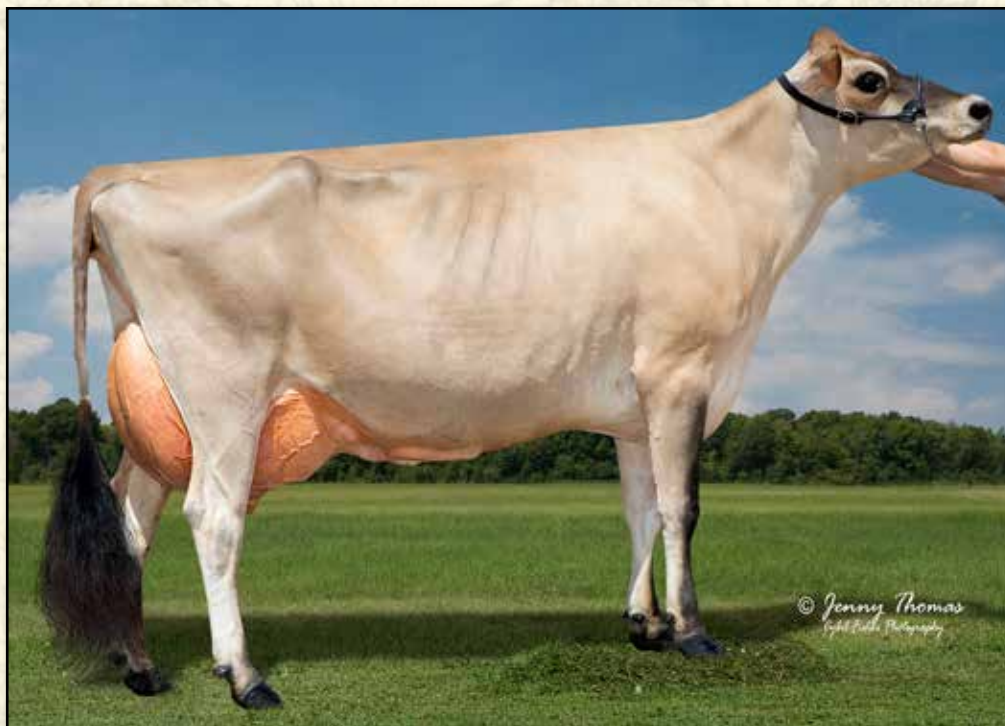
UNDERGROUND LEAHS LOLLIPOP EX-94% DAM OF LOT 29 All-American Aged Cow 2016