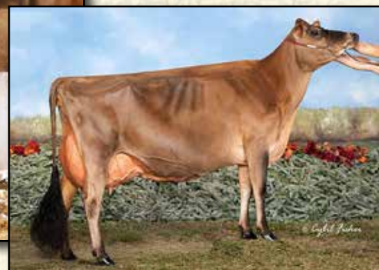
MILO VINDICATION SEASON EX-94% MATERNAL SISTER TO 3RD DAM OF LOT 25 All-Canadian Mature Cow 2012

Reserve Junior Champion, The Jersey Event 2020