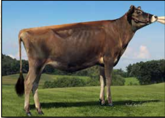
PARTEE-HPDH VELO LAFFY TAFFY-ET EX-90% DAM OF LOT 22