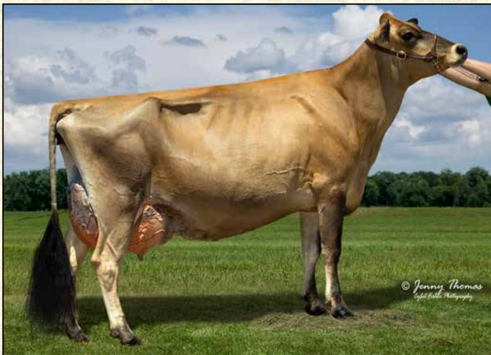
UNDERGROUND MOCHA MACCHIATO EX-92% DAM OF LOT 10; 2ND DAM OF LOT 11 Grand Champion, NY Spring Junior Show 2016