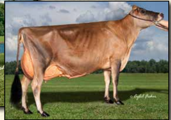
EDN-RU TEQUILA PRISSY PRILLY EX-93% 2ND DAM OF LOT 8

1st Summer Junior 2-Year-Old, Northeast All-Breeds Show 2020