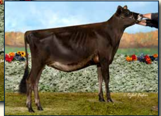
MEADOW RIDGE GENTRY ANGIE MATERNAL SISTER TO 2ND DAM OF LOT 32 AJCA Reserve All-American Fall Calf 2015