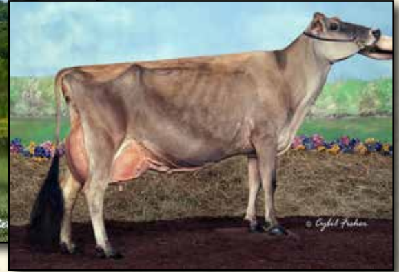
ARETHUSA VERONICAS DASHER EX-95% 2ND DAM OF LOT 2

Reserve All-American Senior 2-Year-Old 2008