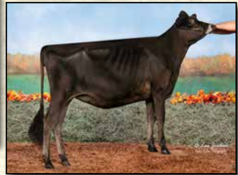
SV HEATHS GENTRY JUNE VG-88% SAME FAMILY AS LOT