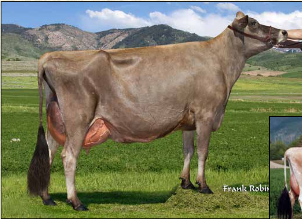
DC RENAISSANCE NORMA EX-94% SAME FAMILY AS LOT 6