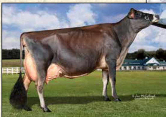
PINE HAVEN SSM MARMIE EX-95% 3RD DAM OF LOT 3 National Grand Champion 2011