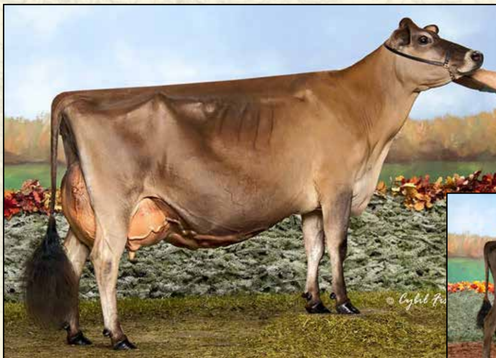
BIG GUNS JAMAICA VANILLA EX-95% 2ND DAM OF LOT 15 All-American Aged Cow 2016