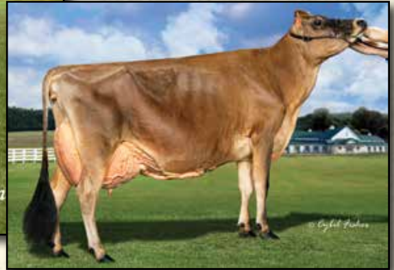
FERMAR PARAMOUNT JOY EX-95% 3RD DAM OF LOT F

1st Lifetime Cheese Cow, International Show 2014