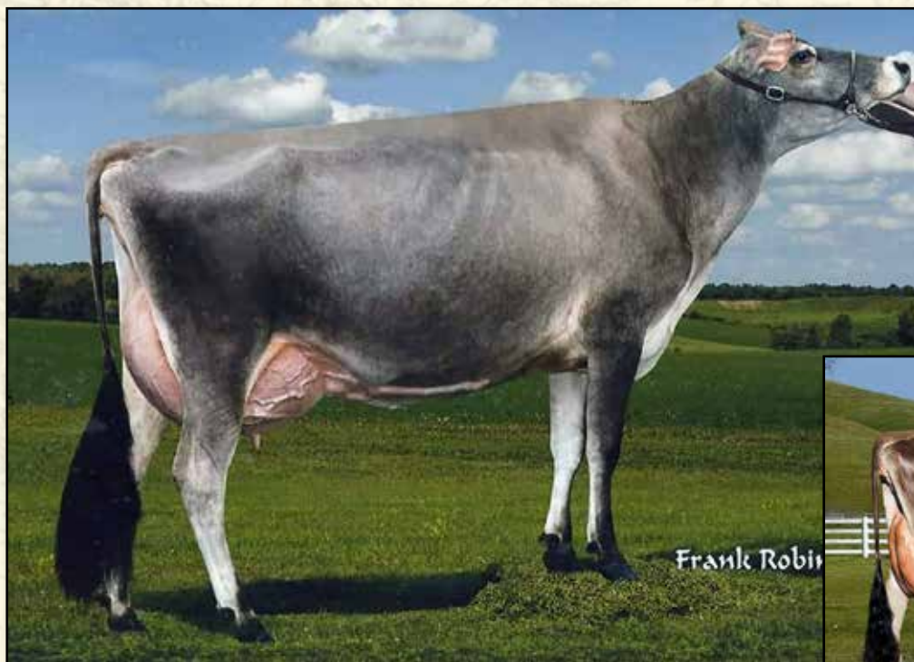
CLAQUATO VERBATIM FLICKER-ET EX-94% 2ND DAM OF LOT 31