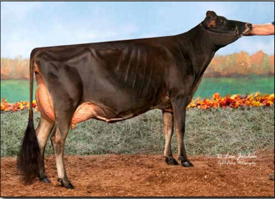
SVHEATHS TEQUILA JOLIE EX-90% DAM OF LOT

AJCA All-American Junior 3-Year-Old 2019