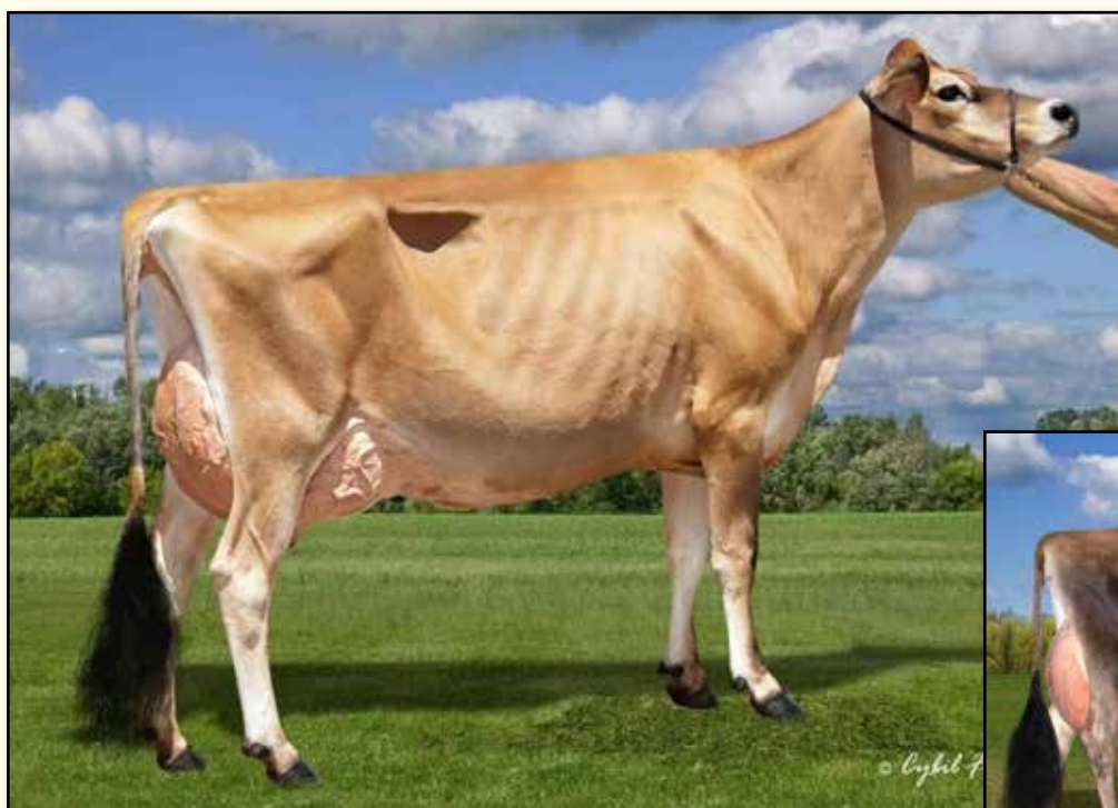
KEVETTA CHROME VIOLIN-ET VG-89% SELLS AS LOT 1