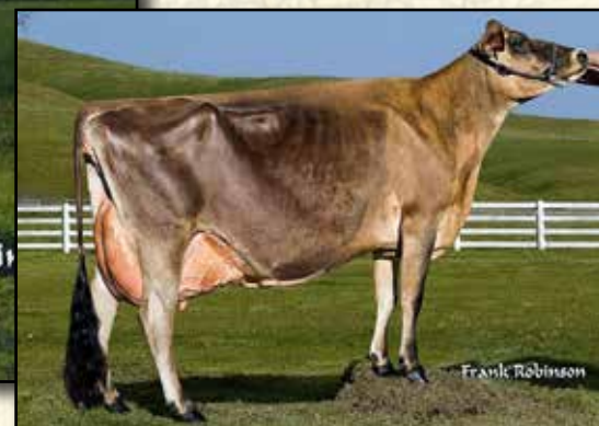
FAMILY HILL G FAITH FLIRT EX-95% 3RD DAM OF LOT 31