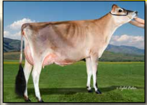
SV HEATHS GENTRY JUJU VG-89% SAME FAMILY AS LOT

AJCA All-American Junior 3-Year-Old 2019