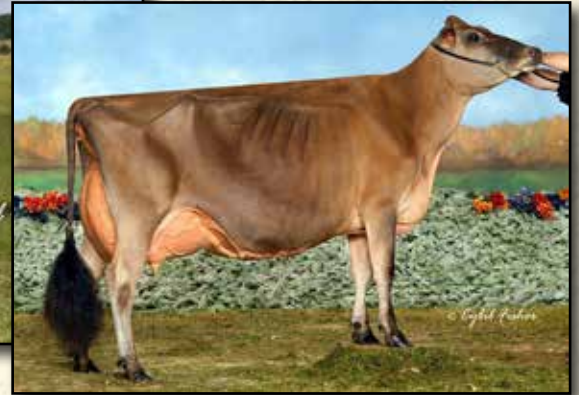
MISS TRIPLE T SERENITY EX-94% 2ND DAM OF LOT D