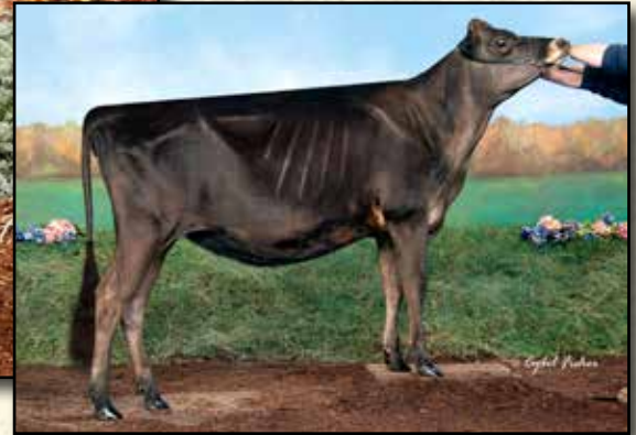
HEART&SOUL FIZZ FAITH VG-89% MATERNAL SISTER TO LOT B ABA Unanimous All-American Winter Yearling 2019