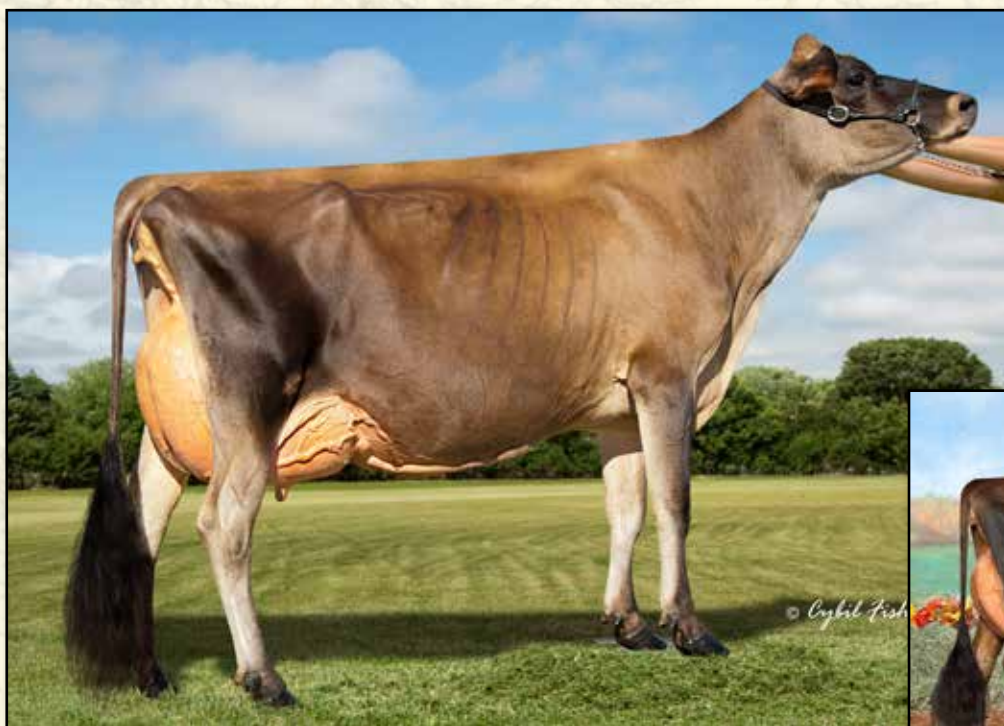
ROLLING RIVER POINSETTIA-ET VG-88% DAM OF LOT

Grand Champion, Midwest Jersey Jamboree 2020