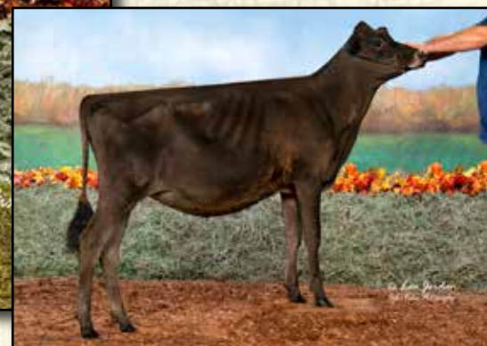
BIG GUNS ANDREAS VEGAS BOMB-ET MATERNAL SISTER TO DAM OF LOT 15 All-American Spring Calf 2019