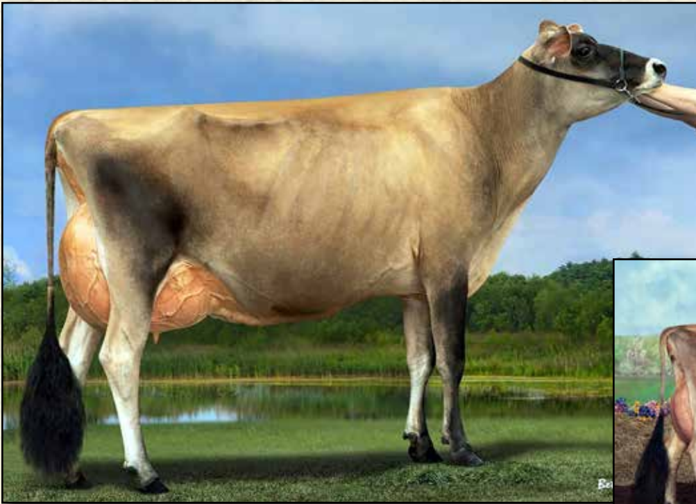
CROSSBROOK HG DIXIE-ET EX-94% DAM OF LOT 2