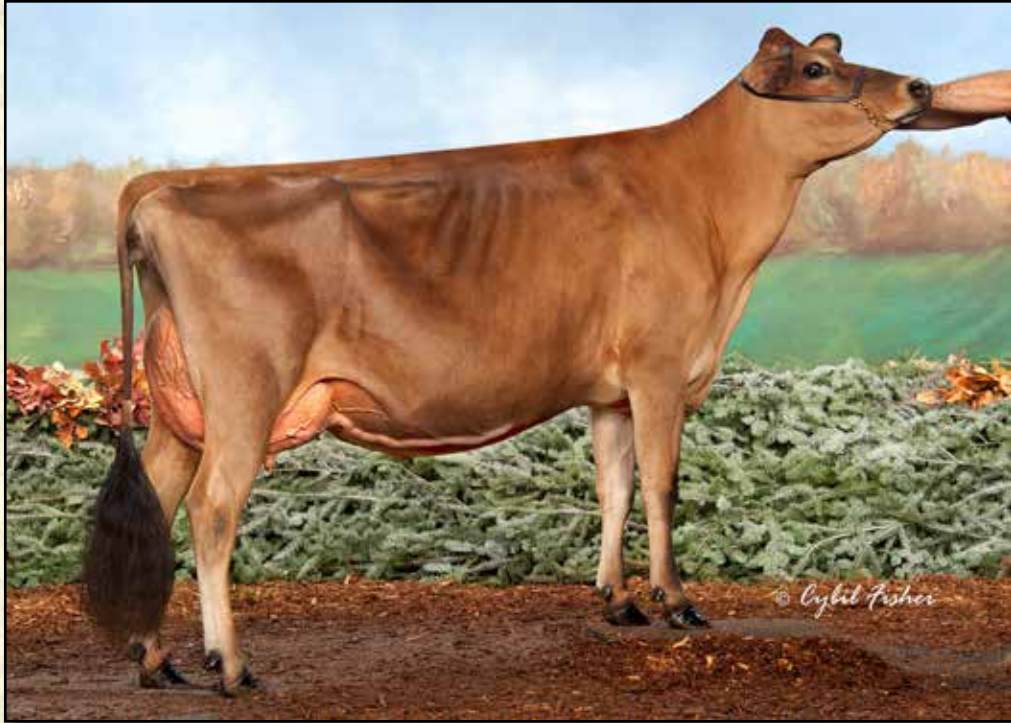
REJEBEL TEQUILA BISCUIT EX-92% DAM OF LOT 18

Nominated All-American Junior 2-Year-Old 2018