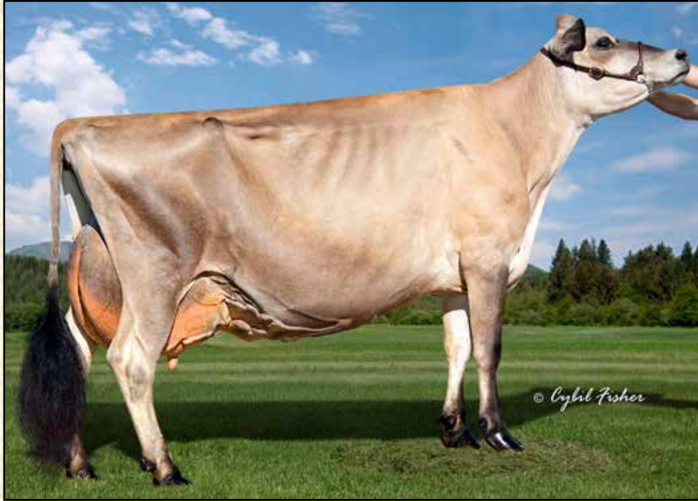
FLM BIG SHOW FENWAY EX-95% 2ND DAM OF LOT 34 1st Aged Cow, Western National 2015