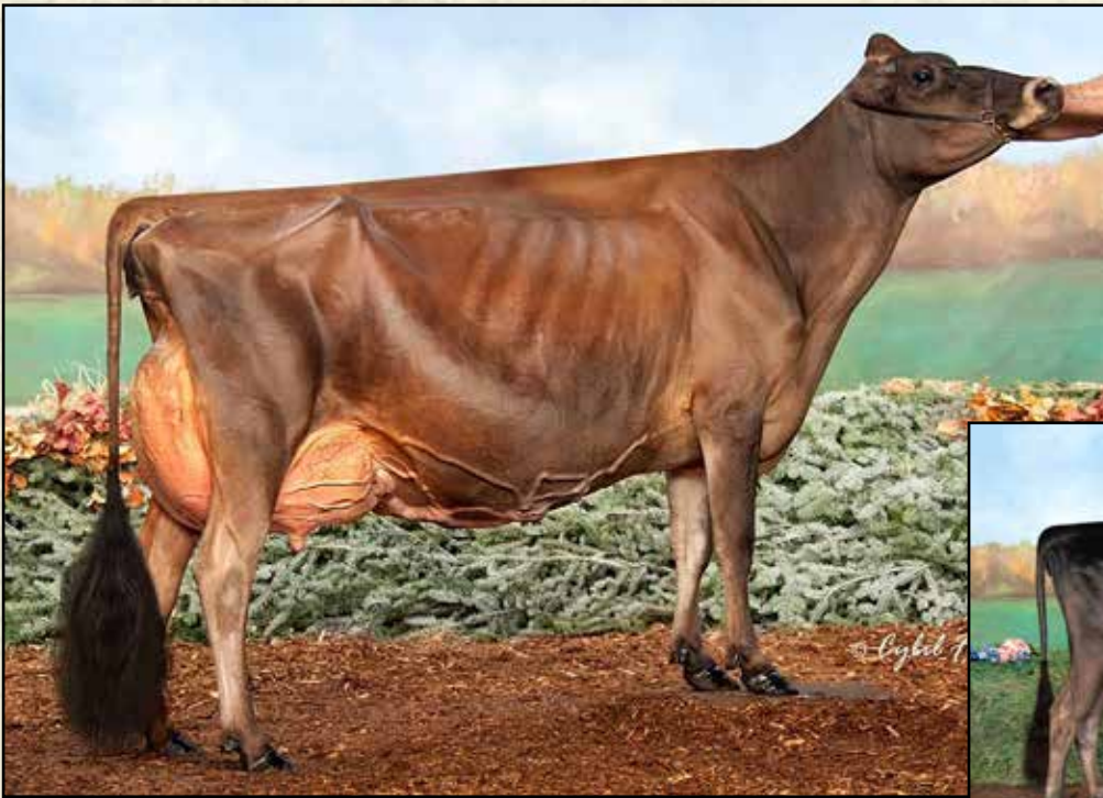
MB LUCKY LADY FELIZ NAVIDAD-ET EX-93% MATERNAL SISTER TO DAM OF LOT B Grand Champion, International Jersey Show 2018