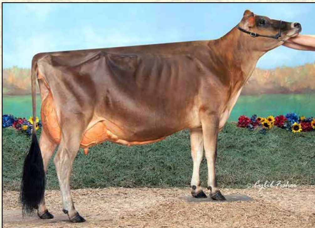
REICH-DALE VADEN STROLLIN EX-93% SAME FAMILY AS LOT 13

Reserve Grand Champion, All-American Show 2017