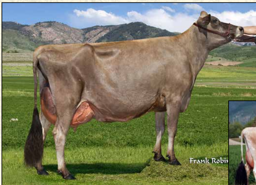
DC RENAISSANCE NORMA EX-94% SAME FAMILY AS LOT 5