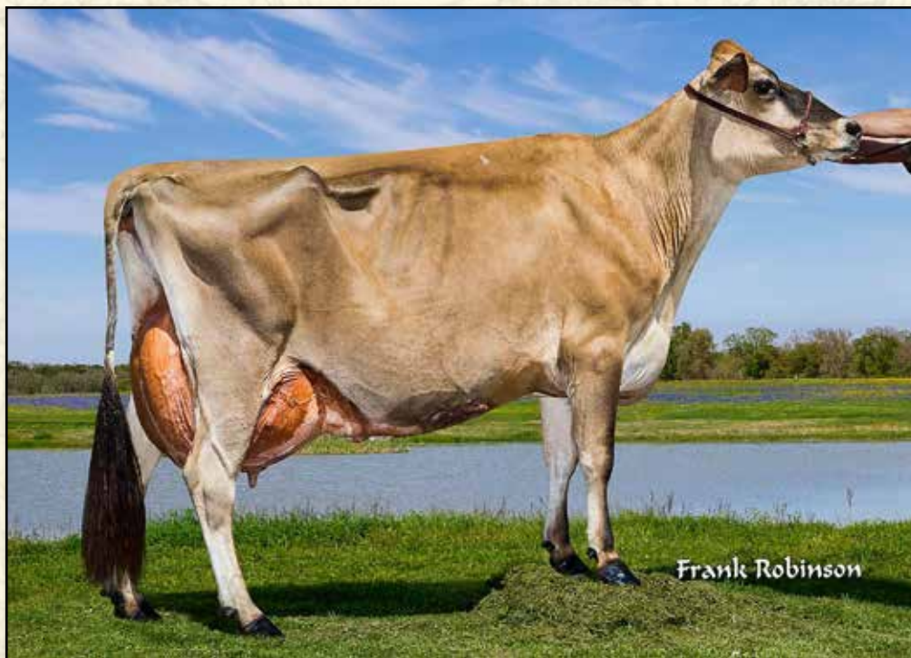
RANCHO VISTA SULTAN WINDY EX-93% 2ND DAM OF LOT 19