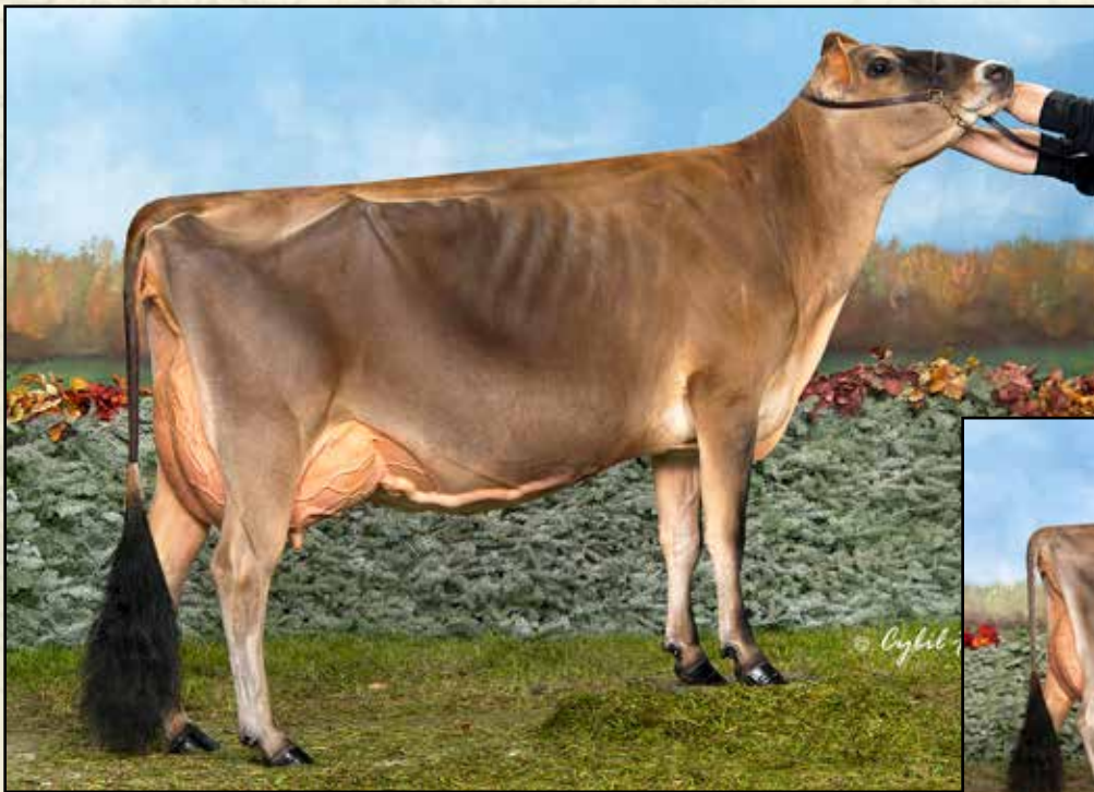
ELLIOTTS COSMO ACTION-ET EX-93% 2ND DAM OF LOT 14 All-American Senior 3-Year-Old 2014