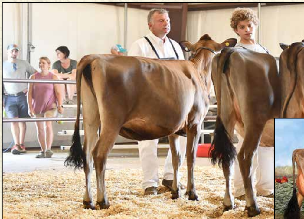
EHRHARDT NUANCE SWIRL SELLS AS LOT 25

Reserve Junior Champion, The Jersey Event 2020