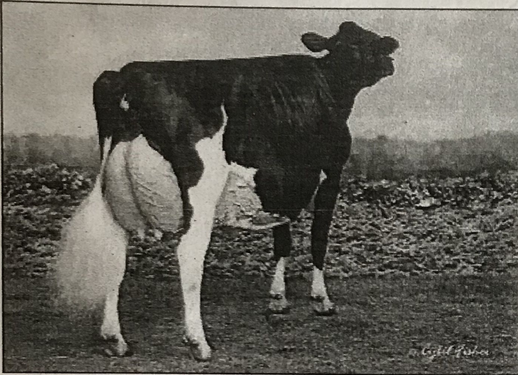
ROSIER BLEXY GOLDWYN-ET EX-97 EEEEE 3E DAM OF LOT 1C