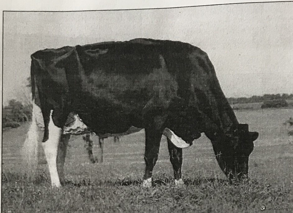
UNIQUE DEMPSEY CHEERS EX-95 96-MS DAM OF LOTS 5A & 5B