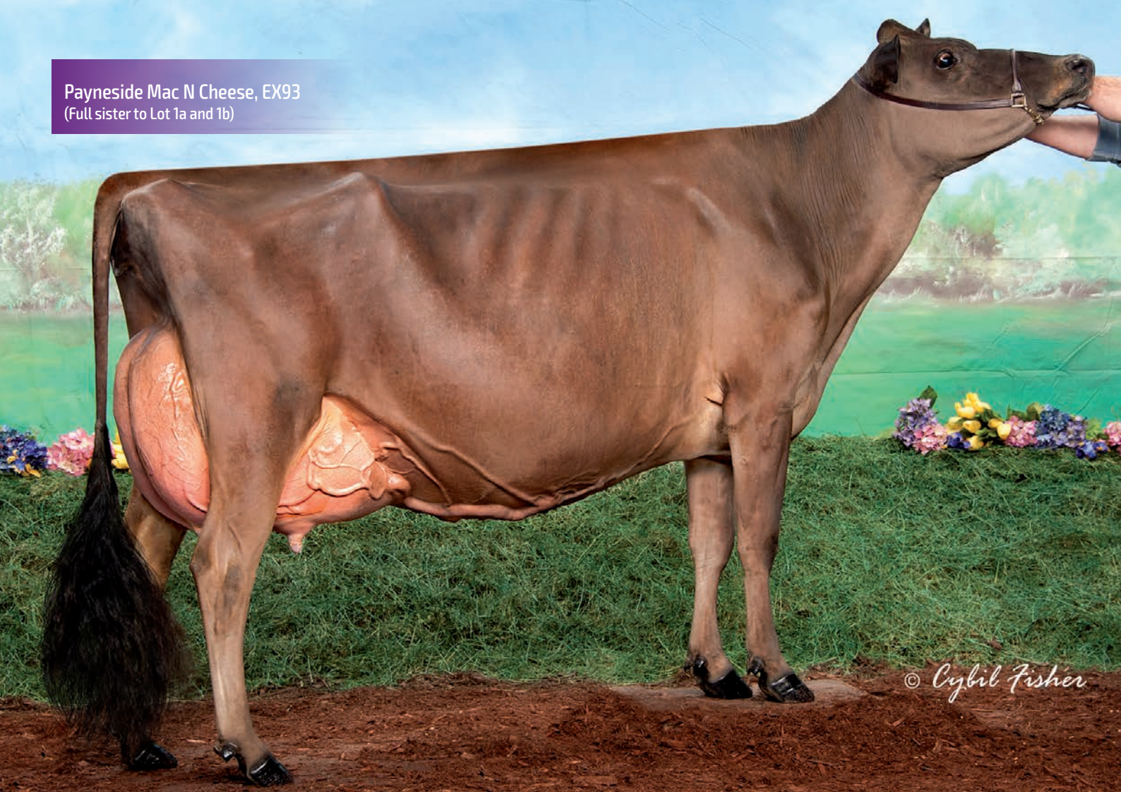
Payneside Mac N Cheese, EX93 (Full sister to Lot 1a and 1b)