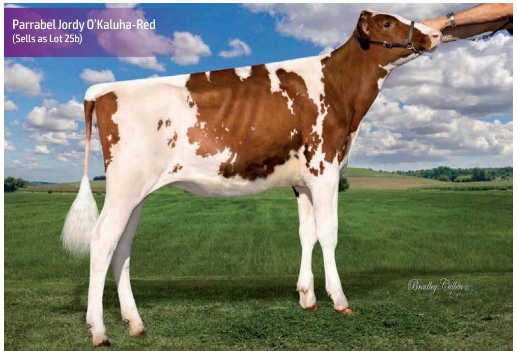
Parrabel Jordy O'Kaluha-Red (Sells as Lot 25b)