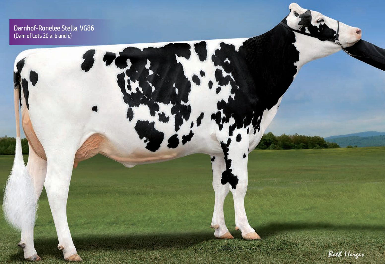
Darnhof-Ronelee Stella, VG86 (Dam of Lots 20 a, b and c)