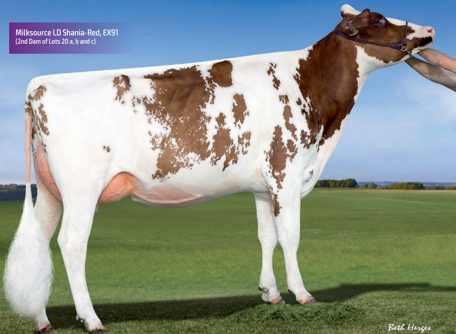
Milksource LD Shania-Red, EX91 (2nd Dam of Lots 20 a, b and c)