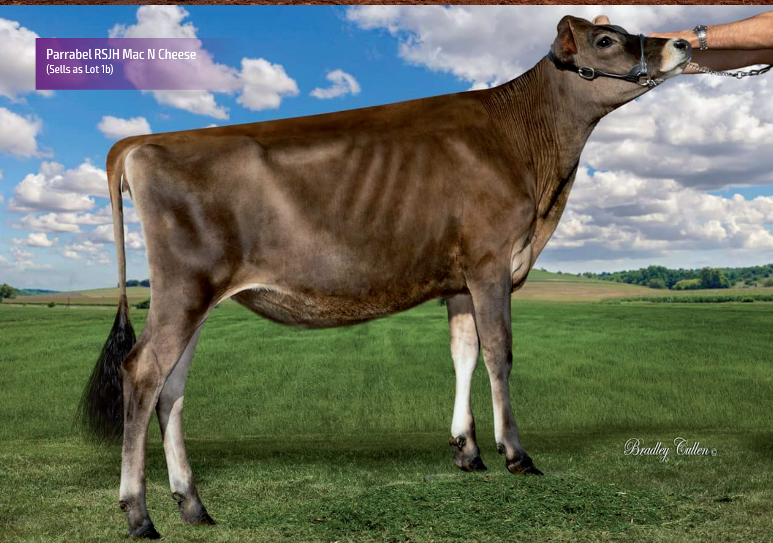
Parrabel RSJH Mac N Cheese (Sells as Lot 1b)