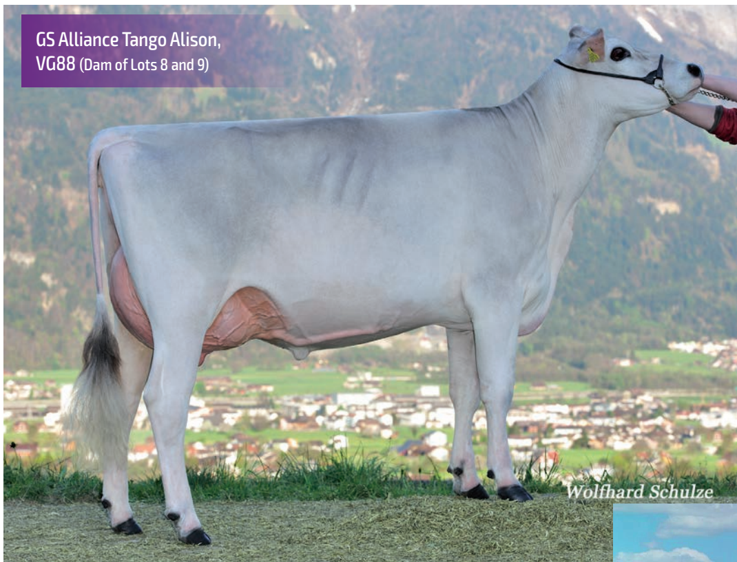
GS Alliance Tango Alison, VG88 (Dam of Lots 8 and 9)