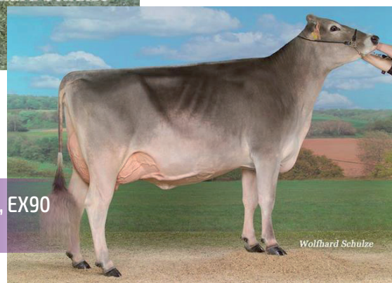
Steiner's Jolden Ashton, EX90 (2nd Dam of Lots 8 and 9)