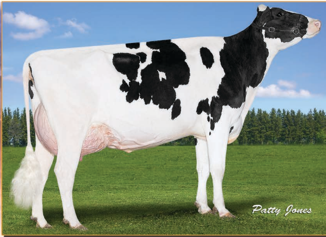
Sunny Maple Gold Chip Purple VG-87 2yr Sells as Lot 90 & Dam of Lot 91 & 92