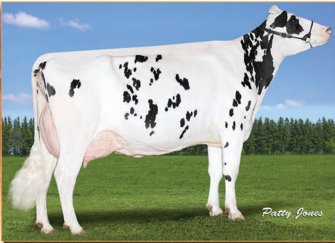
Sunny Maple Aftershock Tegan VG-85 2yr Sells as Lot 107 & Dam of Lot 108