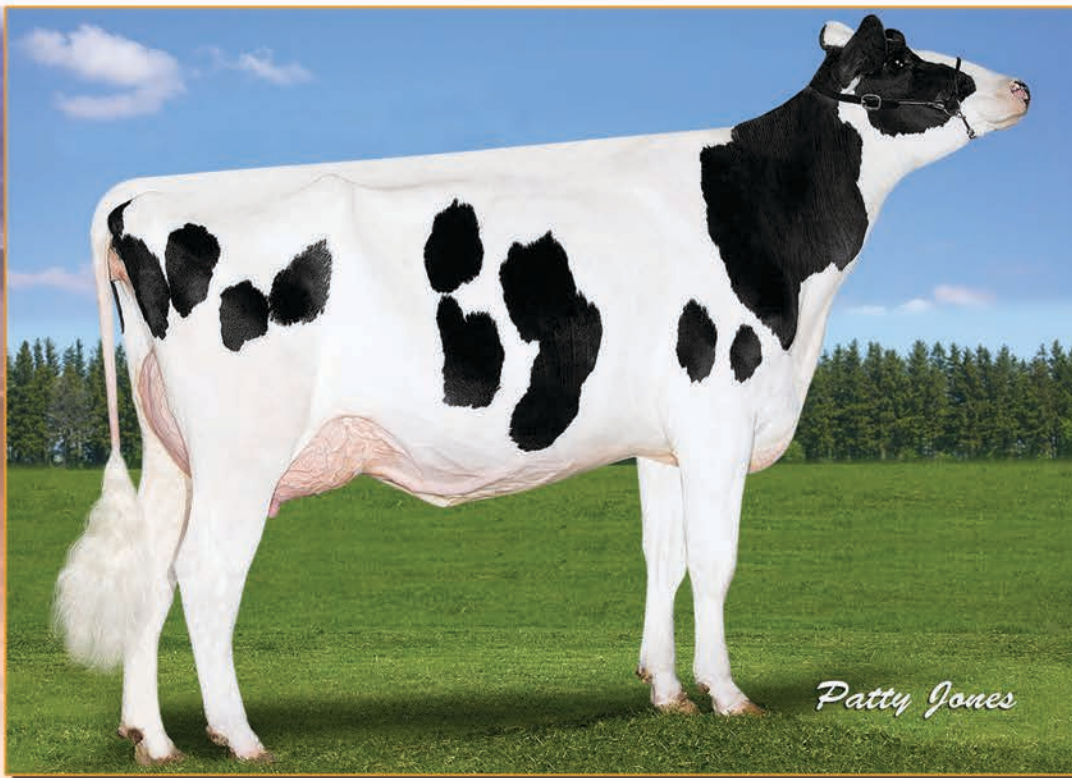
Sunny Maple Alpine Kiley VG-86 2yr Sells as Lot 71 & Daughter of Lot 64