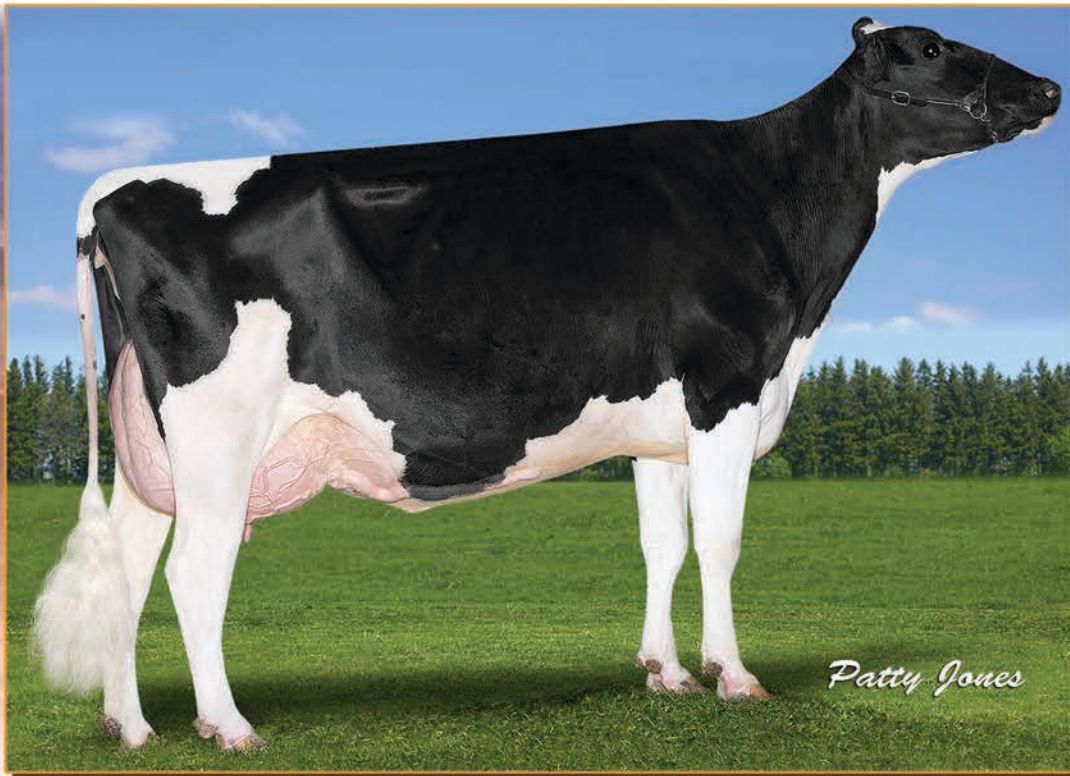
Sunny Maple Sid Killy EX-92 Sells as Lot 64 & Dam of Lot 65, 71 & 72