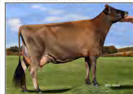
Stoney Point Verbatim Molly, EX-92