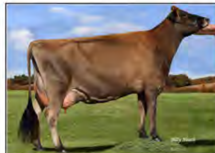
MATERNAL SISTER TO DAM ... Stoney Point Verbatim Molly, EX-92