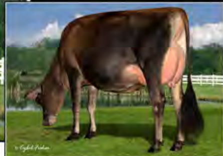
MATERNAL SISTERS TO CONSIGNMENT ...