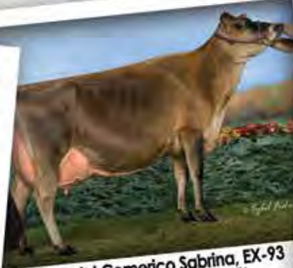
Stoney Point Comerico Sabrina, EX-93 4-08 365 26119 4.9% 1269 3.7% 971 2 ND 5-YEAR-OLD, 2010 WDE Sold to Page-Crest Jerseys, Missouri