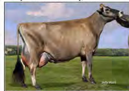
Stoney Point Action Misty, EX-90