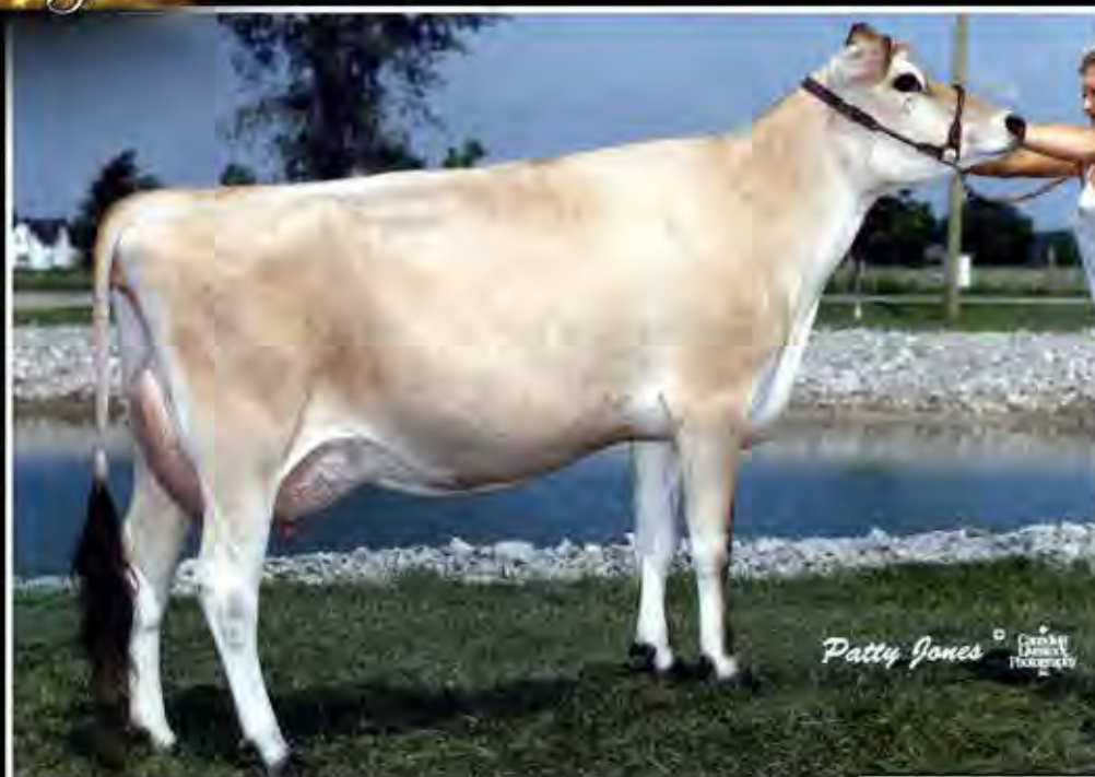
Patty Jones © Cattleman's Photography