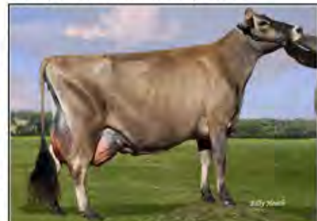
Stoney Point Action Misty, EX-90