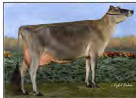
3RD DAM ...