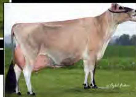
3RD DAM ...