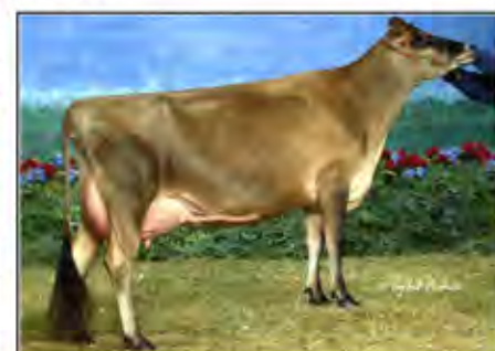
3RD DAM ...

Juliannas Deluxe Justine ET EX-93 • 1st Junior 2-Year-Old, 2003 WDE