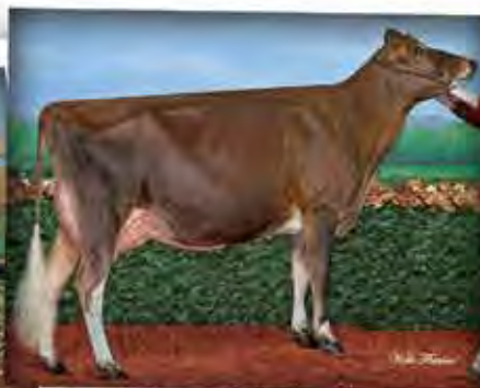
Stoney Point Tequila Brew 2 ND JR 2-YR-OLD, 2014 PA ALL-AMERICAN 7 TH JR 2-YR-OLD, 2014 RAWF Sold to Bellfontaine Genetics, Quebec