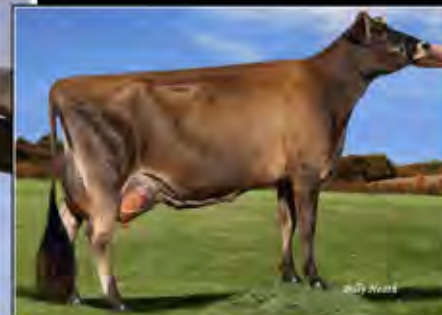
DAM OF EMBRYO LOT 56 IS CARRYING ... Stoney Point Voltage Blast, EX-90