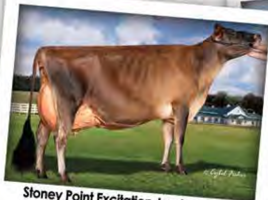
Stoney Point Excitation Jamie, EX-96 6-07 305 23160 4.4% 1025 3.5% 800 2013 NATIONAL GRAND CHAMPION, ALL AMERICAN Sold to River Valley, Illinois