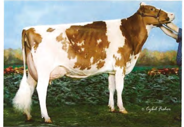
RIDGEDALE-T RAICHU-RED EX 96 2015 1ST 150,000 LB Cow - WDE LIFETIME 171400M 3.9% 6727F 3.1% 5337P 2 ND DAM OF LOT #61