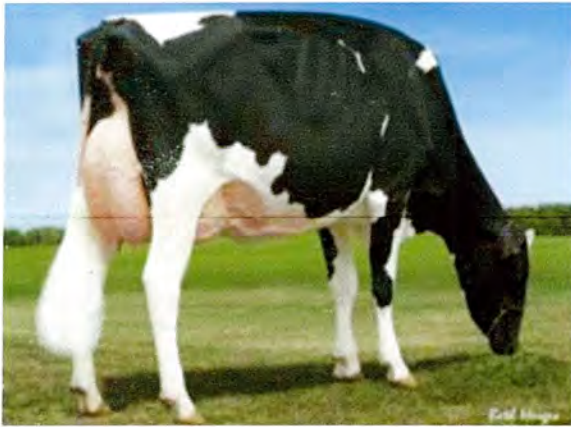
EAST RIVER GOLD DEB 850 EX 95 2011 RESERVE ALL-AMERICAN & RES ALL- CANADIAN MILKING YEARLING 2 ND DAM OF LOT #42