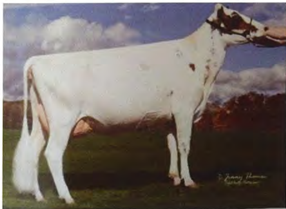
WILSHORE MAGIC LIN VG 88 3-04 361D 11620M 4.4% 508F 3.2% 372P DAM OF LOT #1