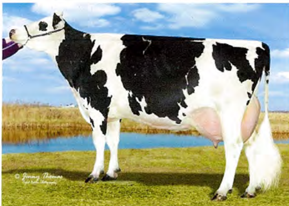
CEDAR-RAIL BMWL HOORAY EX 94 2012 HM JR ALL-NEW ENGLAND SR 3 Y/O DAM OF LOT #51