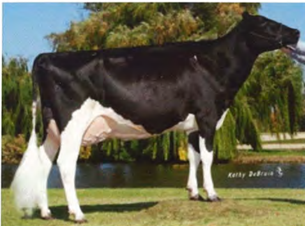
OCD TEQUILA SOUR-ET EX92/EX94-MS 2011 UNANIMOUS ALL-NY SR 3 Y/O MATERNAL SISTER TO DAM OF LOT #63