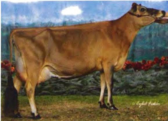
MILO CENTURION SADIE EX 93 1ST AGED COW - 2012 VT STATE SHOW; GRAND CHAMPION - 2010 FRYEBURG FAIR FULL SISTER: EX93 SASSAFRASS 3 RD DAM OF LOT #23