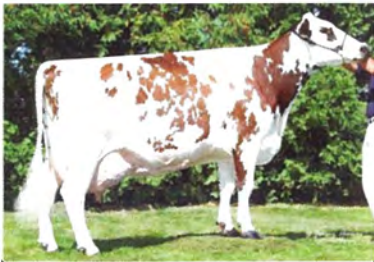
Toll-Gate Olympic 2 Sapphire 5E 93 Numerous Times All American 3 rd Dam Lot #4