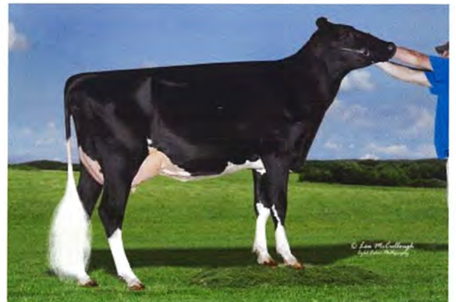
CARPSVIEW DESTRY EXQUISITE VG 88 2013 HHM ALL-NY JR 2 Y/O, 2012 RES ALL-NY SUMMER YEARLING 2 ND DAM OF LOT #64