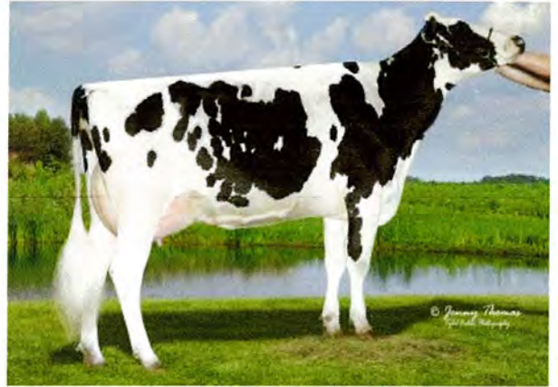
WHITTIER-FARMS M AMORE-ET EX 92 FULL SISTER TO DAM OF LOT #44