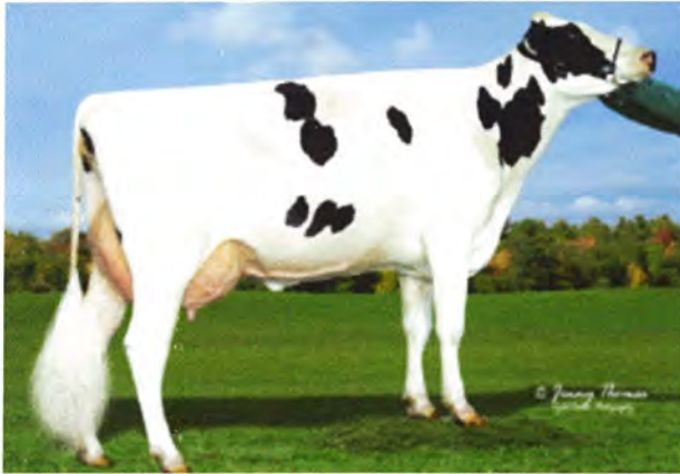
WATCH-HILL SANCHEZ EMMA VG 87 2015 3 RD PINELAND FUTURITY DAM OF LOT #60