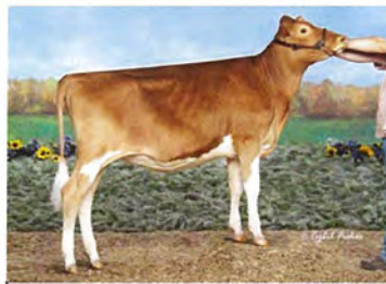
Peaceful Valley Icy Maple Sold in 2015 Sale 2015-2 nd AADS & 1 st Big E Family Member Sells Lot #7