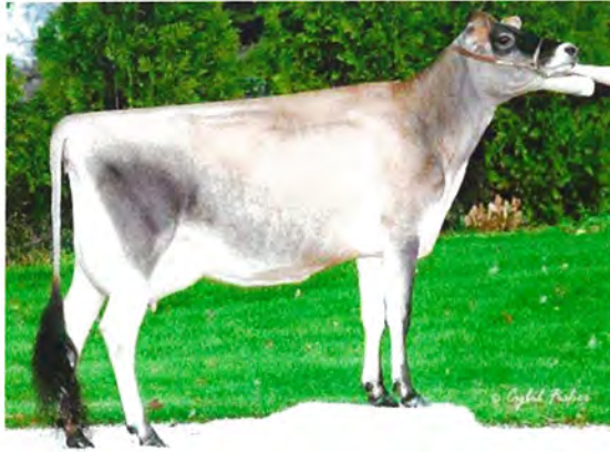
JUSTINES CENTURION JINELLE-ET EX 91 2007 NOM ALL-AMERICAN MILKING YEARLING 1ST MILKING YEARLING & BU & PA AADS FULL SISTER: EX90 JANINE 3RD DAM TO LOT #24