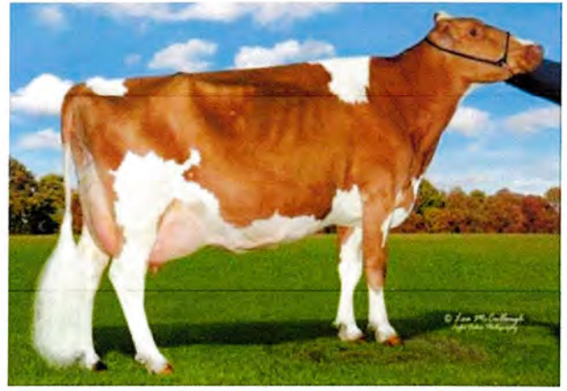
ARETHUSA MAZDA MIATA-RED, 2E 92 5-06 305D 31040M 3.7% 1 145F 3.2% 998P DAM OF LOT #39