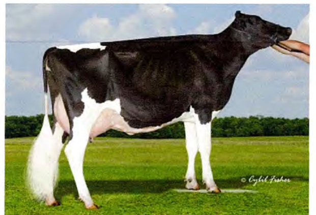
R-KEY-VALE AFTRSHOCK JALENE, EX 90 3-09 209D 1 1410M 4.8% 544F 2.7% 308P 2 ND DAM OF LOT #56