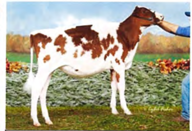
MS DB Rockstar-ET 2016-Nom. AA & Jr. AA R&W HM Jr AA Spring Calf Full Sister Sells Lot #40