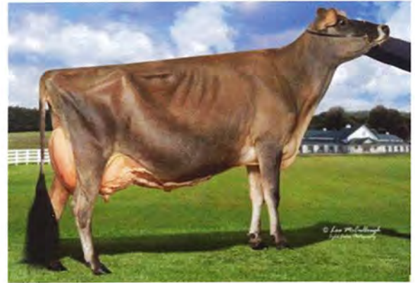
COWBELL GUAPO RICOCHET, EX 94 2015 RES ALL-AMERICAN AGED COW & NATIONAL GRAND CHAMPION (JR SHOW) 2013 UNANIMOUS ABA ALL-AMERICAN 4 Y/O MATERNAL SISTER TO DAM OF LOT #19