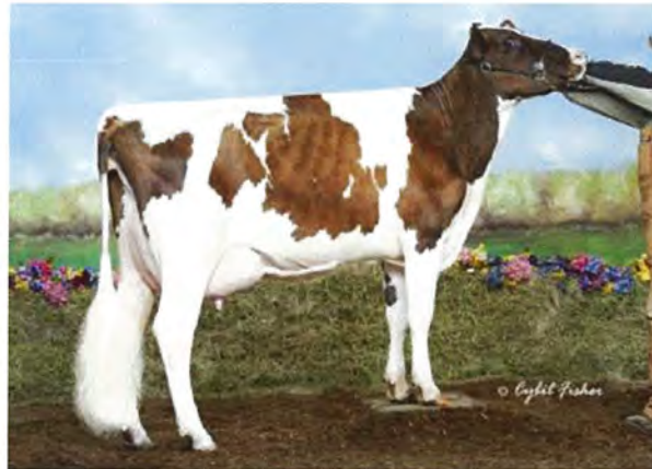
UPS & DOWNS H ABIGAIL VG 85 2-03 373D 19522M 3.7% 714F 3.4% 667P 2 ND DAM OF LOT #2