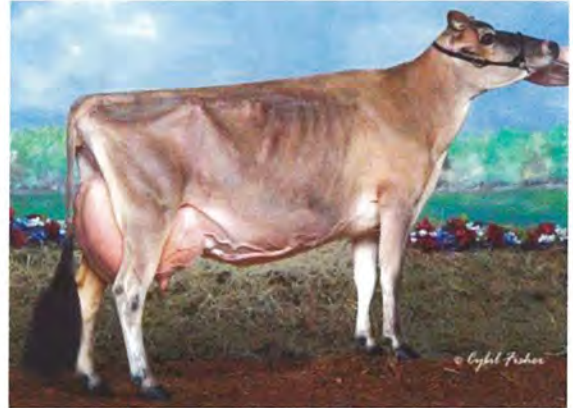
DUTCH HOLLOW MAX DAGMAR EX 93 7-10 290D 16000M 5.3% 850F 3.8% 610P 2ND DAM TO LOT #25