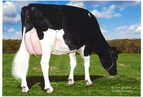
HOWACRES GOLDWYN ALABAMA-ET VG88 EX MS 2016 GRAND CHAMPION & 1ST SR 3 Y/O NORTHEAST KINGDOM HOLSTEIN SHOW DAM OF LOT #59