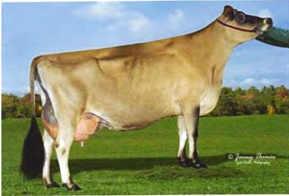
CHESTNUT-HYLL LINDSEY EX 93 1ST AGED COW, SR & GRAND CHAMP - 2016 EASTERN STATES JR JERSEY SHOW DAM OF EMBRYOS LOT #15