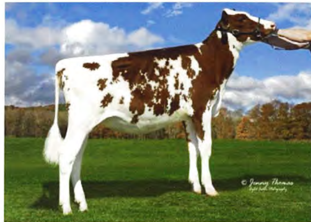
TOLL-GATE FRANCIS SAMANTHA 1ST CALF 2 Y/O DAM OF LOT #4