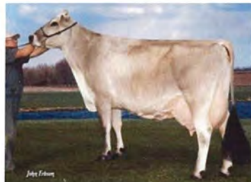
Towpath Intel Legend 2E 93 2007 & 08 -1st 100,000 lb Cow NYSF 3 rd Dam Lot #12