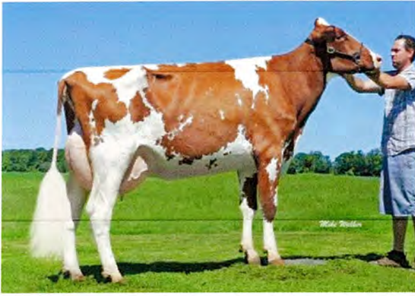
Ms WOODCREST D SAMMY-RED-ET, EX 90 3-02 319D 28070M 4.3% 1 196F 3.0% 853P DAM OF LOT #35