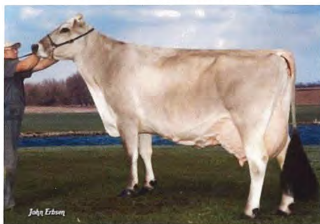
TOWPATH INTEL LEGEND 2E 93 1ST 4 Y/O & RES GRAND CHAMP - 2005 NY STATE FAIR 3 RD DAM OF LOT #7