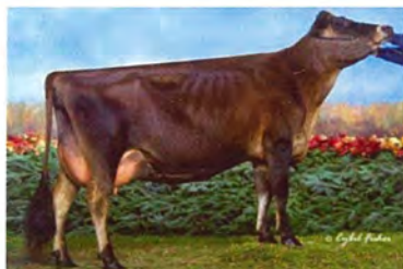
Tierneys Jade Leta (6) EX 91 2009 Res. Grand Champion Big E & VT State Show Family Members Sell Lot #15, #20, #21