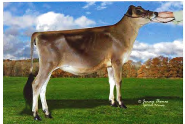
TOPLINE BBS FLIRT 1ST SPRING CALF & RES JR CHAMP - 2014 EASTERN STATES EXPO SOLD IN 2014 MA BLUE RIBBON SALE MATERNAL SISTER TO DAM OF LOT #22