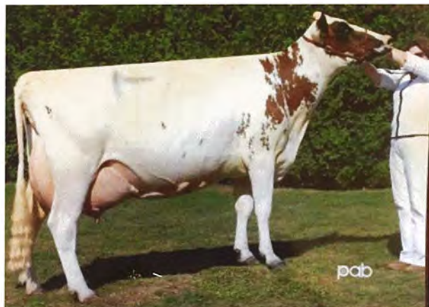
LEGACY-LANE SPRINGHOPE BLISS-ET 3E 93 2006: NOM ALL-AMERICAN 4 Y/O, 1ST 4 Y/O, SR & GRAND CHAMP EASTERN STATES NATL 3 RD DAM OF LOT #3