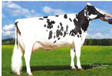
RG-JK Shottle Marvel ET 2E 95 Brazzle Granddaughter Sells. Backed by 5 EX Dams Granddaughter Sells Lot #49