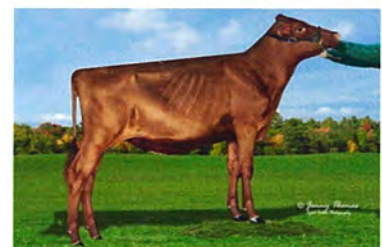
Ridale-D-Lad Sesarean Sold in 2016 Sale 2016 Nom. AA & Jr. AA Winter Calf. HM. Jr. AA