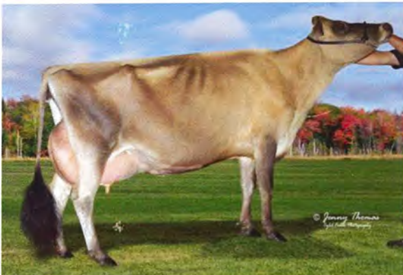
TIERNEYS JUDE LAELA (6) EX 91 5-04 287D 16410M 5.2% 850F 4.0% 661P 2 ND DAM TO LOT #20