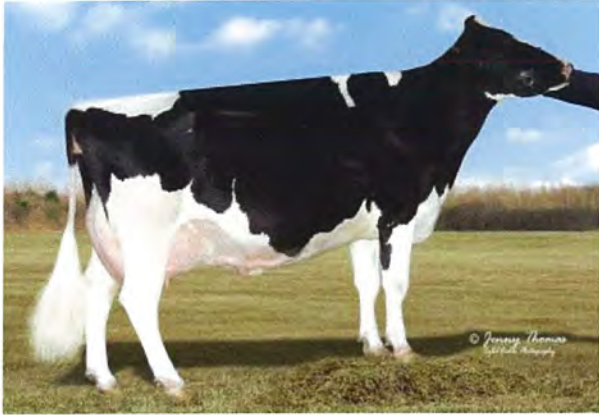
ELM-SPRING ENCORE SUNLIGHT 3E 93 DAM OF LOT #58