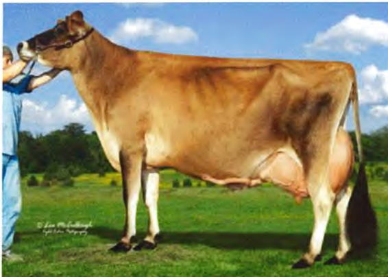
EDAN GOVERNOR SHIMMIE (6) EX91 4-02 284D 21280M 4.7% 1009F 3.4% 714P 2ND SPRING YEARLING - 2012 NY STATE FAIR DAM TO LOT #26