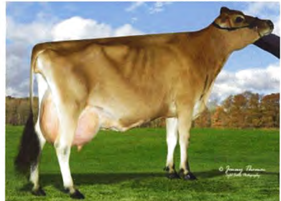
SEMI-CHARMED PLUS SORBET (6) EX 91 2-11 305D 21920M 4.5% 976F 3.3% 717P DAM TO LOT #27