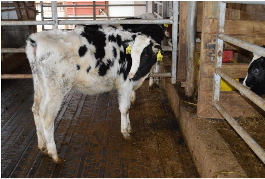
Location: Maryland, USA