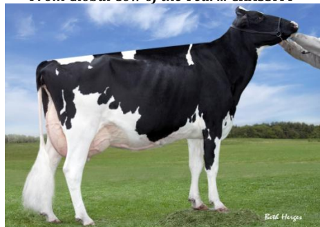
Regancrest S Chassity EX-92 DOM

Global Cow of the Year 2011 Sold for $1,500,000 as a package in 2009 Internal Intrigue