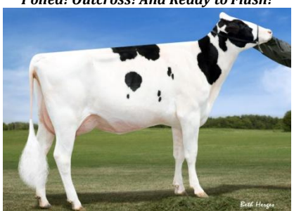
Butlerview Colt Pixie VG-87-2YR-USA *BY GTPI+2094

One of the Highest Milking Polled Heifers in the WORLD!! Pixie's Uno September '13 Heifer Sells as Lot 12 along with her Flame Sister (Lot 14)