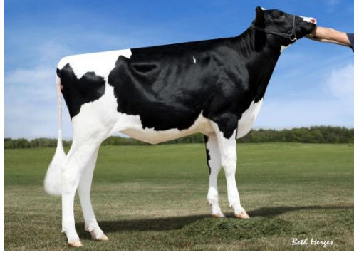
MS Aderyn Determine 2489 GTPI +2414 MILK+774 DPR+1.2 PL+5.7 PTAT+2.50 UDC+2.34

Sells as Lot 7, along with her full sister MS Aderyn Determine 2488 (Selling as Lot 6)