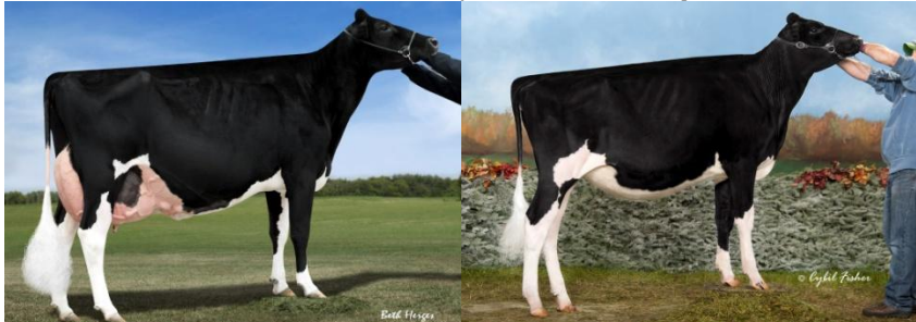
Lot 26-A Beautiful March Heifer with extreme potential, backed by a great cow family!!

From An All- American/ All- Canadian Lineup