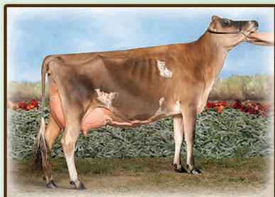
South Mountain R Master Jamaica, E-94%