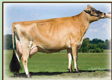
Milo Vindication Star-ET, E-92%

Selling a first choice of 15 implants due in December 2017. The next three dams are Excellent. Juniper Farms Inc., ME