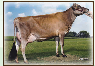
Covington Metalica Diva-ET +5.5PL GJUI +24.3 GJPI +155 Her second calf full sister sells fresh March 1 and ranks on the Top 1.5% GJPI cow list along with her four sisters. Covington Jerseys, IA