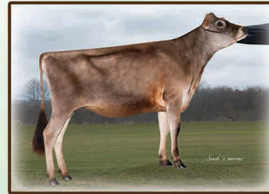
All-Lynns Nitro Nala-ET GJPI +189