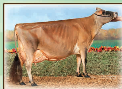
Peninsula Kaught Mallory, E-95%

Offering a first choice of seven (7) full sisters due in March 2017. Their dam is an E-95% STYLE MASTER. Myron Arthur, IA