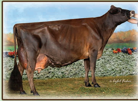
Ratliff Minister Porscha-ET, E-95% 5-5 293 26,690 5.6% 1,500 3.8% 1,017 Reserve Intermediate Champion, 2012 All American A super fancy SHOWDOWN spring yearling granddaughter sells. The dam is an EXCITATION. Ratliff Jerseys, KS