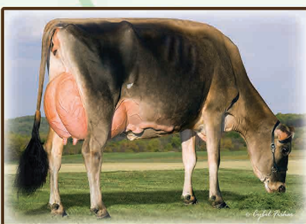
Hillacres Morrae Maryland, E-95%