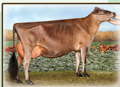
Edgebrook Tequila Madison-ET, E-91%

Consignments from 15 states and Ontario will be ready to stand your inspection!