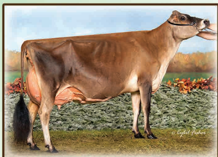
Discovery's Tequila Jewelene, E-94%