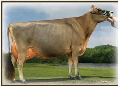
Budjon-Vail Jade Gianna-ET, E-92% 6-1 305 25,590 5.3% 1,364 3.4% 874 Her clean cut, super fancy GENTRY spring sells. The next dam is two-time National Grand Champion, "Griffen," E-95%. Woodmohr Jerseys, WI