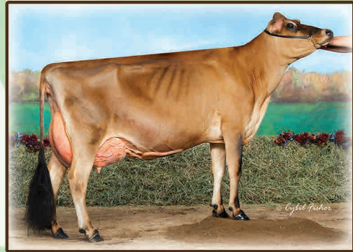
Genesis Velocity Jitter, E-91% (max. score 2 nd lact.) Grand Champion, 2016 Midwest Jersey Jamboree This 4-year-old is due March 1 and will be ready for spring shows! Stadview Jerseys, MN