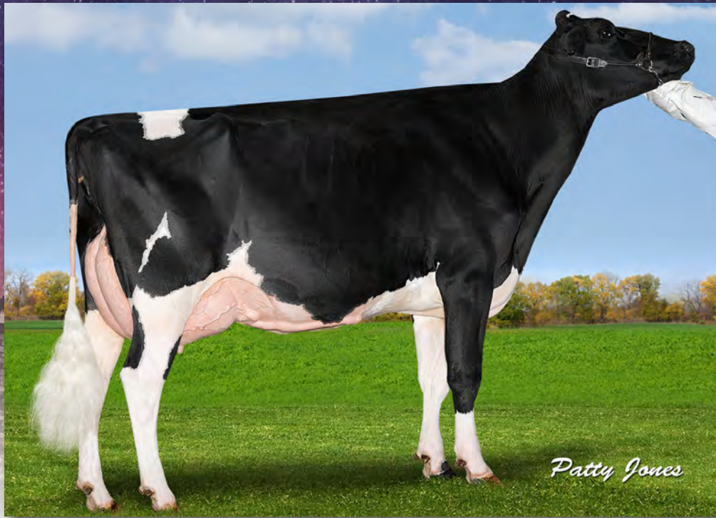
Grillsdale Sexy Sid EX NOM. ALL-ONTARIO JR. 3 YR. OLD '15 HM GRAND CHAMPION NORTHUMBERLAND '15 Dam of Lot 52