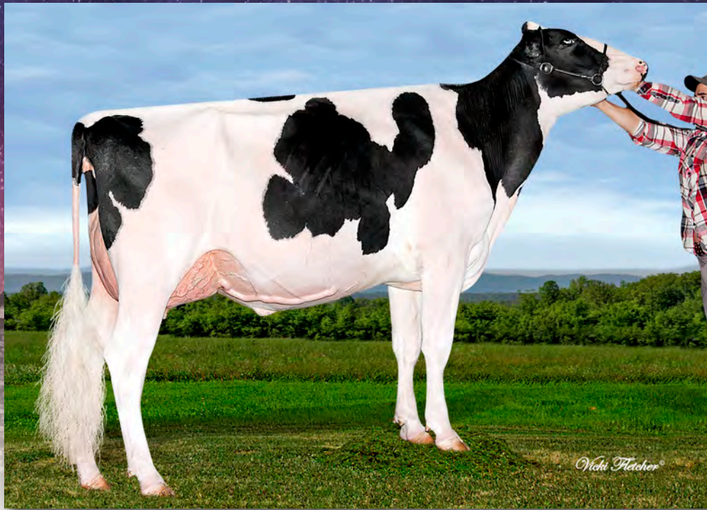
Willswikk Sid Bombshell EX-92 2ND SR. 3 YR. OLD ON SUMMER SHOW '16 2ND SR. 2 YR. OLD ON SUMMER SHOW '15 Dam of Lot 51