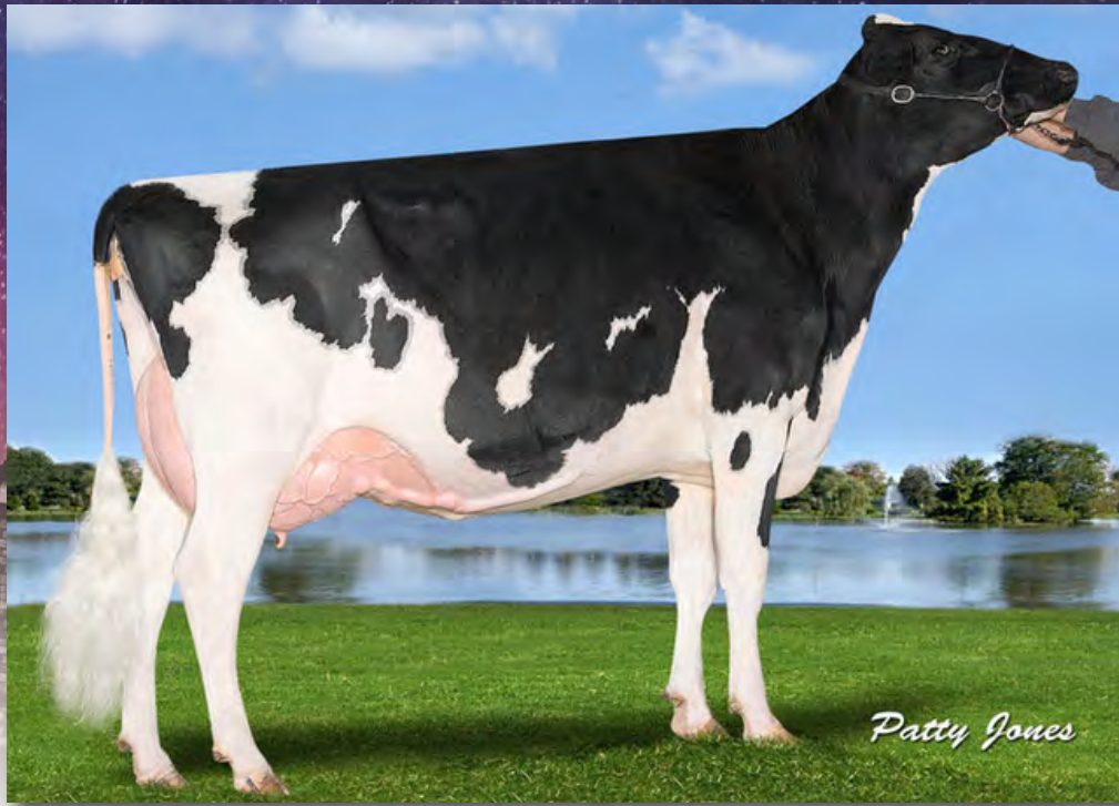
Kingsway Doorman Ace VG-88 2yr. NOM. ALL-ONTARIO MILKING YEARLING '16 RES. ALL-CANADIAN 4-H SR. CALF '15 Full Sister to Lot 20