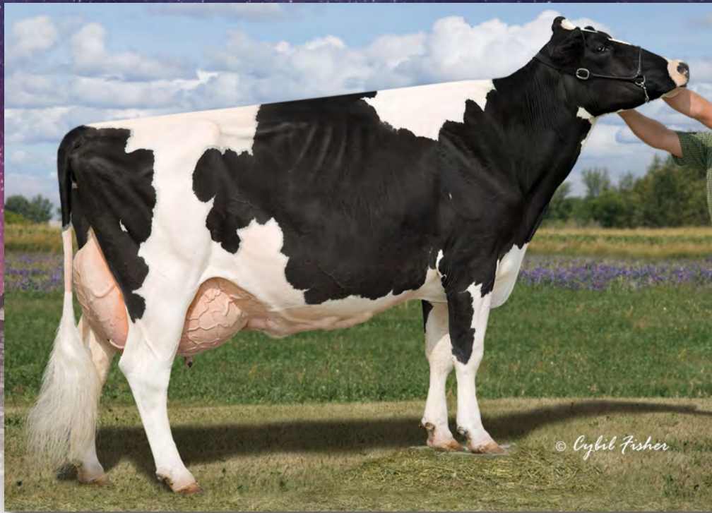
Penlow Georgette Outside EX-96 2E 12* INT. CHAMPION & HM GRAND CHAMPION RAWF '04 2X ALL-CANADIAN 3X RES. ALL-CANADIAN 2nd Dam of Lot 57