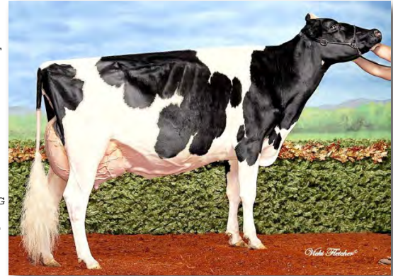
EX-90-2E-USA GMD 2*(5/5)

HOCANF9979603 B&W *BYF ET B:16 Aug 2009 VG-89-4YR-CAN 10*(0/50) 02-01 305 10998 478 4.3 355 3.2 365 12468 543 4.4 411 3.3 BCA 276 321 277 2 LACT: 32926 1509 4.6 1122 3.4 KG