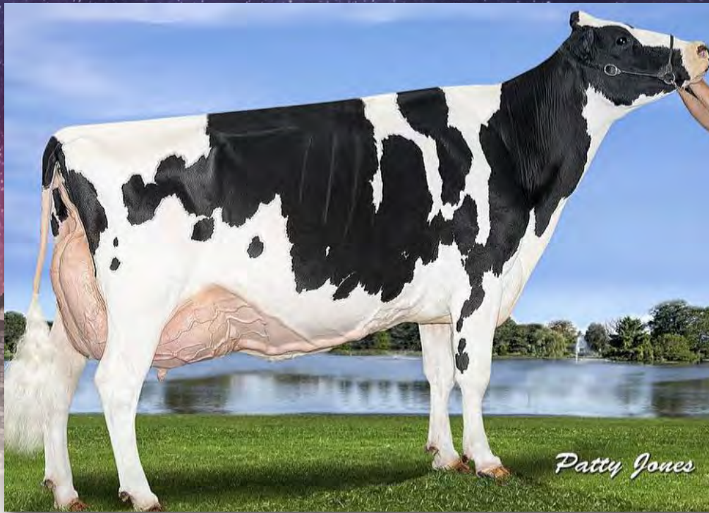
Nipponia R D Lizbeth EX-96 3E 1* HM ALL-CANADIAN LONGTIME PRODUCTION '16 HM ALL-ONTARIO MATURE COW '16 Dam of Lot 11-17