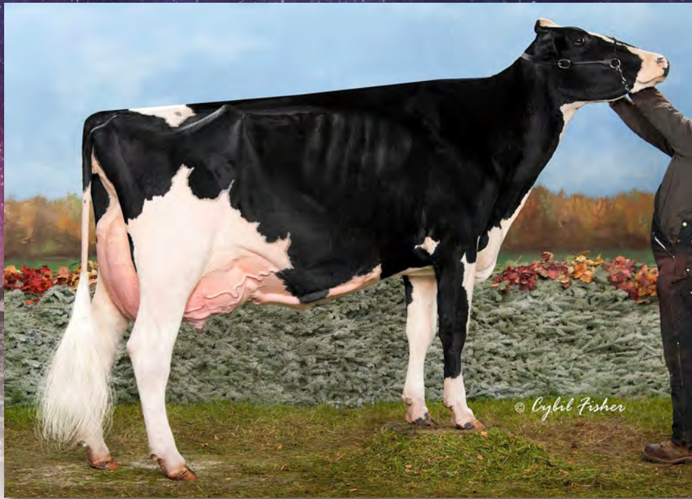
Kingsway Goldwyn Artichoke EX-94 ALL-CANADIAN SR. YEARLING '12 1ST FALL YEARLING WDE '12 Dam of Lot 35-39