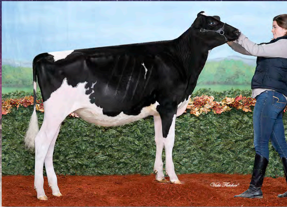
Glennholme Mario Merciless RES. ALL-CANADIAN JR. CALF '17 RES. ALL-ONTARIO JR. CALF '17 Sells as Lot 1