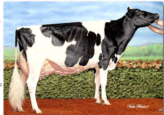
EX-92-4YR-USA GMD DOM 10*(0/50)

HOCANF9979603 B&W *BYF ET B:16 Aug 2009 VG-89-4YR-CAN 10*(0/50) 02-01 305 10998 478 4.3 355 3.2 365 12468 543 4.4 411 3.3 BCA 276 321 277 2 LACT: 32926 1509 4.6 1122 3.4 KG