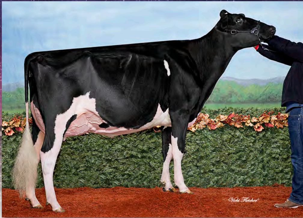
Knonaudale Orangecrush VG-87 2yr NOM. ALL-CANADIAN JR. 3 YR. OLD '17 NOM. ALL-AMERICAN JR. 3 YR. OLD '17 Dam of Lot 5 & 6