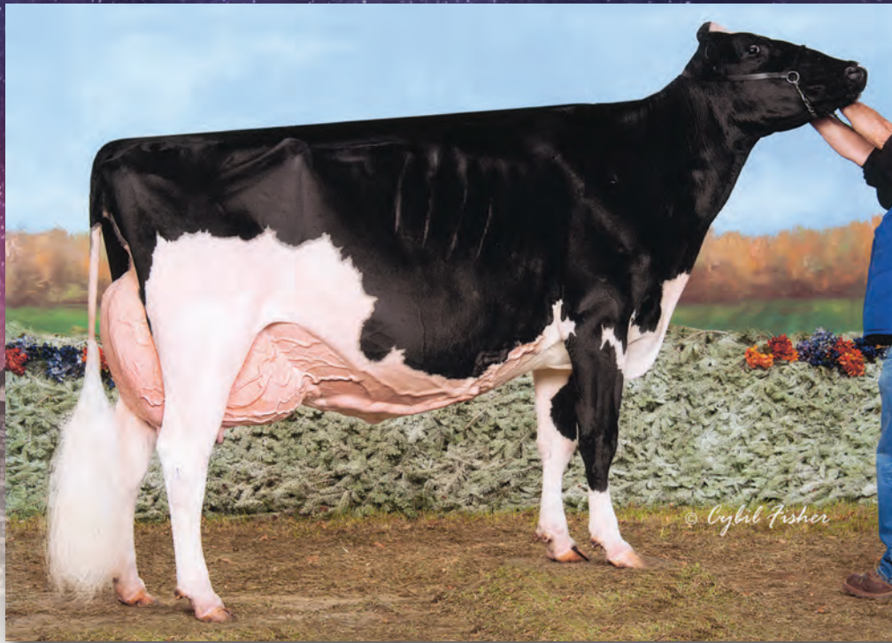
Kingsway Goldwyn Abba Dabba EX-94 1* NOM. ALL-CANADIAN 5 YR. OLD '15 RES. ALL-ONTARIO 5 YR. OLD '15 2nd Dam of lot 30-34