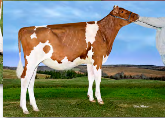
Milksource Takota-Red Sells as Lot 48