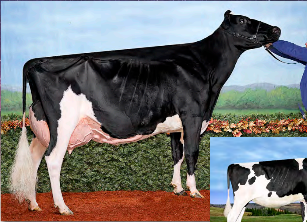
Knonaudale Jasmine EX-96 4E 3* RES. ALL-CANADIAN LONGTIME PRODUCTION '17 GRAND CHAMPION AUTUMN OPPORTUNITY '17 Dam of Lot 2 & 3 & 2nd Dam of Lot 4