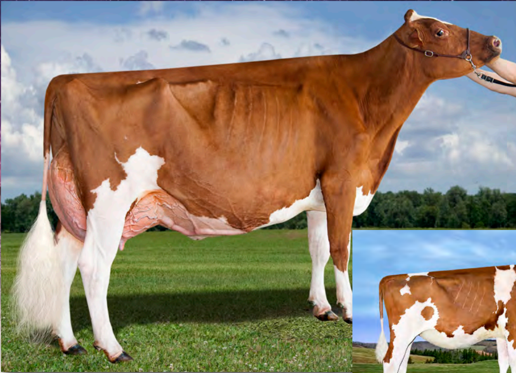
Strans-Jen-D Tequila-Red EX-96 2E GRAND CHAMPION R&W WDE '15 RES. ALL-AMERICAN R&W 5 YR. OLD '16 Dam of Lot 48