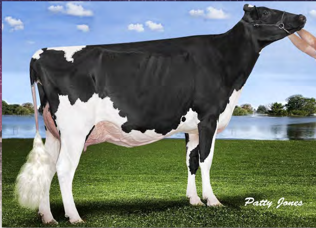
Idee Goldwyn Livia VG-87 2yr 2* RES. ALL-CANADIAN SR. YEARLING '13 ALL-ONTARIO SR. YEARLING '13 2nd Dam of Lot 41