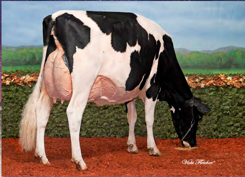
Kingsway Sanchez Arangatang EX-95 2E 2* NOM. ALL-CANADIAN MATURE COW '16 HM ALL-CANADIAN 4 YR. OLD '14 Dam of Lot 21