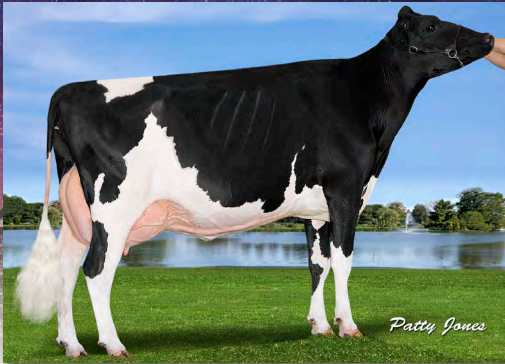
Kingsway Windhammer Alga EX-93 1ST MILKING YEARLING AUTUMN OPPORTUNITY '14 Dam of Lot 55