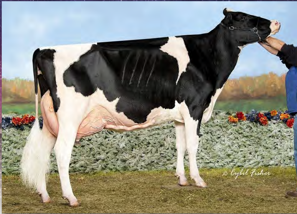
Kingsway Goldwyn Dallas EX RES. ALL-ONTARIO SR. 3 YR. OLD '15 HM INT. CHAMPION ON SUMMER SHOW '14 & '15 NOM. ALL-CANADIAN INT. YEARLING '13 2nd Dam of Lot 56