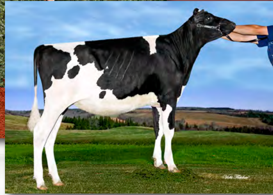
Kingsway Cinderdoor J Rock Sells as Lot 2