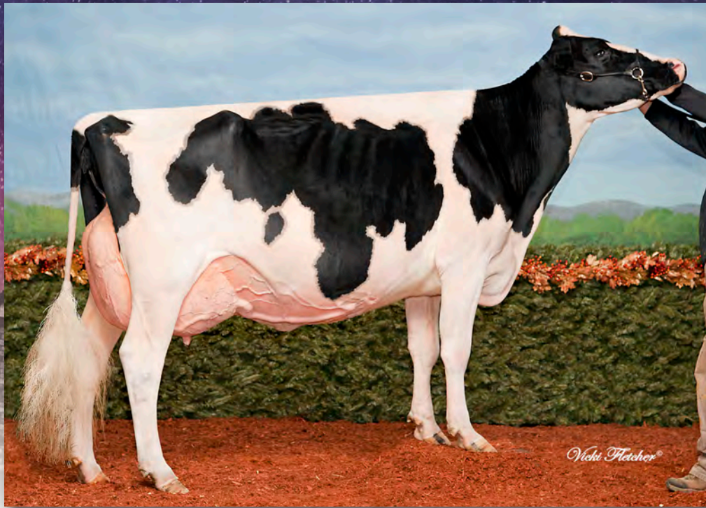
Crsdale Dundee Liza VG-89 3* NOM. ALL-QUEBEC 4 YR. OLD '11 ALL-QUEBEC JR. 2 YR. OLD '09 3rd Dam of Lot 47