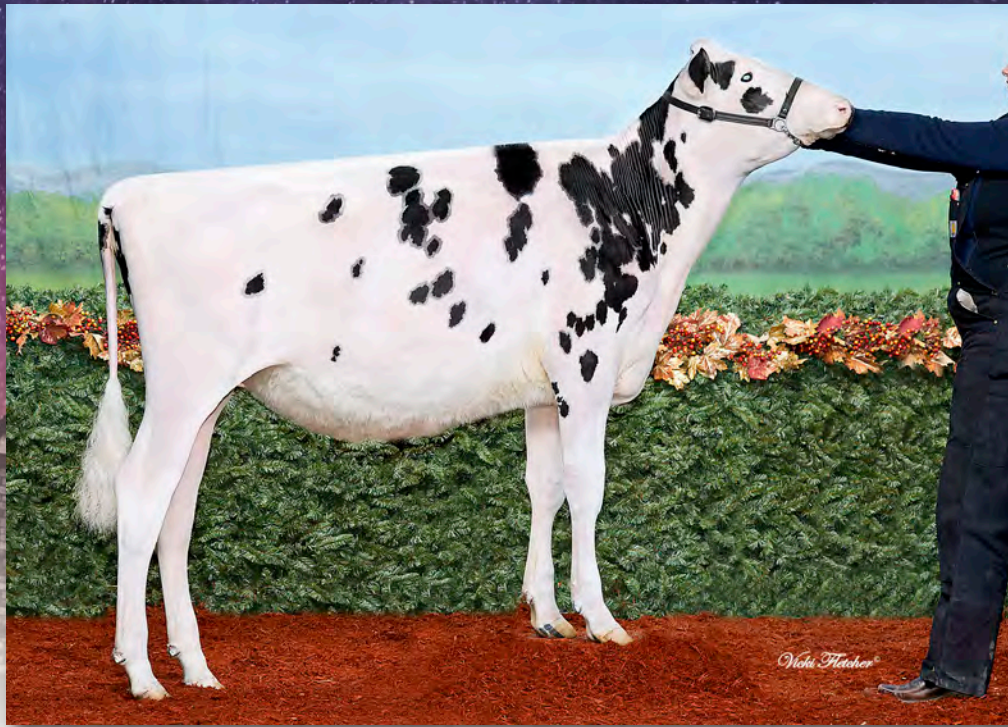
JPB Lucky I M White 3RD JR. CALF AUTUMN OPPORTUNITY '17 Sells as Lot 43