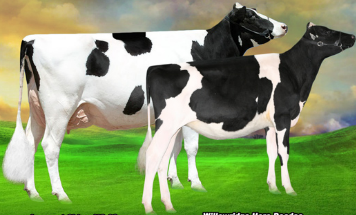
Larcrest Chima VG 88 2 nd Dam of Lot 14