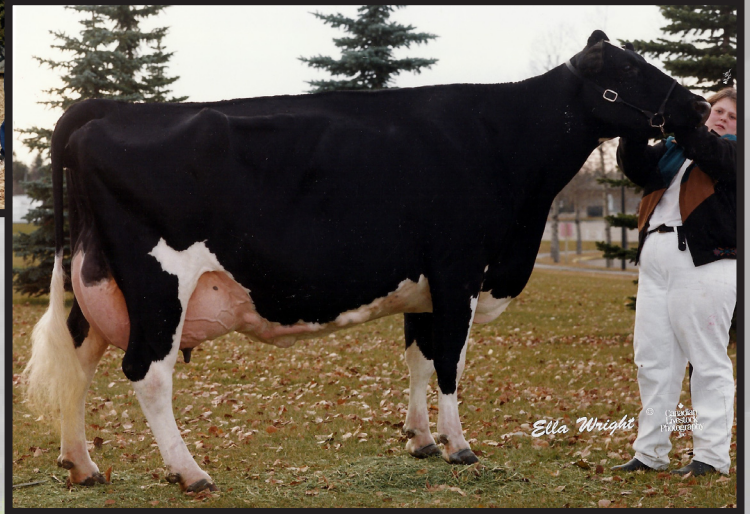
Annie Grand AB Dairy Congress '96

3RD DAM LOT 47: SKYCREST STARDUST Anita (EX-CAN) 5*