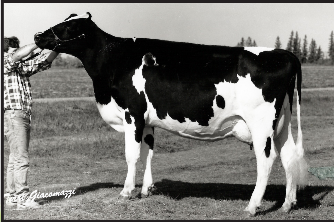
5TH DAM OF LOT 41: SKYCREST OD Ginger (VG-86-5YR-CAN) Res. Jr. Champ Calgary Spring '90