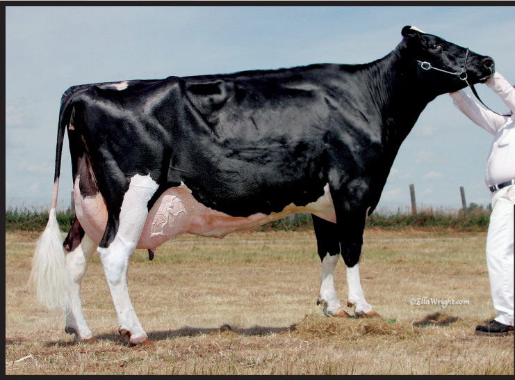
Cam Res. Grand Calgary Spring '04 1st Mature Cow Calgary Spring '06,'04 HM.Grand MB Spring '04